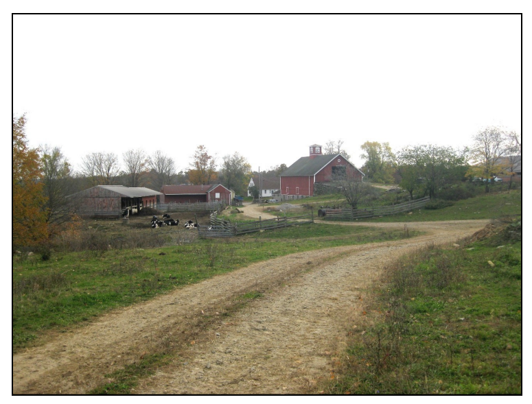
Above: Knowlton Farm Dairy, a joint state-town project located in Ashford

Since inception of the program, development rights have been acquired, or are under contract for acquisition, on 283 farms totaling 37,262 acres. Acre by acre, the program works toward the goal of protecting 85,000 acres of cropland on 130,000 acres of farmland in Connecticut.