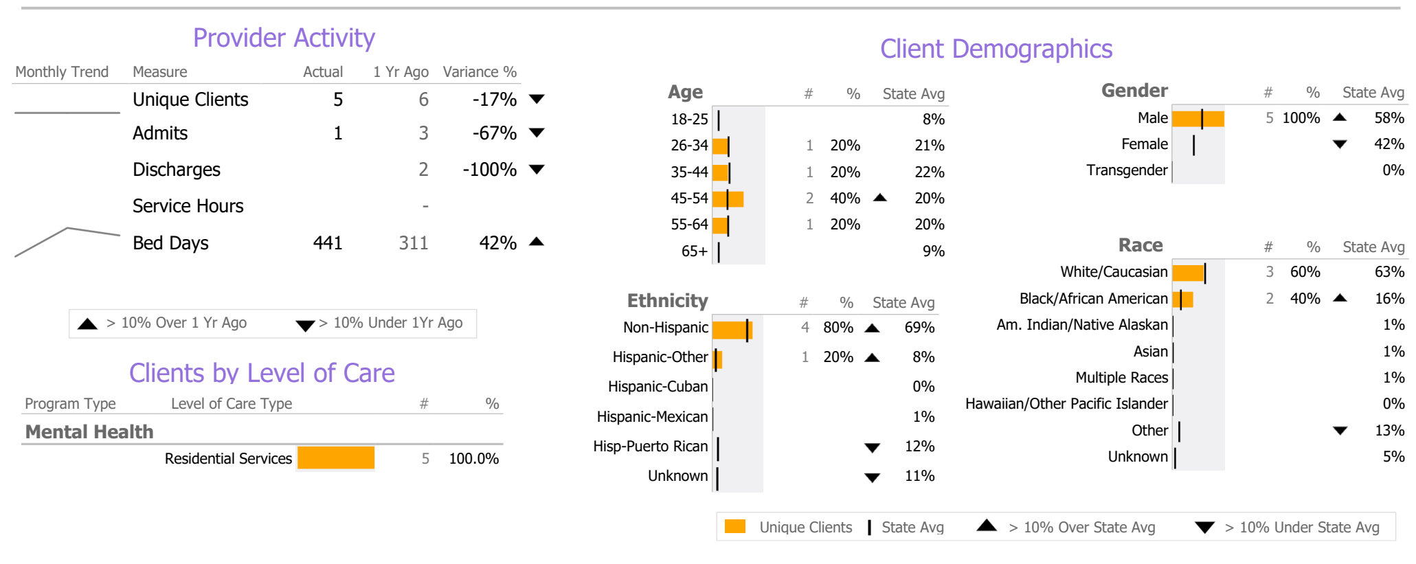
Survey Data Not Available

Reporting Period: July 2020 - September 2020 (Data as of Feb 01, 2021)