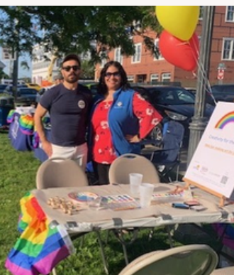
New London Pride