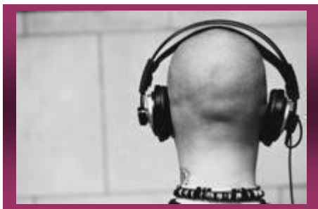
Crunch Time Studio Project Participant Satisfaction Survey

Sixteen young adults from CRMHC ranging in age from 18-25 years participated in this venture. All expressed an interest in singing, creating music and/or learning something new. Through this project, they were able to be a part of the creative process, appreciating the patience of the instructors working with them; as well as realizing the time and effort it takes to create and produce something that was their own. Most importantly, it was a time to work together as a team and to have fun in the process. Plans for the next cycle include learning graphic arts skills and making a video.