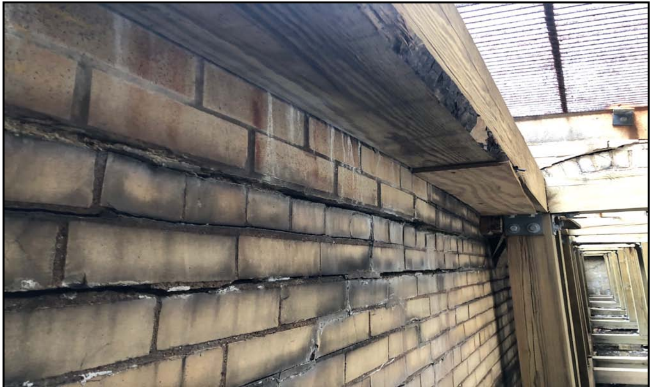
PHOTO 6 – Area way Wall Joint Deterioration and Lateral Displacement