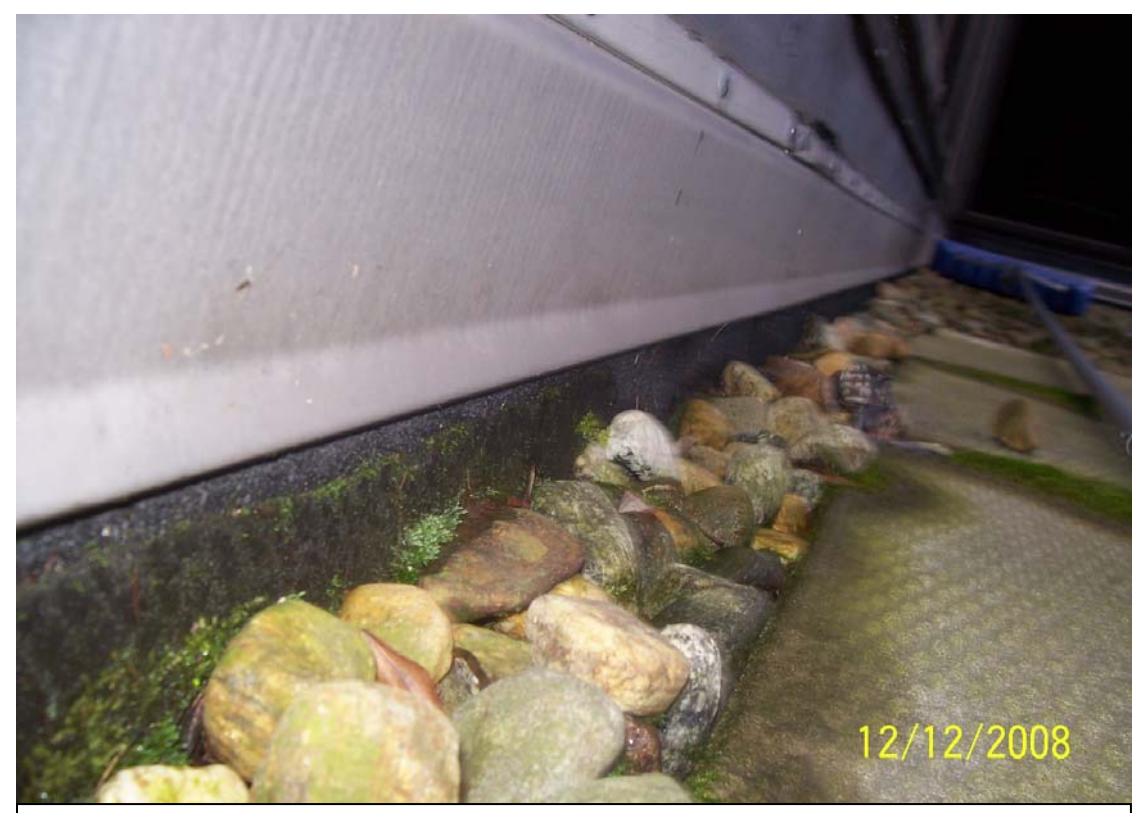
Moss Growing on Roofing Member below Window Sill on 7<sup>th</sup> Floor Roof (Located directly above leak on 6<sup>th</sup> Floor)