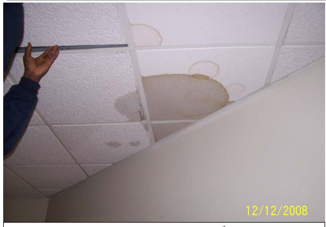
Water Damage in Conference Room on the \boldsymbol{6}^{th} Floor