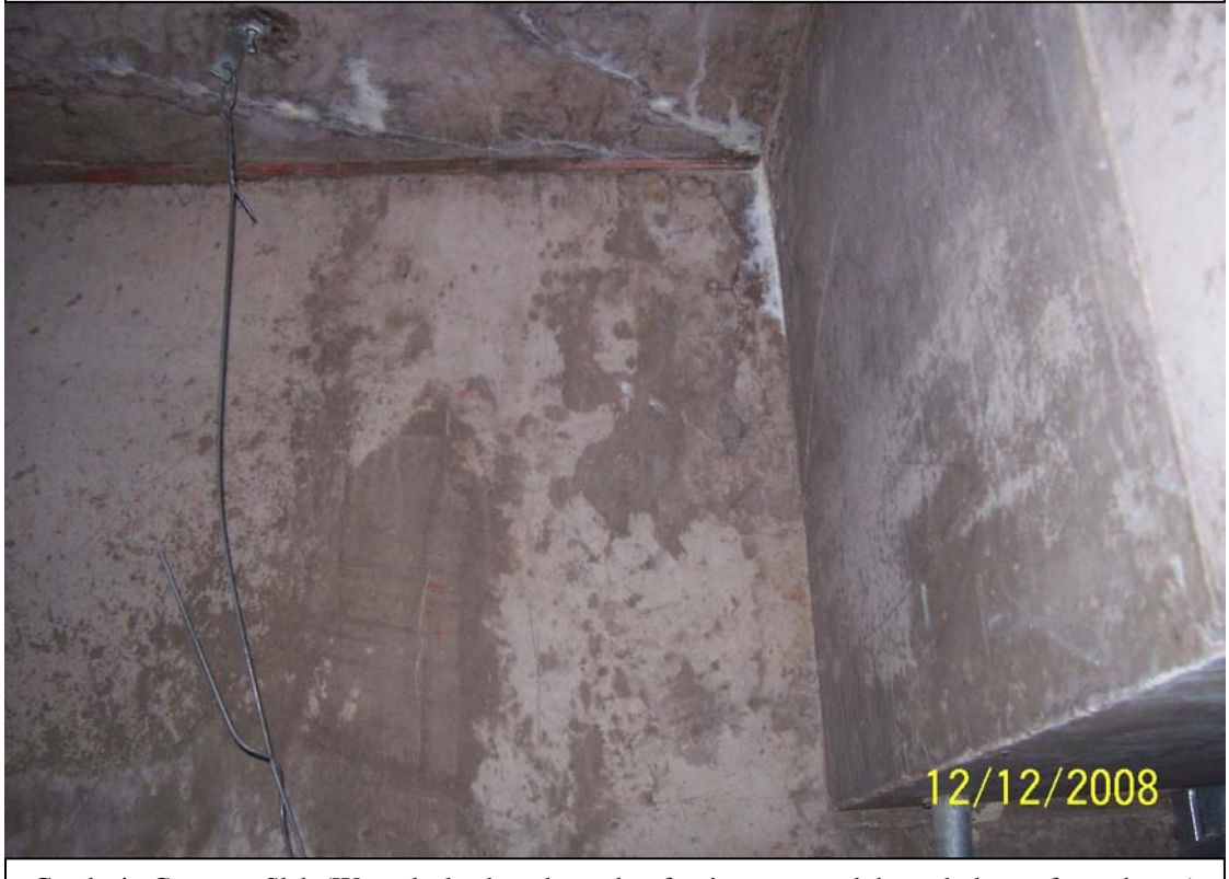
Cracks in Concrete Slab (Water leaks though cracks after in penetrated through the roof membrane)