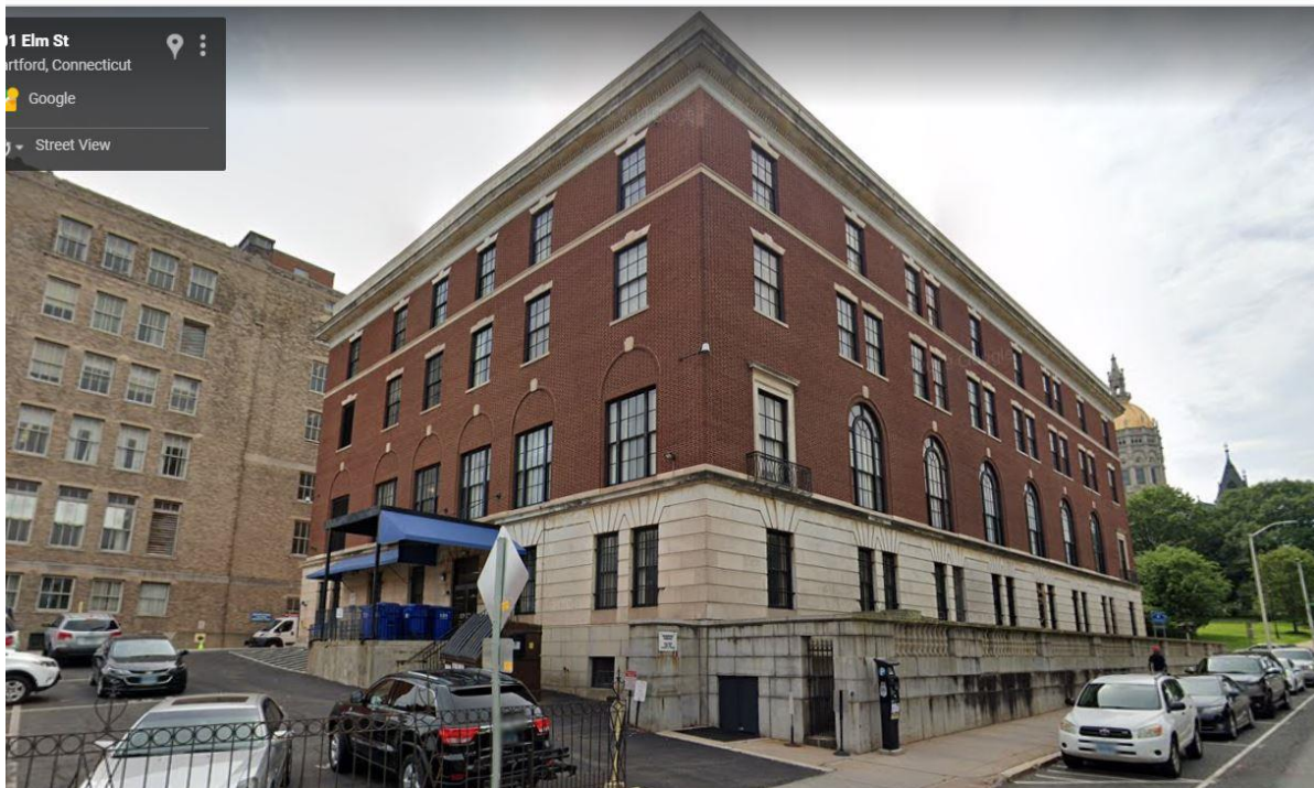
Figure 5: 30 Trinity Street (Elm Street View)