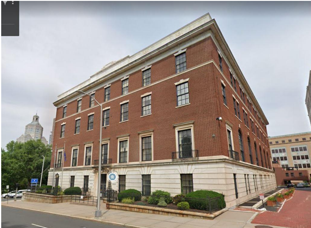
Figure 4: 30 Trinity Street (Trinity Street View)