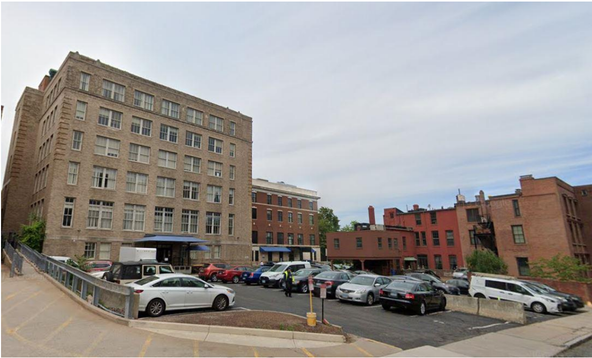
Figure 2: 18-20 Trinity Street ( Clinton Street View)