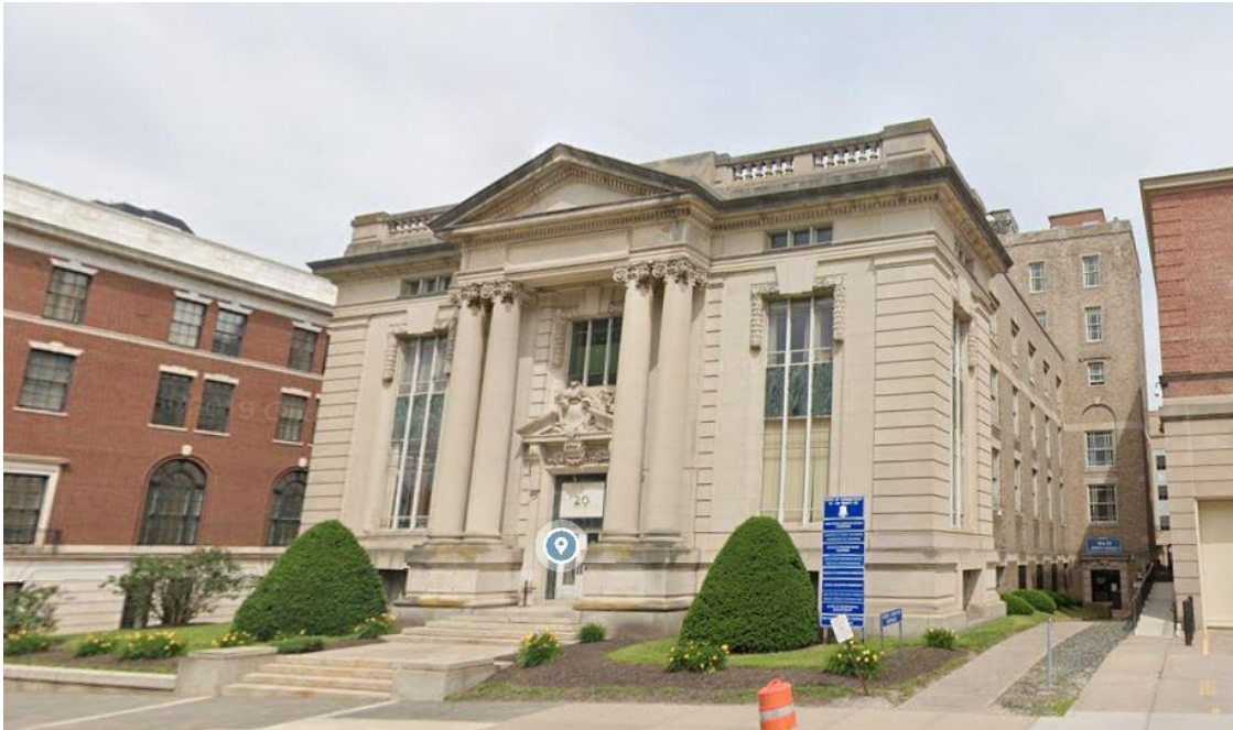
Figure 1: 18-20 Trinity Street (Trinity Street View)