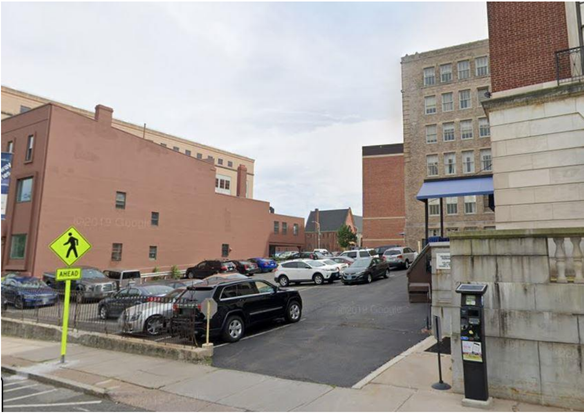
Figure 6: 30 Trinity Street Parking