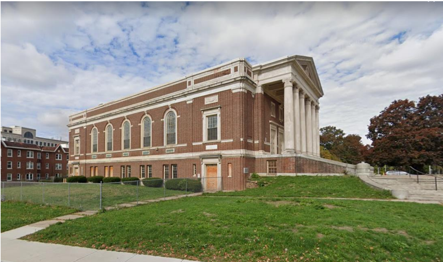
Figure 2: 129 Lafayette Street ( Russ Street View)