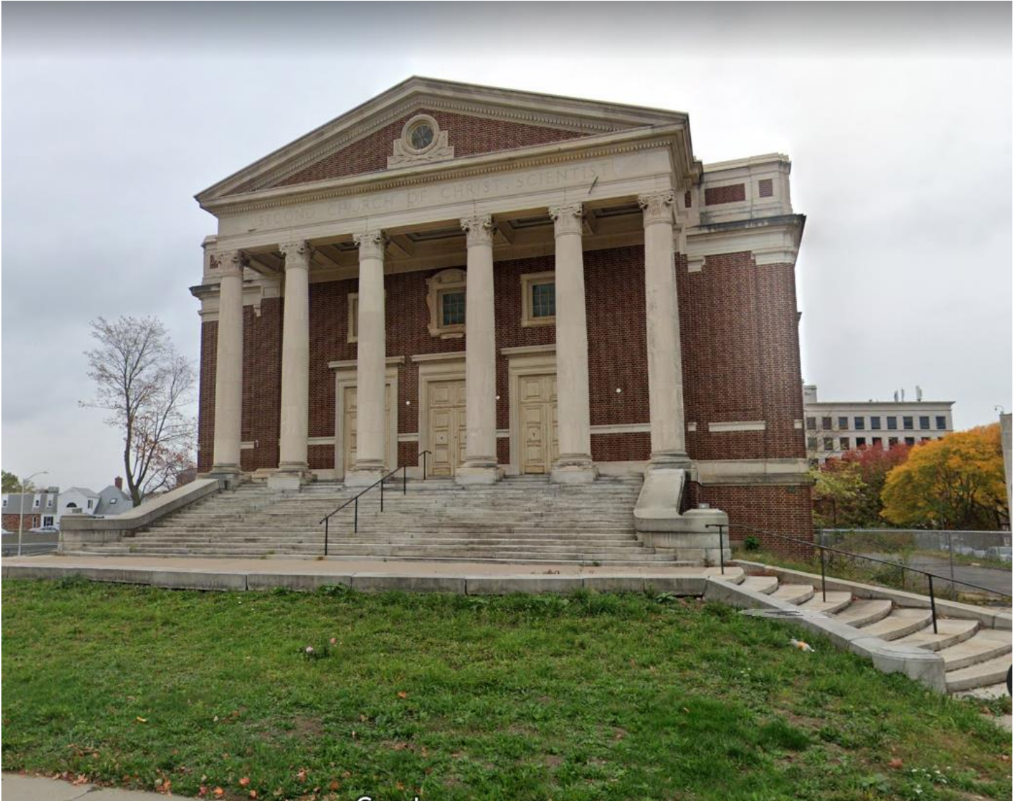
Figure 1: 129 Lafayette Street (Lafayette Street View)