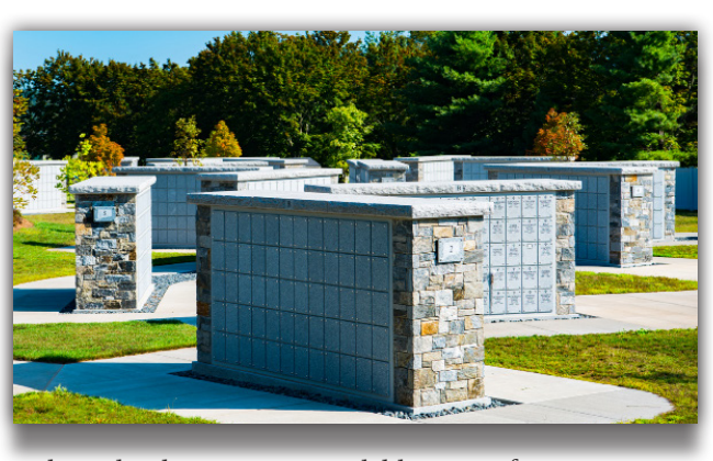
The Columbarium is an available option for Veterans and their spouses who choose to be cremated and not placed in the ground.

Additional cemetery rules and regulations are available on our website: www.portal.ct.gov/DVA