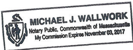
(Notary Seal or Stamp)

In witness whereof I hereunto set my hand.