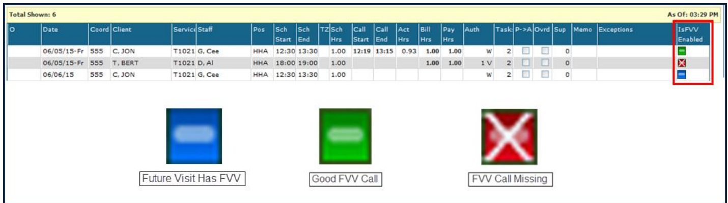
Figure 2: FVV Icons in Santrax Maintenance