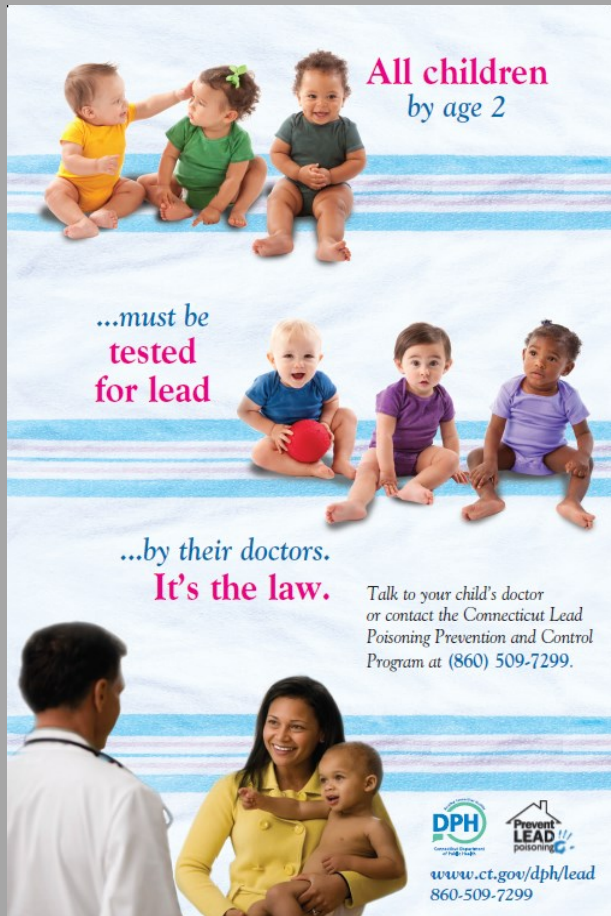
#1. Poster in English