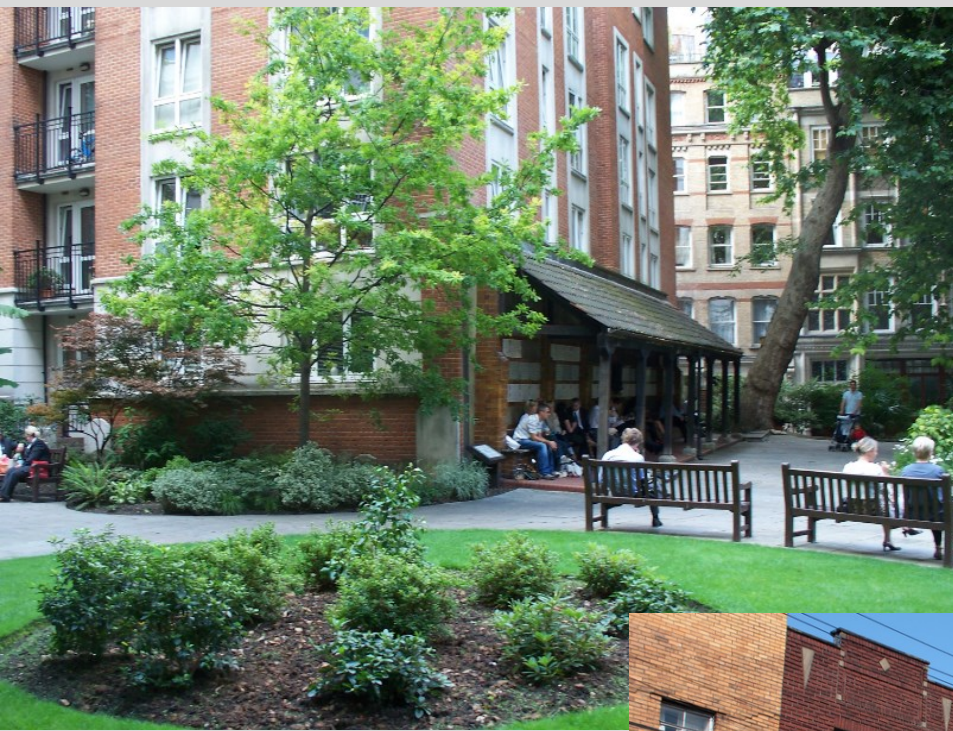
Above: Alexandria, VA