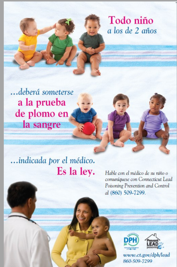
#2. Poster in Spanish