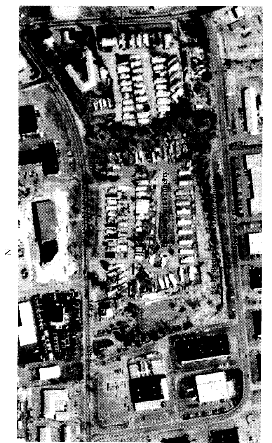
Appendix A. Aerial Photo of East Shore Trailer Park Site (1990)