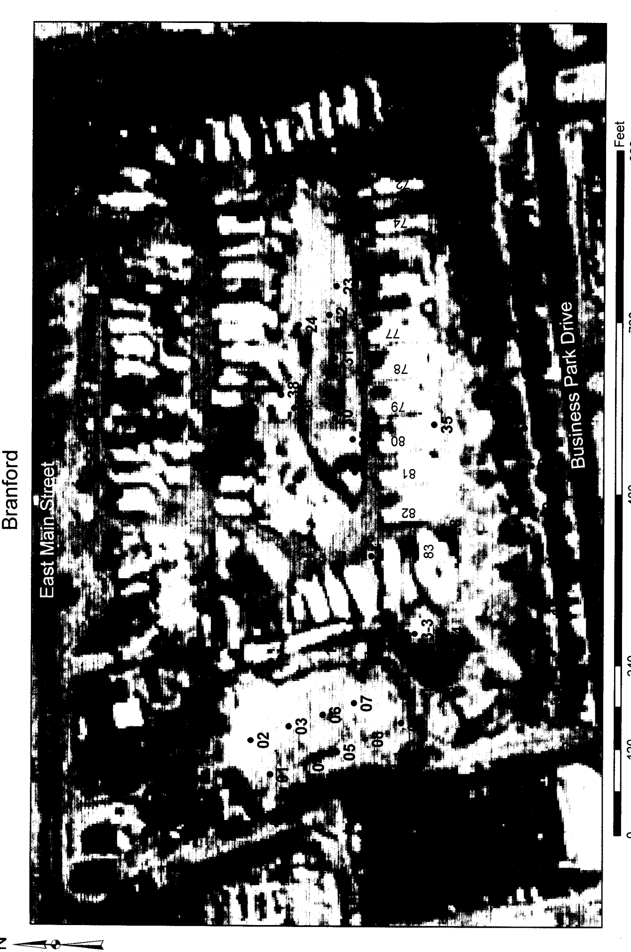
Soil samples collected July 22 - 23, 2003 (red) and October 20 - 21, 2003 (purple) by the Connecticut Department of Environmental Protection. Locations correspond to geoprobe, surface sample, and groundwater locations on attached tables. Sample locations from 7/2003 have been geolocated using GPS. Sample locations from 10/2003 are approximate. Map is for illustrative purposes only. Data may not be complete or current. Prepared by K. Lundeen (DEP), printed 5/10/2004.