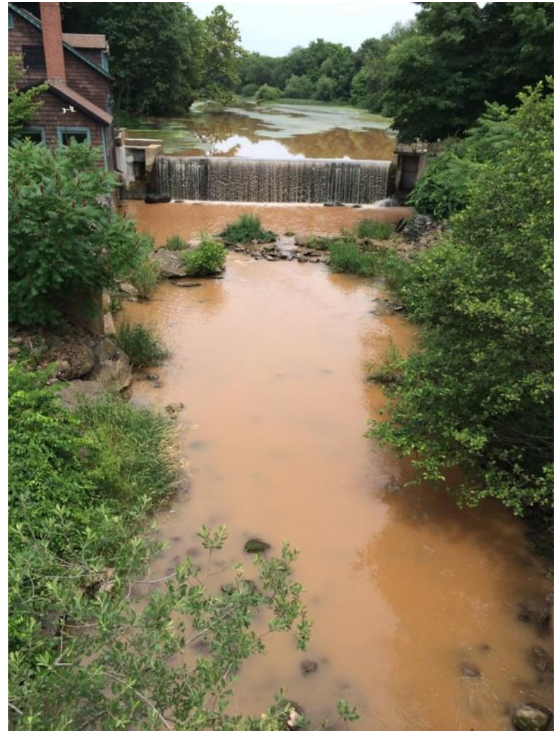
Turbid water caused by agricultural runoff subsequent to a heavy precipitation event