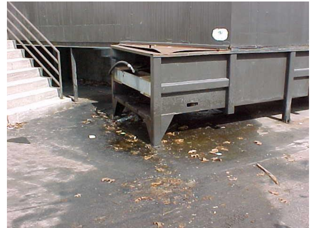
Hydraulic oil discharge from industrial compactor