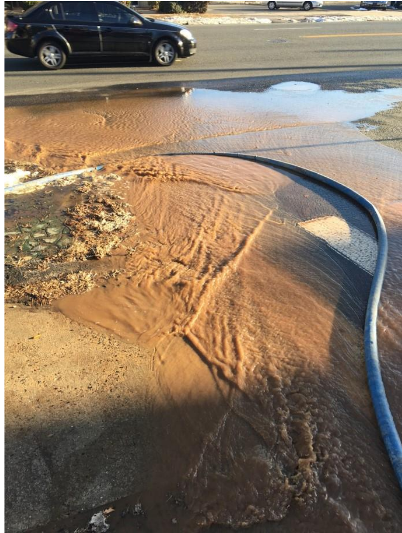
Improper dewatering method resulting in turbid water exiting construction site