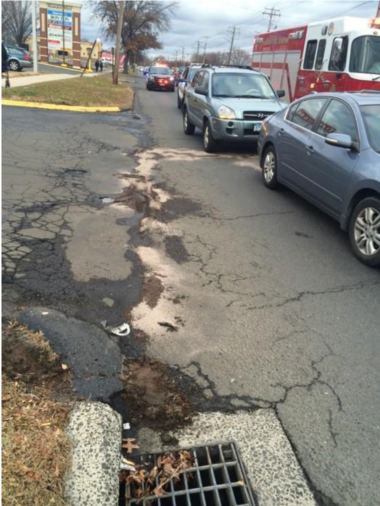
Vehicle collision resulting in oil spill. Speedy dry used to absorb oil and soil berm created prior to storm drain to avoid further migration of spill