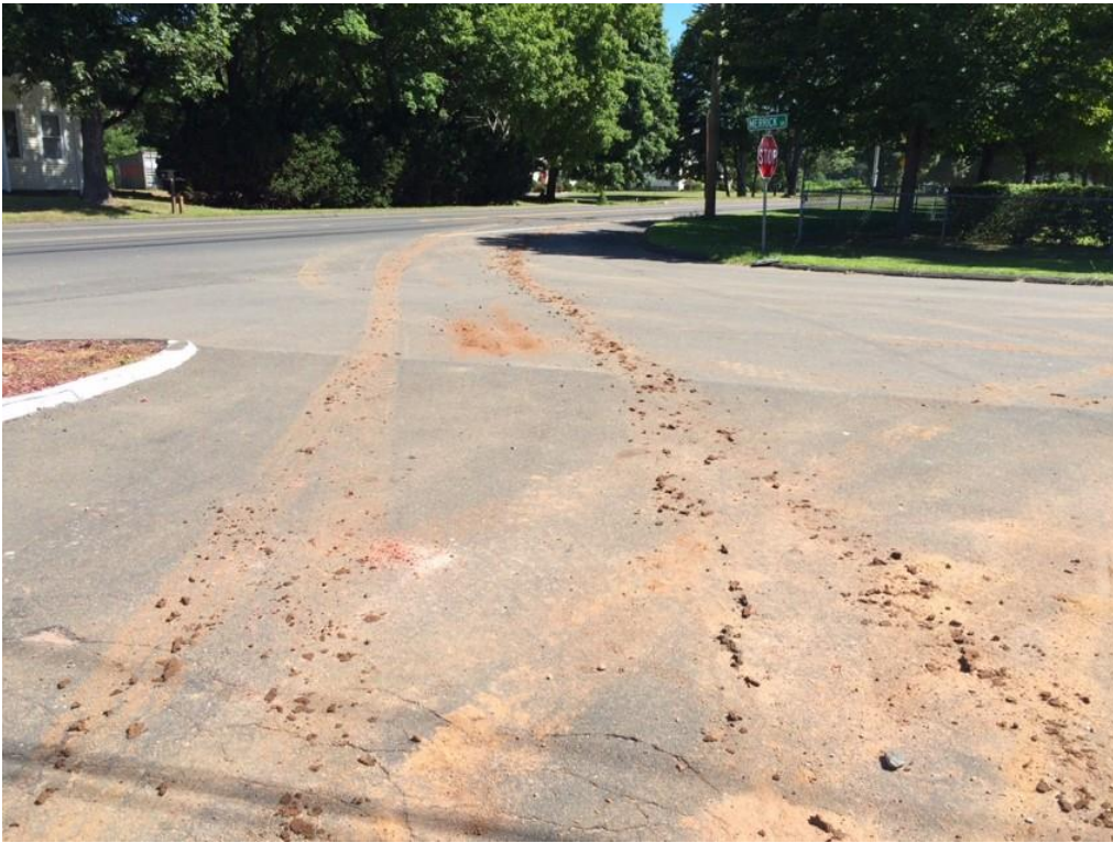
Vehicles tracking sediment from construction site resulting from lack of anti-tracking pad