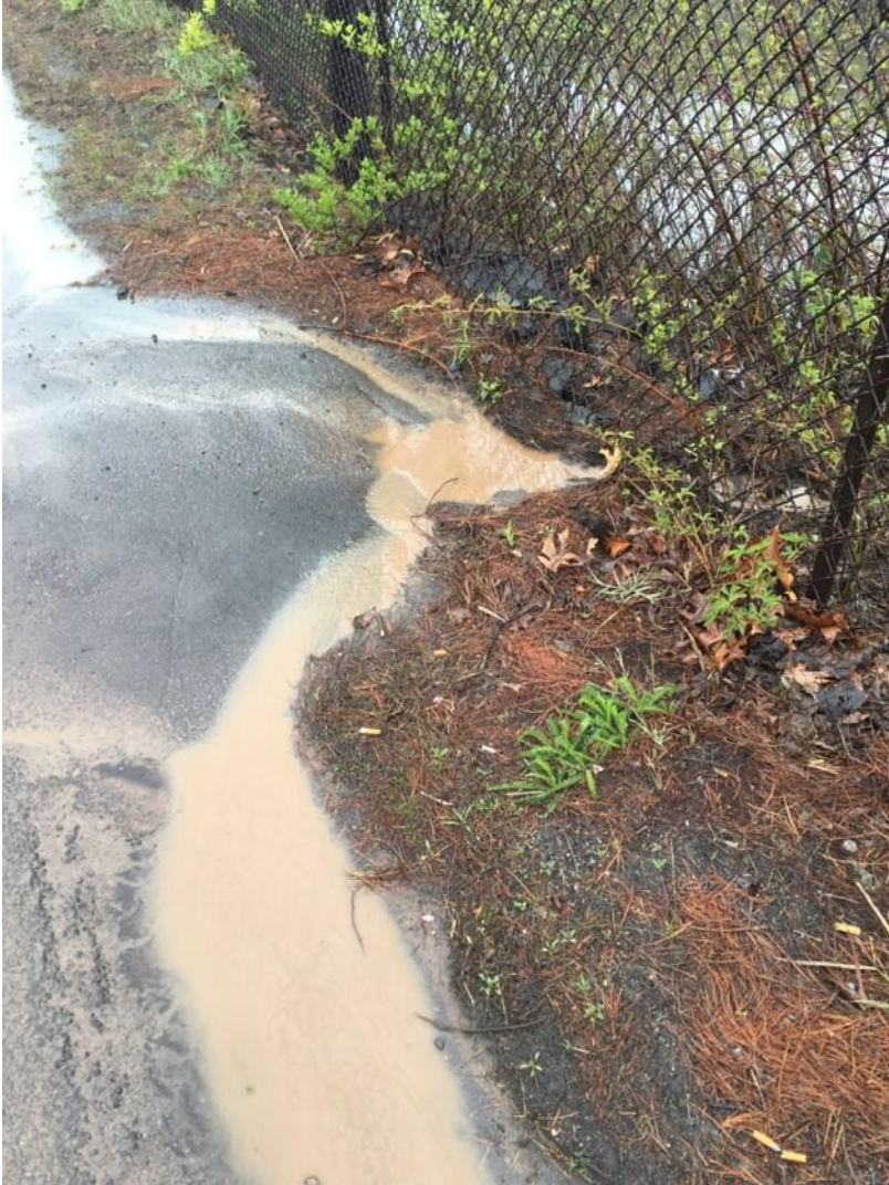
Improper erosion controls resulting in sediment runoff during precipitation event