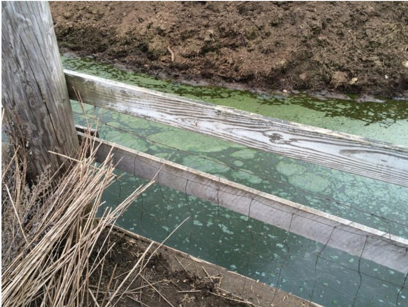
Poor manure management resulting in contaminated runoff