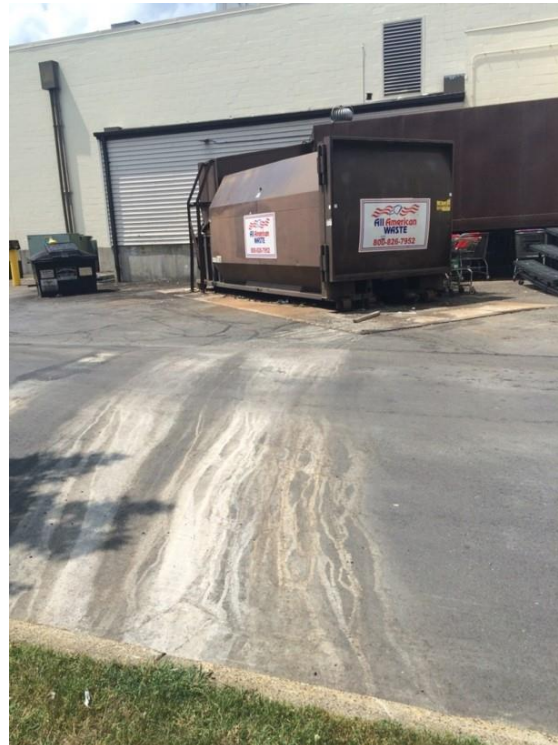
Industrial compactor leaching to adjacent storm drain (storm drain not pictured)