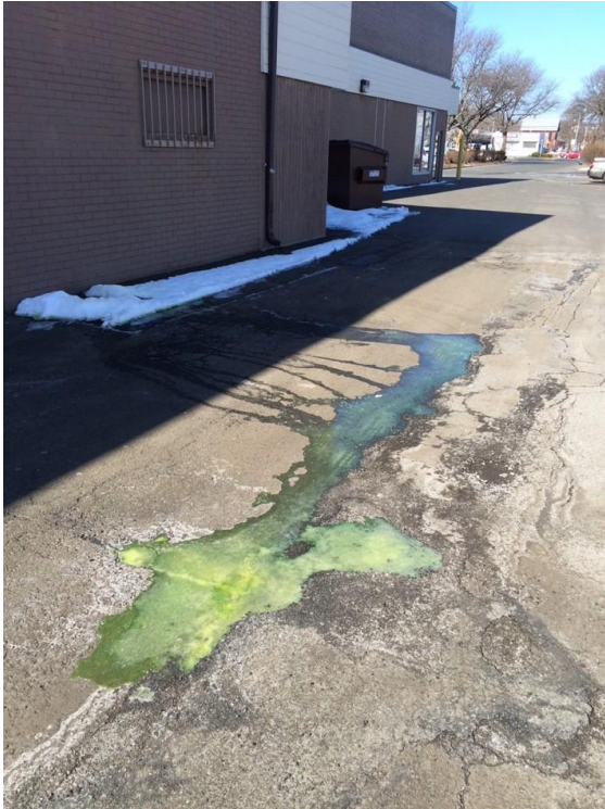
Illicit disposal of industrial cleaner