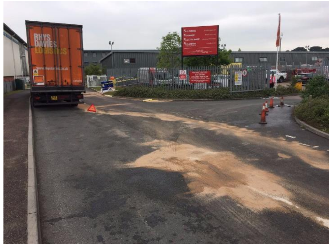
Oil spill with sand used as absorbent material