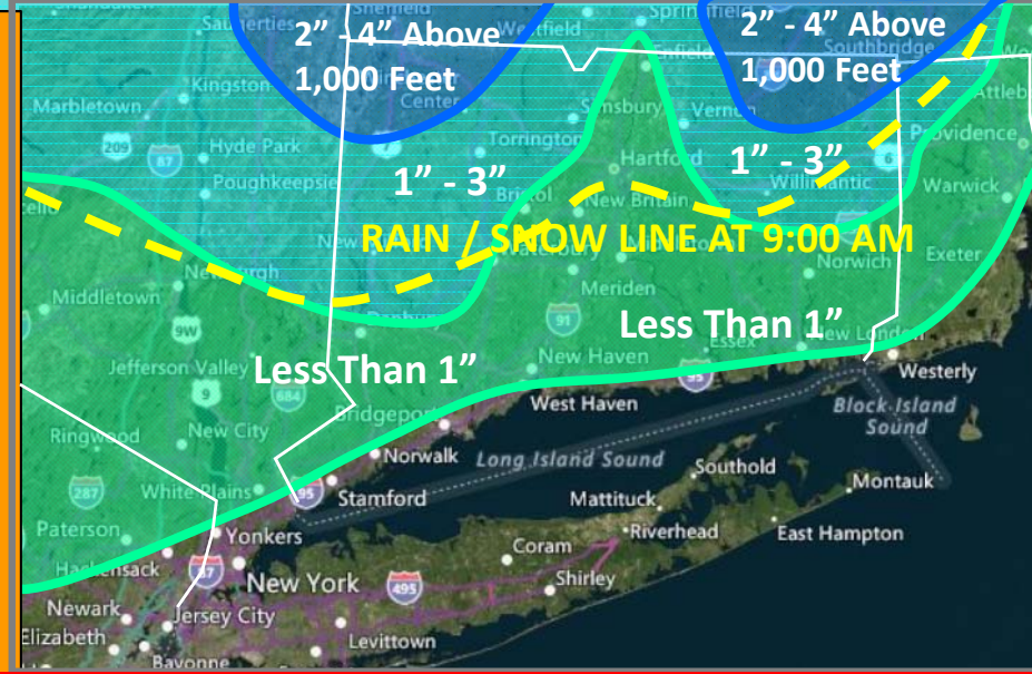
Hourly Wet Snowfall In Northern CT (Mostly on Grassy Surfaces) and Temperatures