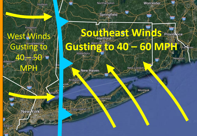
MAXIMUM WIND GUSTS AND HEAVY RAINFALL TIMING