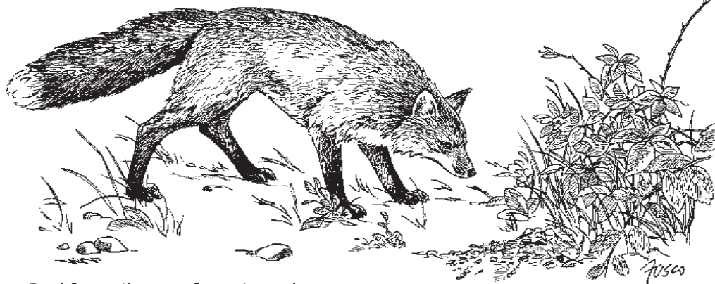
Red fox tails are often tipped with white fur.

Foxes are normally quite secretive and not easy to see. Sometimes foxes living near towns become used to people and may be seen more often.