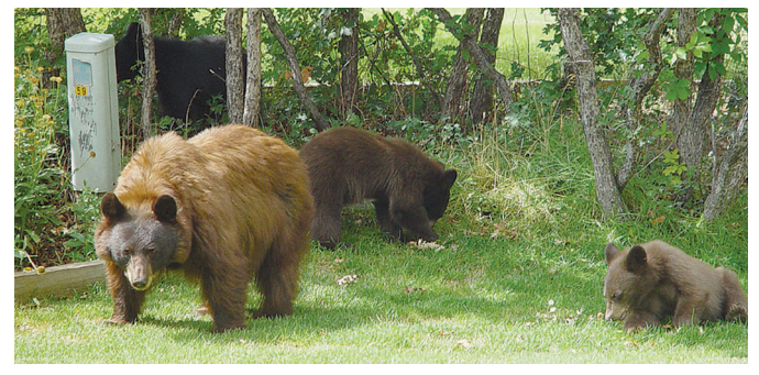
Don't force a mother black bear to defend her cubs.

If you live in or travel to bear country and own a dog, sooner or later your dog may encounter a bear. Understanding why some encounters end peacefully and others end with dogs and people being injured or killed can help keep people, dogs and bears safe.