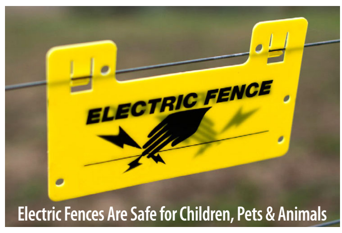
Getting zapped may hurt, but it won't harm.

Here are two options if your soil does not have enough moisture to conduct electricity. 1) Use an all "hot" ( positive ) system with a negative grounding apron (see next page) to complete the circuit. Or 2) Set up a positive/negative system , with the top wire and lowest wire as "hot" (positive) ... a bear that tries to go over or under the fence will get shocked.