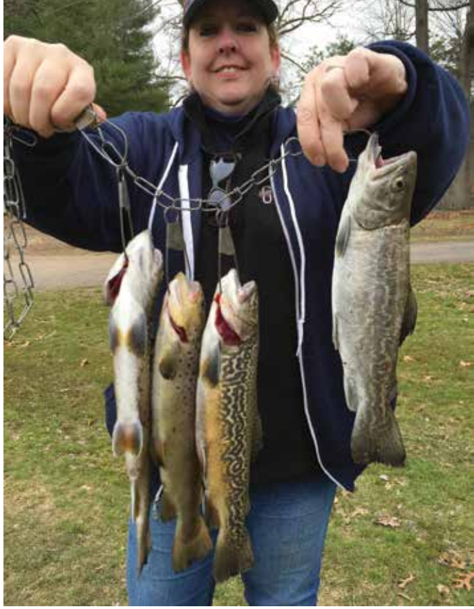
There is a misconception that practicing catch-and-release with stocked trout in many Connecticut waters will increase or sustain trout populations. The majority of stocked waters provide a seasonal trout fishery and are not able to support year-round survival (too warm) for hold-overs and spawning. The majority of stocked trout are done so to support "put-and-take" fisheries.

This is the number one rule of harvesting fish! Only keep fish that are of legal size, within your daily creel limit (maximum number of fish an angler can keep per day), and those you will consume or gift to friends and family (before they become "freezer burned"). Once you commit to harvesting a fish, take proper care to prevent spoilage by putting it directly on ice or keeping it alive. Please do not keep a fish