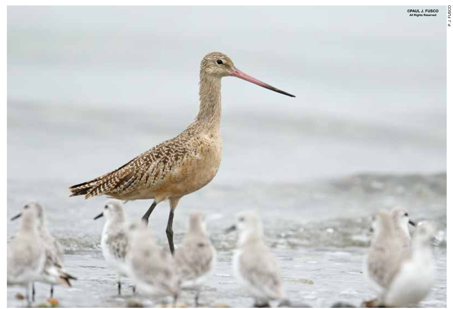
One of our larger shorebirds, a marbled godwit, stands tall over a flock of much smaller sanderlings along the Connecticut shoreline. Shoreline stopover habitat is critically important to migrating shorebirds so they can find food and rest along their southbound journey.

PERIODICALS POSTAGE PAID AT BURLINGTON, CT, AND ADDITIONAL OFFICES