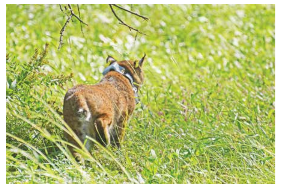
New ear tags and GPS collar can be seen on this bocat after just being released. Biologists will continuously monitor this collared bobcat.

To help determine the diet of bobcats, Division biologists will also be collecting road-killed bobcats so that stomach contents can be examined. Anyone who finds a roadkilled bobcat is urged to call the Wildlife Division at 860-424-3011 and provide location details. In addition, if it is at all possible to