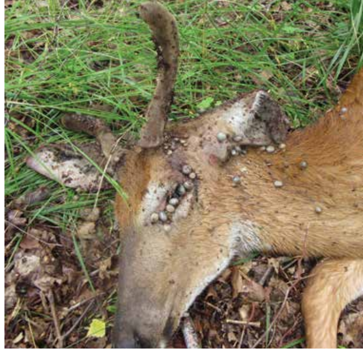
Young male deer with lone star tick infestation in South Norwalk, CT.

star tick and has questions about the tick and diseases it may carry can contact Kirby Stafford with CAES at 860-974-8485, Kirby.stafford@ct.gov.