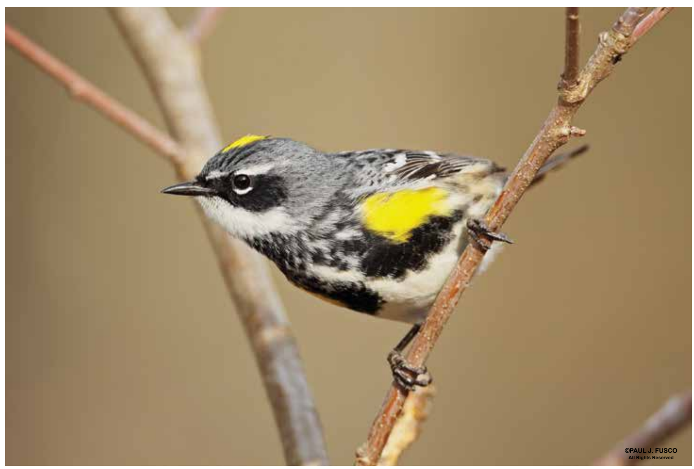
Spring male (above) showing strikingly bold plumage. The yellow-rumped warbler is an early spring migrant.