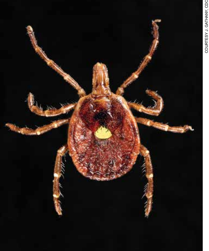
Female lone star tick.

Adult lone star ticks are brown with eight legs and similar in size to the American dog tick. Adult females have a silvery-white spot near the center of the back, while males have varied white streaks or spots around the top edge of the body. The lone star tick is very aggressive and non-specific