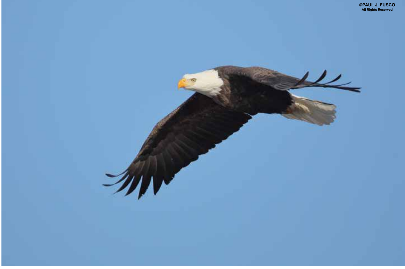
The bald eagle is only found in North America. Golden eagles are distributed across the entire Northern Hemisphere. Only the bald eagle nests in Connecticut.

back. The National Audubon Society called it "one of the greatest achievements for conservation in American history." The National Wildlife Federation said, "This is a man-on-the-moon moment for wildlife."