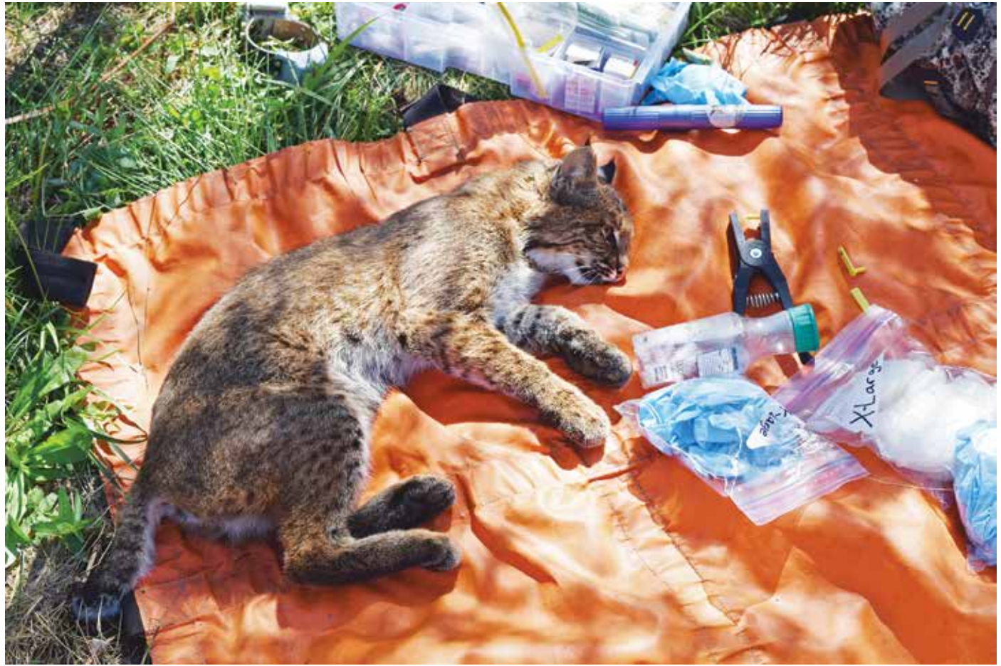
A bobcat immobilized with drugs is about to be weighed, ear-tagged, and radio-collared. Physical measurements, such as length and girth, and hair and tissue samples are collected.

provide information on the date and location of the sighting, the town in which the sighting took place, the number of bobcats observed, and whether you saw ear tags or collars on any of them. Sightings can be from a trail camera if you are able to positively identify the animal as a bobcat. Additional comments or contact information with your observations also are useful. Observations from the public are greatly appreciated and will be invaluable contributions towards understanding the current bobcat population in Connecticut.