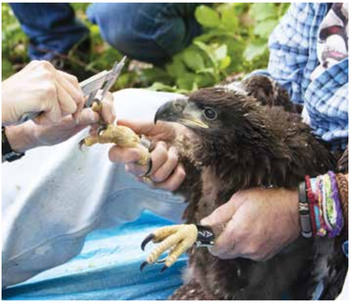
On the ground, biologists measure the feet and beak to determine the sex of the chick. The chick also gets an aluminum band with a unique nine-digit number and a black band with two large characters.