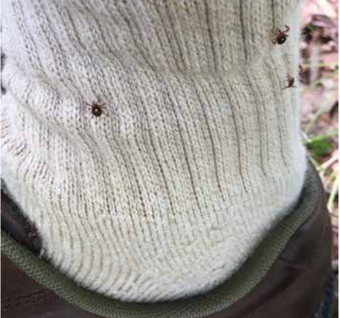
Female lone star ticks on a sock.