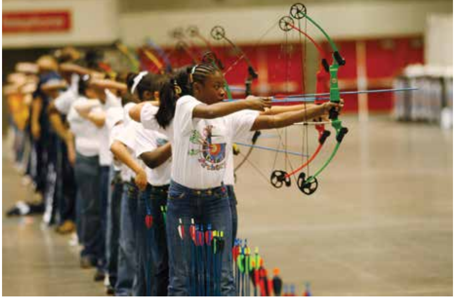
National Archery in the Schools (NASP) lessons teach archery to students in a safe environment during school hours, usually as part of physical education classes, and is presented by teachers certified by NASP through training they received from the DEEP Wildlife Division.

he National Archery in the Schools Program (NASP) is back in Connecticut! The DEEP Wildlife Division is supporting the relaunch of NASP in the state and is working with new schools, as well as with schools already active in the program to help strengthen their efforts. NASP lessons teach archery to students in a safe environment during school hours, usually as part of physical education classes,