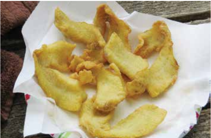
Panfish are abundant in Connecticut waters and can be caught readily year-round. These bluegill fillets were tossed in a dry batter, and after a quick bath in some hot oil made for a delicious meal!

The next time you are having a productive day on the water, consider practicing "selective harvest" with your catch! Keep some panfish or those small and medium size fish for the frying pan, and when you catch that trophy fish take a quick picture and let it go. Your fellow anglers and future generations will thank you when they experience the thrill of catching that same fish, or its offspring!