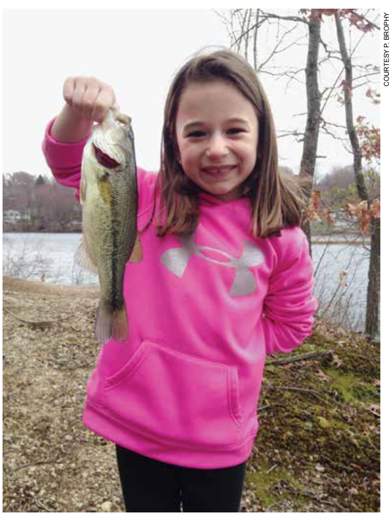
Selective harvest of smaller-sized fish actually helps produce a greater number of large-sized fish.

There is a misconception that the harvest of any bass will be harmful to the fishery. The opposite is true. Many of the state's waterbodies, including many designated as "Bass Management Lakes," have too many small bass. In these waters, the best way to increase the number of larger bass is to actually "thin" (remove) the overabundant small-sized bass. The remaining fish end up with more space and food, enabling them to grow faster and larger. Fisheries biologists have implemented a slot limit regulation in some lakes to encourage the harvest of fish less than 12 inches and limit the harvest of larger, more desirable fish. Striking the right balance for fish and anglers is a focus of warmwater fisheries management.