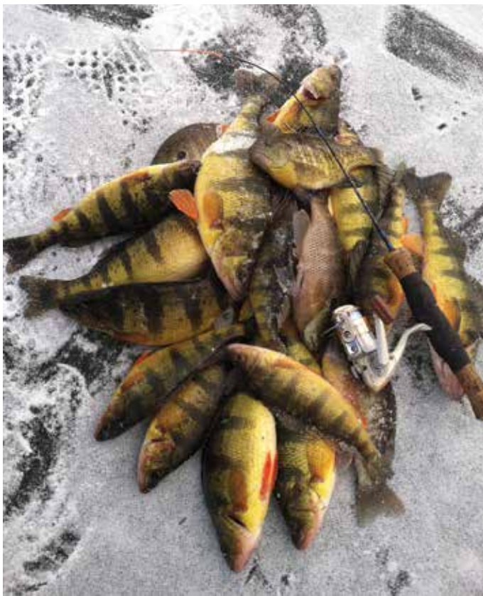
Selective harvest of prolific species, like yellow perch, help keep the fish community in balance.

just to fill a "limit" or to brag about the "big one."