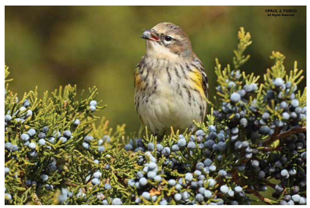
Berries from red cedar are a favorite food for yellow-rumped warblers in fall and winter.

This very active bird can be seen during summer darting out from a perch to catch flying insects, showing its yellow rump patch as it flutters.