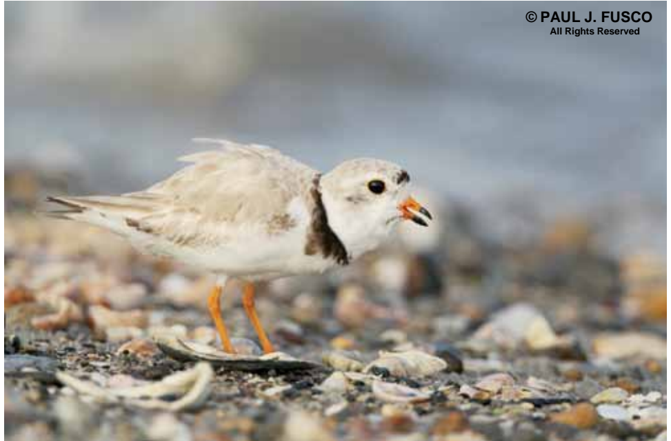
An adult male piping plover keeps a watchful eye over its young. It will not let other plovers near, and will bravely fend off gulls that stray too close.

This year, Connecticut saw a decline in the number of reproductive pairs of piping plovers nesting along the coastline from the previous two years. In 2013, 45 pairs of plovers nested, fledging 82 chicks. The number of nesting pairs in 2013 is down from 52 pairs in 2012 and 51 pairs in 2011. The nesting pairs documented in 2012 and 2011 were all-time high numbers for Connecticut, so this small decline in nesting pairs is not cause for alarm. The fewer pairs of plovers observed statewide surprised Wildlife Division staff because superstorm Sandy altered many of our coastal beaches and created an overall increase in nesting habitat across the state. It was hoped that the additional nesting habitat would lead to an increase in the number of piping plovers deciding to stay in Connecticut to nest. Regionwide, piping plover census results in 2013 may shed some light on the decrease in pairs, particularly if neighboring states saw unusual increases.