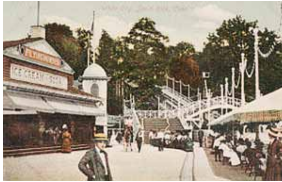
Savin Rock in West Haven drew hundreds of thousands of visitors each summer. A mini-Coney Island, the amusement park had cut off access to the shoreline and was combating immense crowds and associated infrastructure problems.

At that meeting Turner made it clear that despite budgets, land availability, prevailing politics, and all other roadblocks, the Connecticut coastline was an acquisition priority and should be acted on now, before rising land values pushed