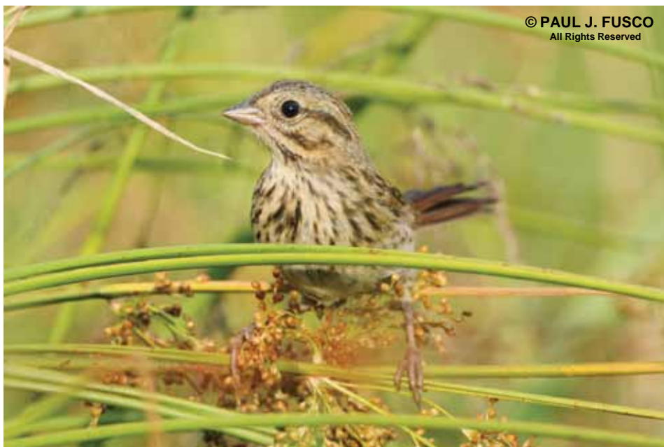
Juvenile song sparrows are more buffy and finely streaked than adults. They also lack the central breast spot. Juveniles will molt into their first winter plumage by mid-fall.

According to data from the National Audubon Society and the U.S. Geological Survey, song sparrow populations in Connecticut have declined by approximately 52% over the last 40 years. Although the song sparrow is considered to be one of our most common songbird species, the population status of this bright songster is trending downward.