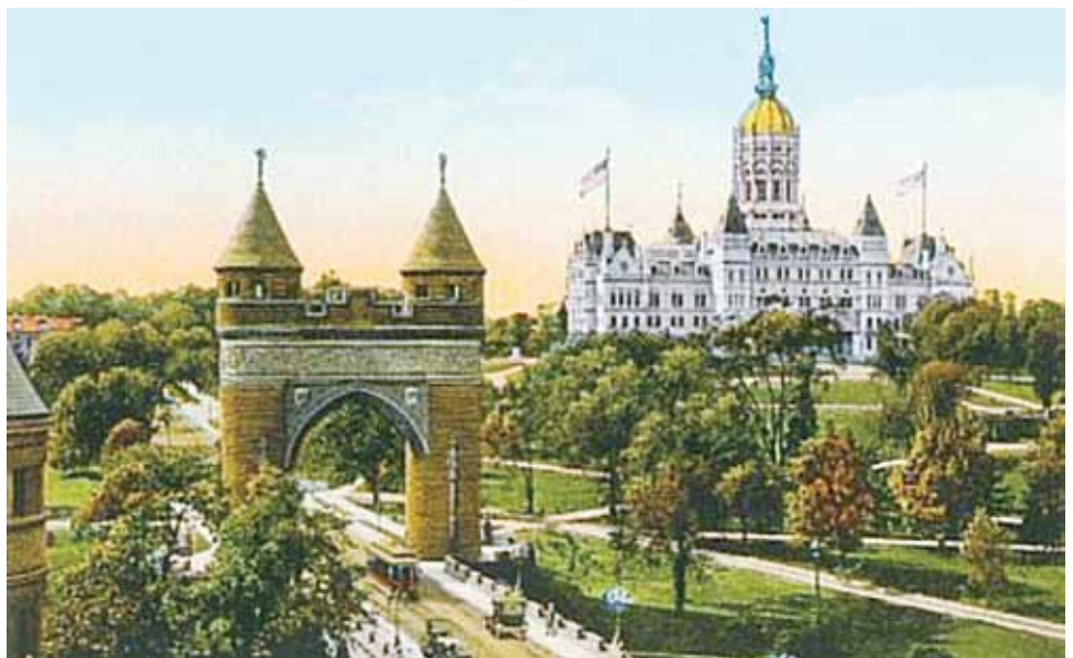
This mid-1910s view of Hartford depicts the State Capitol, early motorcars, and a trolley passing under the Memorial Arch. It was via the more than 1,100-mile trolley network that most people travelled around the state.

Turner's plan for the park at Hammonasset Beach would need to