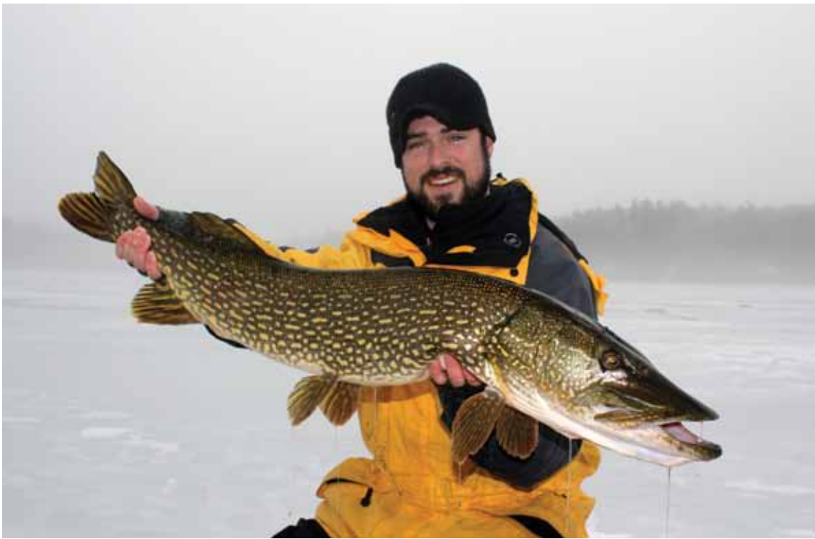
The northern pike is the largest strictly freshwater gamefish in Connecticut and remains active all winter long. This angler will vouch that battling a fish of this size while on the ice is quite the thrill.

Keeping the Hole Open: A skimmer, or ice ladle, is the easiest way to clear ice chips and slush from the hole. Occasionally, the hole may freeze solid while you are fishing. No worries, use your skimmer to re-open the hole.