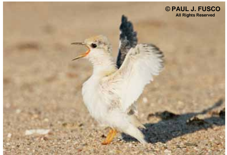
A least tern chick gets excited when it hears the call from one of its parents bringing in food.

Human disturbance of tern colonies is documented by staff and volunteers every nesting season. Too many people walking on narrow sand spits, even those who are curious or well-meaning, can cause disturbance. When a threat, such as people