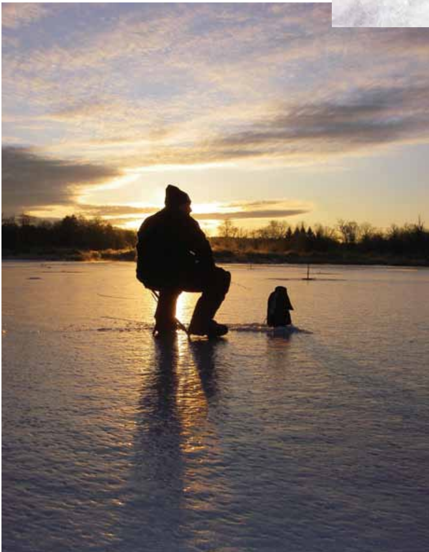
K. BROATCH, DEEP INLAND FISHERIES (2)