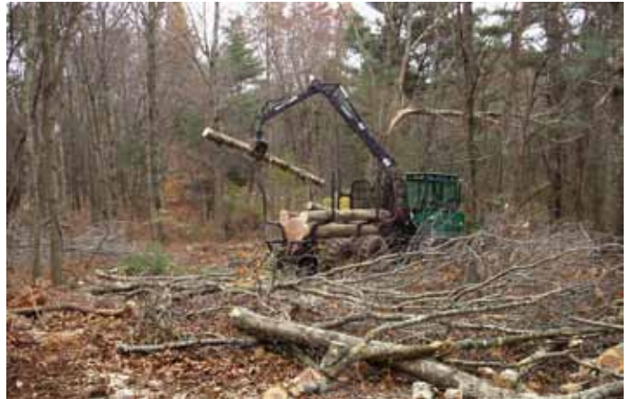
The upper bole wood held by the arm of the forwarder is too small to be sawtimber but is perfect for biomass chipping. The wood was being harvested as part of a sustainable forestry practice to improve wildlife habitat.

eration in the design. A mezzanine winds throughout the facility, providing complete access to key components for educational purposes. Signs posted along the mezzanine explain how the biomass system works and what particular design components of the construction made the facility worthy of LEEDS recognition and the winner of the 2013 Alexion