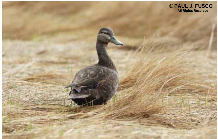
Habitat restoration should result in increased fitness for hen black ducks.

Due to a number of circumstances, the Wildlife Division has a great opportunity to assess this important question right now. The Division has already conducted a wintering black duck study for three years to assess survival, available food resources, and energetic demand. Thus, quite a bit is already known about black duck wintering ecology. In addition, a 60-acre wetland restoration project is planned for Silver Sands State Park in Milford. This project has received all of the necessary permits and is ready to be implemented. Implementation of the restoration project was delayed so that biologists could collect two years of baseline data on duck abundance, food availability, and energetic demand at Silver Sands prior to the restoration project. Once the restoration project is completed, biologists will