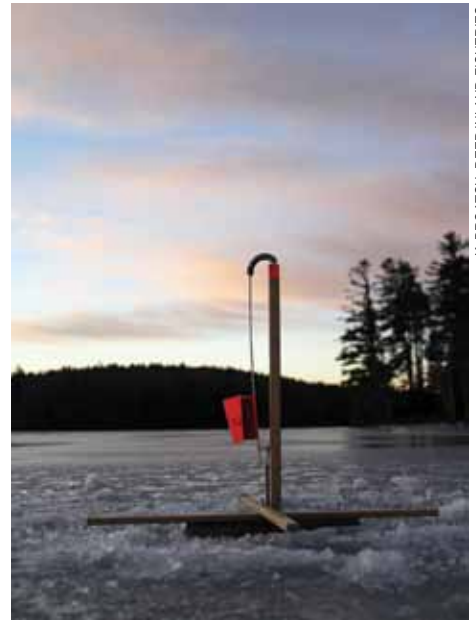
K. BROATCH, DEEP INLAND FISHERIES

Ice fishing is the perfect way to enjoy the fresh air and picturesque charm of a New England winter day with friends and the whole family! An ice angler shows off a healthy largemouth bass (top left), and a tip-up with scenic Connecticut in the background (top right).