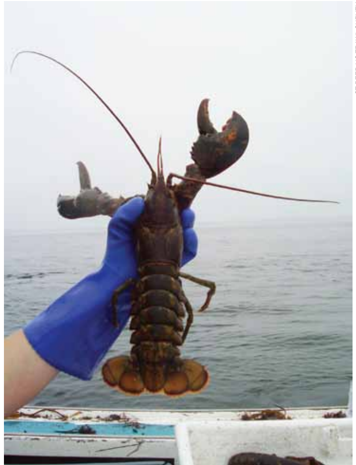
CT DEEP LIS TRAWL SURVEY

Beginning with evidence from the Long Island Sound 1999 die-off and combined with research funded to get at the cause of the die-off, reasons why lobsters are thriving north of Cape Cod but failing to the south are now becoming clear. Several field and laboratory studies identified the lobster’s physiological stress threshold at about 20°C (69°F). Data from the DEEP Water Quality Survey were bolstered by continuous-read temperature profiles recorded in lobster traps with the help of cooperating Connecticut commercial lobstermen who monitored the temperature equipment throughout their harvest season. UConn researchers then generated ‘temperature maps’ through analysis of all the available bottom water temperature data, mapping the area and duration of bottom water above 20.5°C for the entire Sound each year from 1988 to 2007. The summation of area above the lobster’s stress threshold for all days each year became a stress index for lobster in the Sound. The median value of this index was 69% higher for years 1998-2007 compared to 1988-1997. When the population model was rerun with various higher rates of non-fishing mortality in years after 1997, model results best matched the abundance trend and size ranges