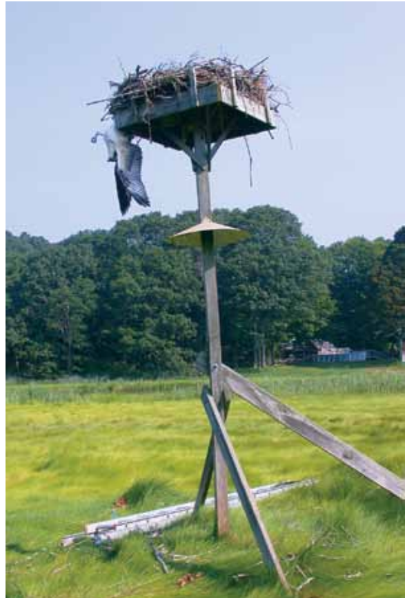
This past summer, a juvenile osprey was found dead, tangled in fishing line and hanging from its nest platform in Old Lyme. Ospreys are notorious for "decorating" their nests with pieces of plastic and other debris, such as fishing line, plastic bags, deflated balloons, kite string, and ribbon. These items can be deadly to the young and adults. The proper disposal of fishing line in a recycling container located at popular fishing areas throughout the state could have prevented this tragic death.