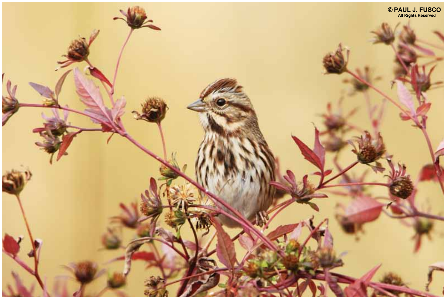
Often found in close proximity to people, the song sparrow is one of our best known and most widely distributed songbirds.

their requirements of open habitat with thick brushy cover are met. Historically, populations benefitted from human landscape transformations, including the clearing of eastern forests for agriculture. Suburbanization and similar development have also benefitted song sparrows to a lesser extent.