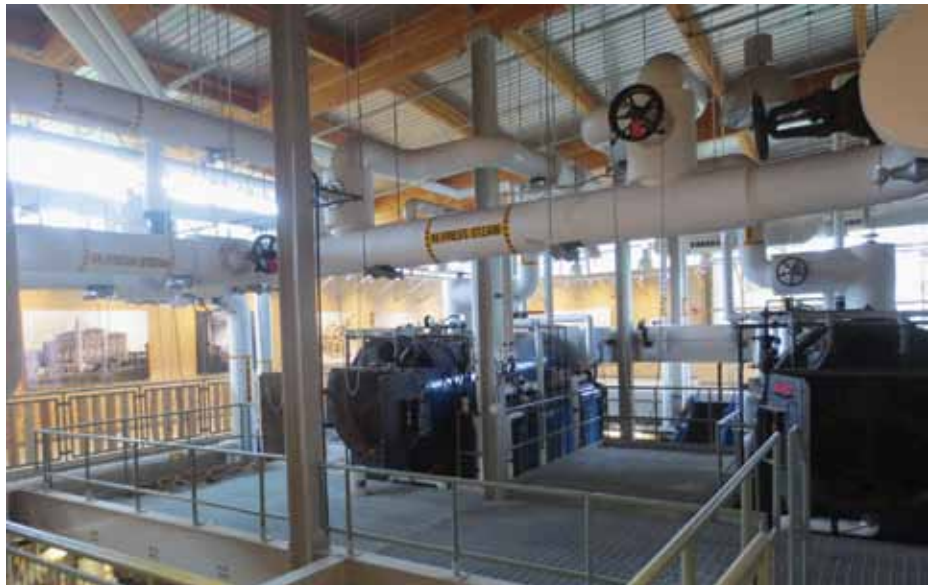
Educational pictures and posters line the mezzanine behind the two Messersmith biomass boilers at The Hotchkiss School in Lakeville. The laminated wood beams above the boilers are made from Forest Stewardship Council certified forests.