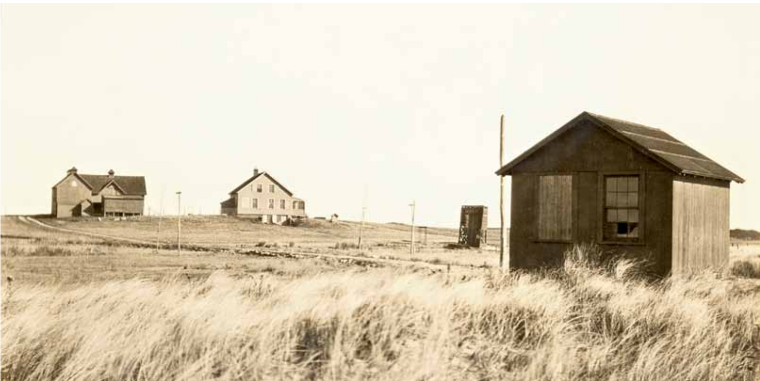
Before it became a state park, Hammonasset Beach was home to many small farmsteads with their associated outbuildings and access roads. The building in the center of this photograph ultimately became today's Meigs Point Nature Center.

encompass broad open spaces and the infrastructure of a city: water, sewage, electricity, food service, roads, and parking areas for the estimated 25,000 visitors that might come each day. As a civil engineer and experienced planner, Turner could prepare for all those realities. The biggest obstacle would be funding.