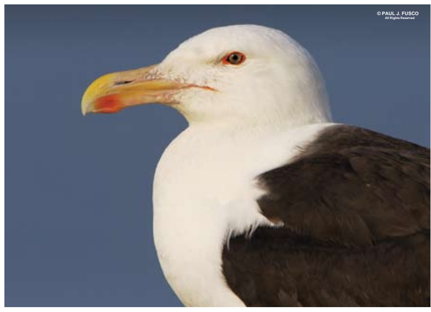
The strong, heavy bill of the great black-backed gull is frequently used for catching and killing prey.