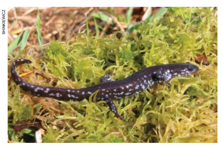
A pure-diploid blue-spotted salamander from the Quinebaug Valley. This amphibian is listed as an endangered species in Connecticut.

of this family are most often encountered on warm, rainy, spring nights when they undertake annual breeding migrations en masse to their ancestral breeding wetlands. Adult mole salamanders use wetlands only for several weeks during spring (with the exception of the marbled salamander, which breeds in the fall), spending the rest of their lives in forests adjacent to breeding wetlands.