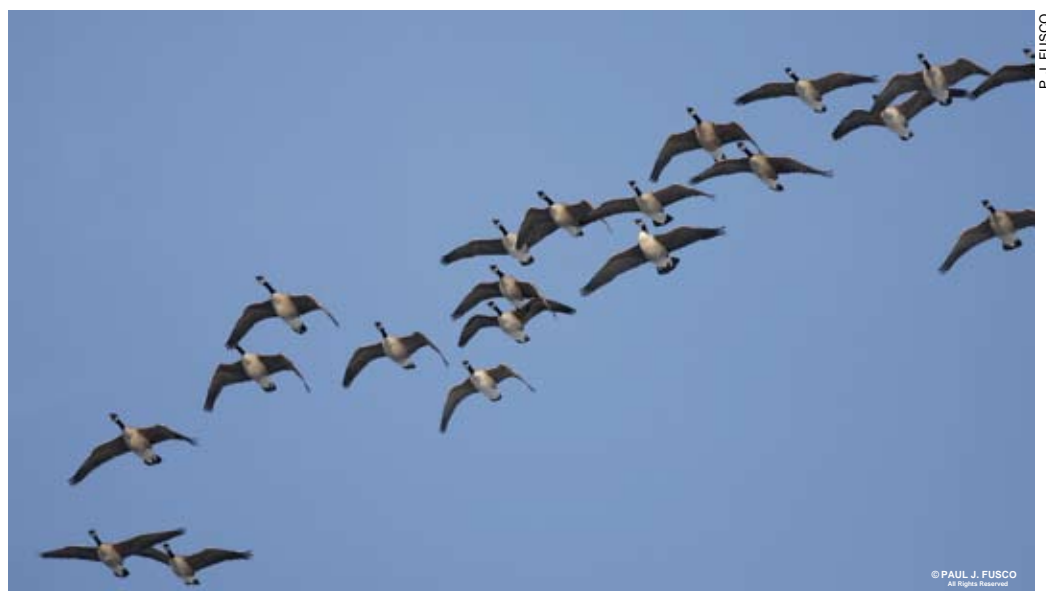
Despite hunting seasons that have become more liberal in recent years, such as the resident goose season, a recent Wildlife Division survey found that waterfowl hunters are spending less time hunting waterfowl.

These motivational preferences were further exemplified in the factors that each group identified as important toward their overall satisfaction. Non-participants were more likely to derive their satisfaction from harvest-related factors than were participants. For instance, firing a lot of shots (achievement-related) on a given duck hunting trip was a greater determinant of satisfaction for non-participants. Appreciative-related satisfactions, such as working with a hunting dog and honing one's individual hunting skills, also were not as important to non-partici-