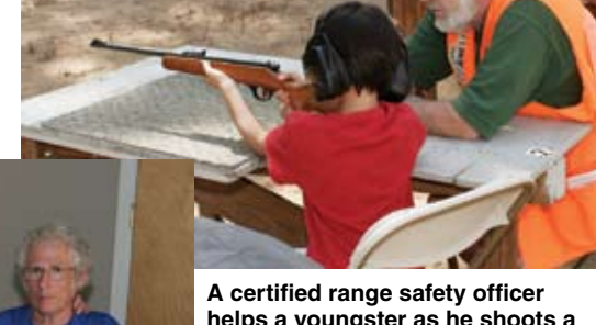
helps a youngster as he shoots a .22 rifle at a target.