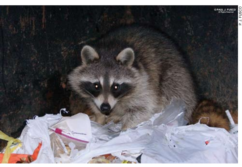
Because of their ability to coexist with humans, raccoons can become a nuisance when they raid garbage cans, damage gardens, and inhabit human structures.

Hunting and Trapping: On farms, where more effective methods are needed to control a large number of animals, hunters and trappers can harvest problem animals on the property during the regulated hunting and trapping seasons or by special permit at other times of the year.