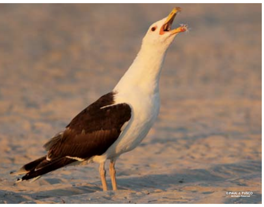
Above, a gull calls in an aggressive posture, while at right, a great black-backed gull exits the water carrying a freshly-killed black skimmer fledgling.

With a body length of 32 inches and a wingspan of up to five and one-half feet, the great black-backed is truly an impressive and powerful bird. The large bill is strong and stout. It has a slight hook that is used to catch and kill prey, and tear flesh. Adults have a red spot on their lower mandible that chicks will peck at to get the adults to feed them.