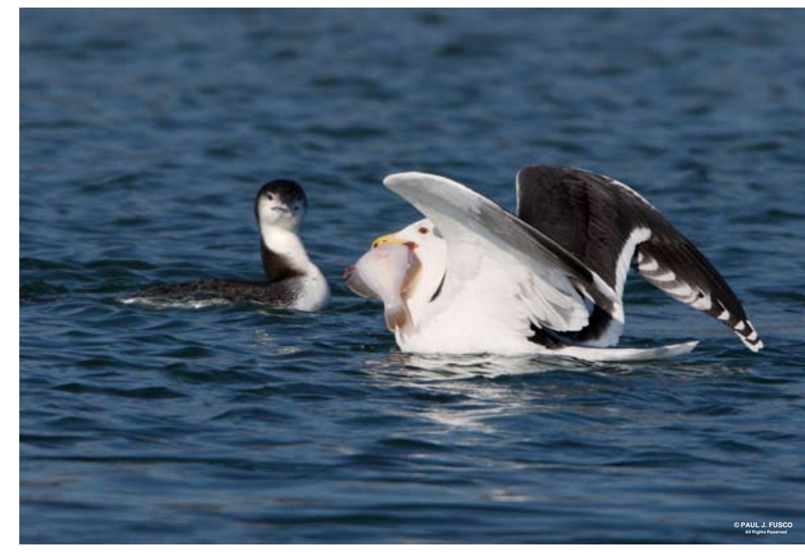
A great black-backed gull starts to make off with its catch of flounder as a common loon looks on.

Along with many other avian species, great black-backed gulls were once widely hunted for their eggs and feathers. That