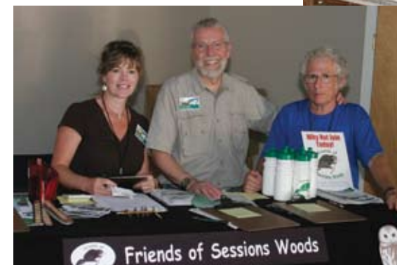
Friends of Sessions Woods members staff the welcome table.

Those who attended Hunting & Fishing Day were able to make turkey calls, learn about forestry and boating in CT, observe Cowboy Action Shooting, and practice flycasting.