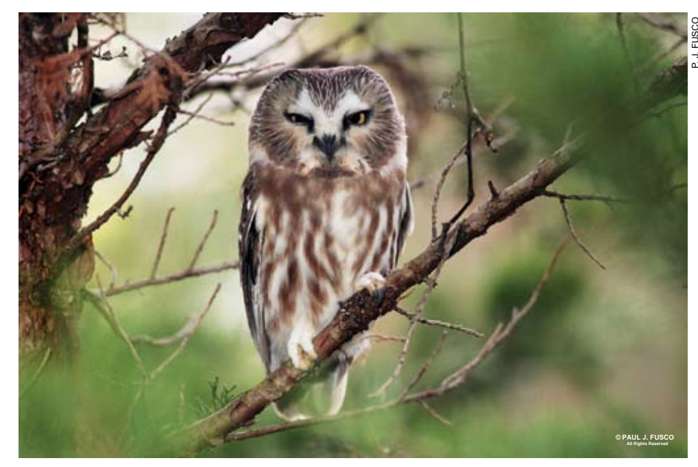
The northern saw-whet owl uses evergreen cover for roosting and protection in winter.

In fall 2009 and spring 2010, red cedar, white pine, white spruce, and Norway spruce were planted by Division staff and volunteer Master Wildlife Conservationists in areas cleared by the brontosaurus. Fencing was placed around the cedars to protect them from deer browsing as they are a preferred winter food for deer. Some