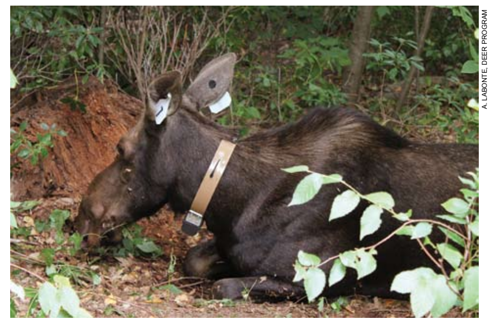
To better assess the future existence of moose in Connecticut, moose are being captured, radio-collared, and ear tagged as part of an ongoing project.

Historic accounts suggest that moose existed in Connecticut, but were extirpated sometime in the early eighteenth century. According to the Connecticut State Archaeologist, no archaeological deposits of moose exist, indicating that moose, if truly ever native, likely occurred in low numbers. Beginning in the early 1900s, moose were reportedly seen on a few