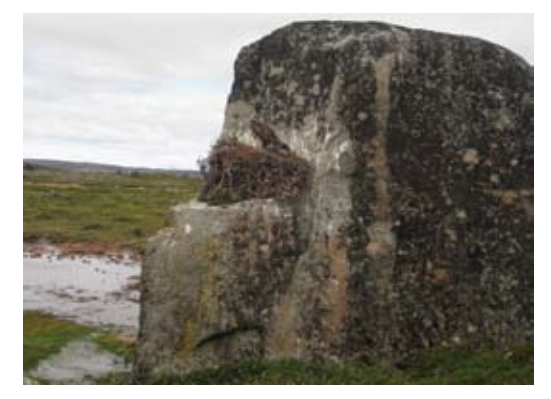
A nesting rough-legged hawk was one of the many wildlife species we observed while working in this area.

adults also were recaptured. The two groups conducted banding between August 6 and August 14, 2010. We made 84 catches with an average capture size of 30 geese. All of the captures occurred in an area that ranged approximately 115 miles north to south along the northern Hudson Bay coast and extended 25 miles inland. Collectively, the banding operations along