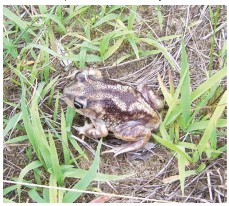
The eastern spadefoot toad has a characteristic lyre-shaped pattern on its back. This toad is listed as an endangered species in Connecticut.

While adapted to conditions other amphibians would find prohibitive, no amount of evolutionary conditioning has prepared the spadefoot for its current challenge—human-dominated land-scapes. Spadefoot populations have been extirpated due to development, including one well-known population near New Haven which was extirpated in the 1930s