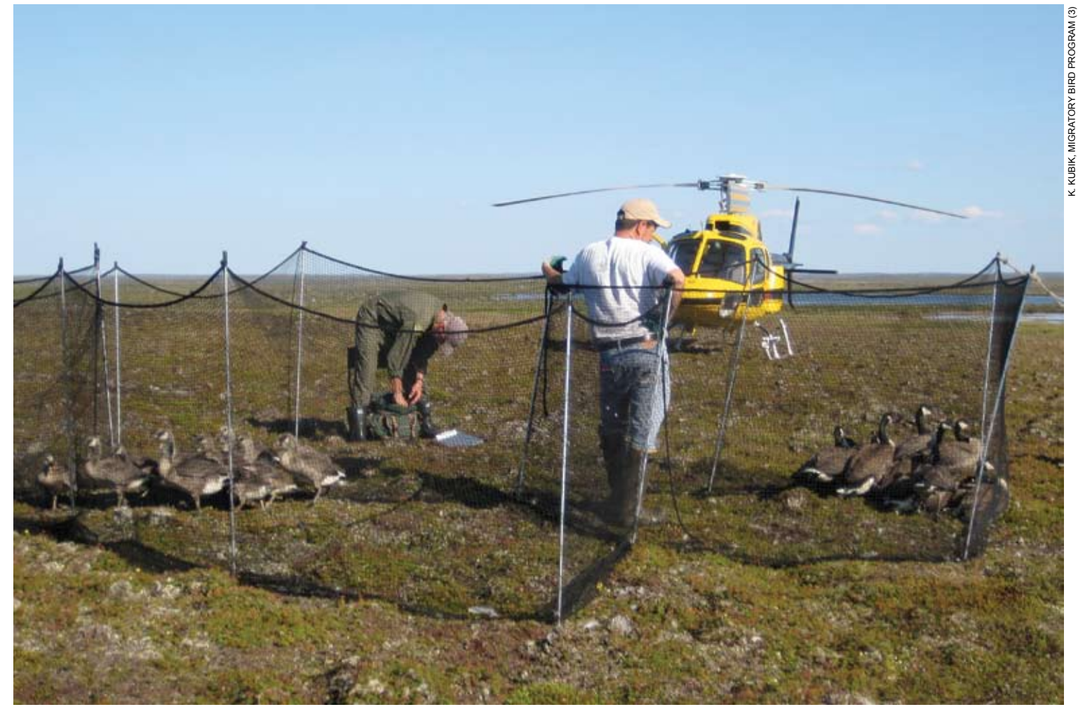
An A-Star B2 helicopter was used to local, corral, and drive molting geese into a portable net. The net was carried in a container attached to a skid on the helicopter.

surements were taken on approximately 10% of the geese that were caught. These measurements allowed us to differentiate between other subspecies of Canada