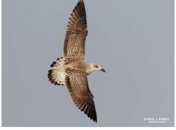
Both adults (left) and immatures (right) exhibit long, broad wings and short, rounded tails. Adults have a black mantle (topside of wings and back), while young birds have contrasting markings with a pale head.