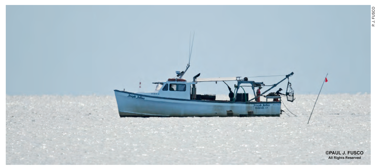
The goal of the Blue Plan legislation is to develop an inventory of Long Island Sound's natural resources and their human uses, and provide a map to guide future use of the Sound's waters and submerged lands.

Survey, and the Coastal Management Program – along with academic and private environmental groups, principally the Connecticut Chapter of The Nature Conservancy and Save the