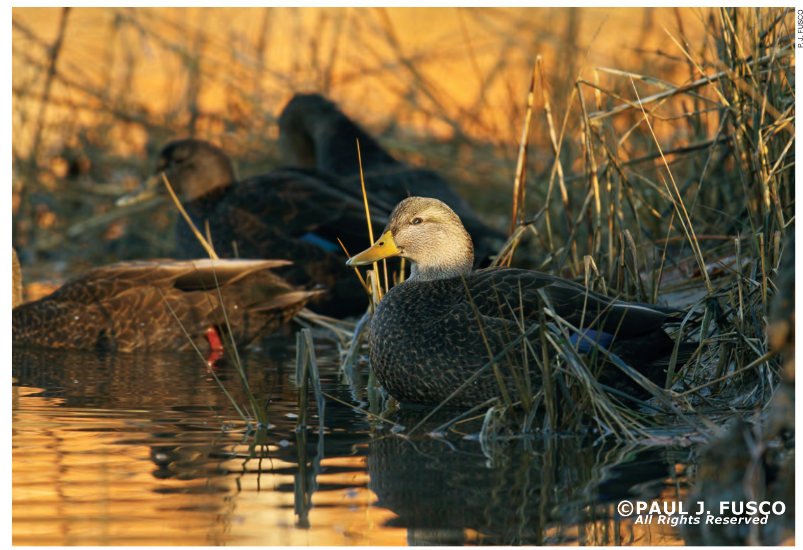
These black ducks are resting in a salt marsh. The black duck was formerly one of several waterfowl species that were monitored during the longrunning Midwinter Waterfowl Survey. However, due to budget cuts, the U.S. Fish and Wildlife Service suspended their participation in the survey. See article on page 16 to learn more.

Connecticut Department of Energy and Environmental Protection Bureau of Natural Resources / Wildlife Division Sessions Woods Wildlife Management Area P.O. Box 1550 Burlington, CT 06013-1550