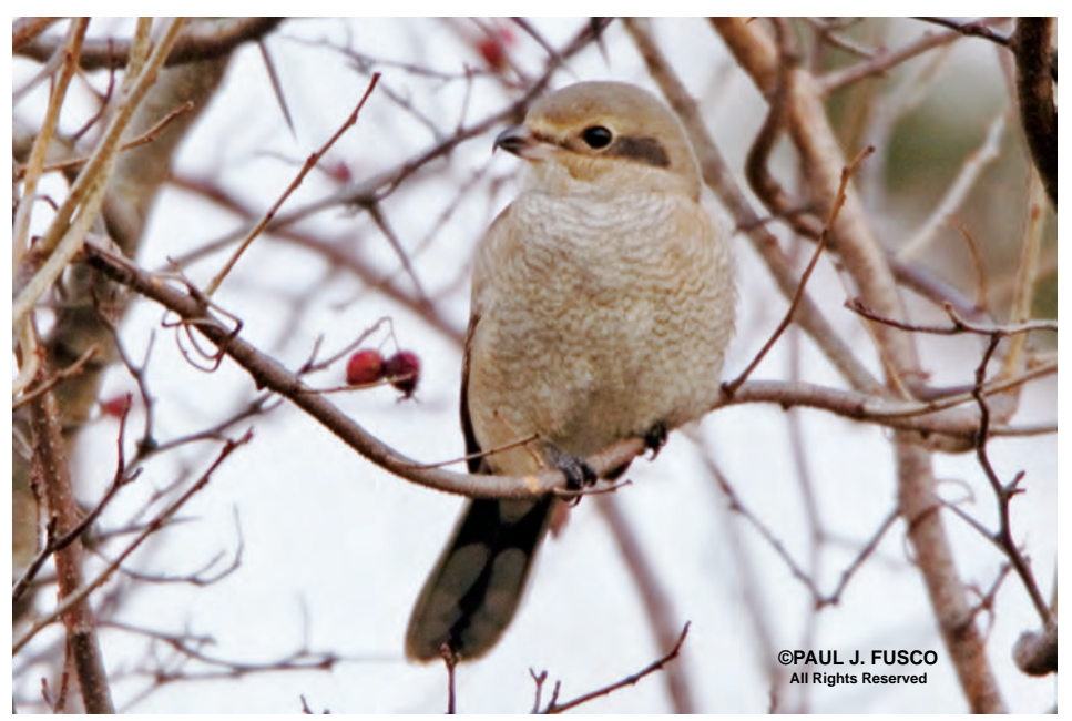
Immature northern shrikes have brownish plumage with distinct barring on the underside.

Northern shrikes are currently not considered a species of conservation con-