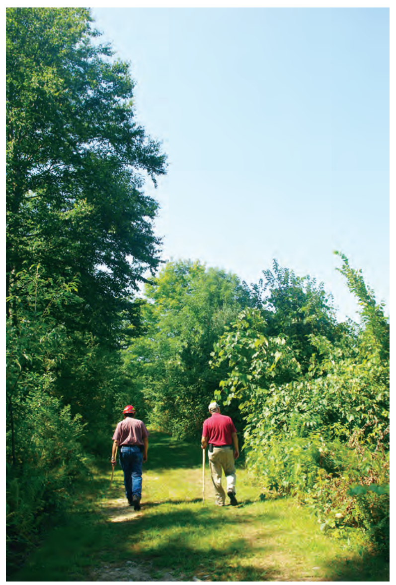
The tradition of a State Forester visiting a landowner's property at their request is still being practiced, now providing landowners with a wealth of information, such as a description of the landowner's forest cover, stewardship options, and recommended actions.

By the mid-1800s, the forests that the first settlers had seen were essentially gone. However, farms were eventually abandoned as settlers moved West in search of better farmland and other opportunities, allowing the forests to grow back. With the arrival of the Industrial Revolution, the demand