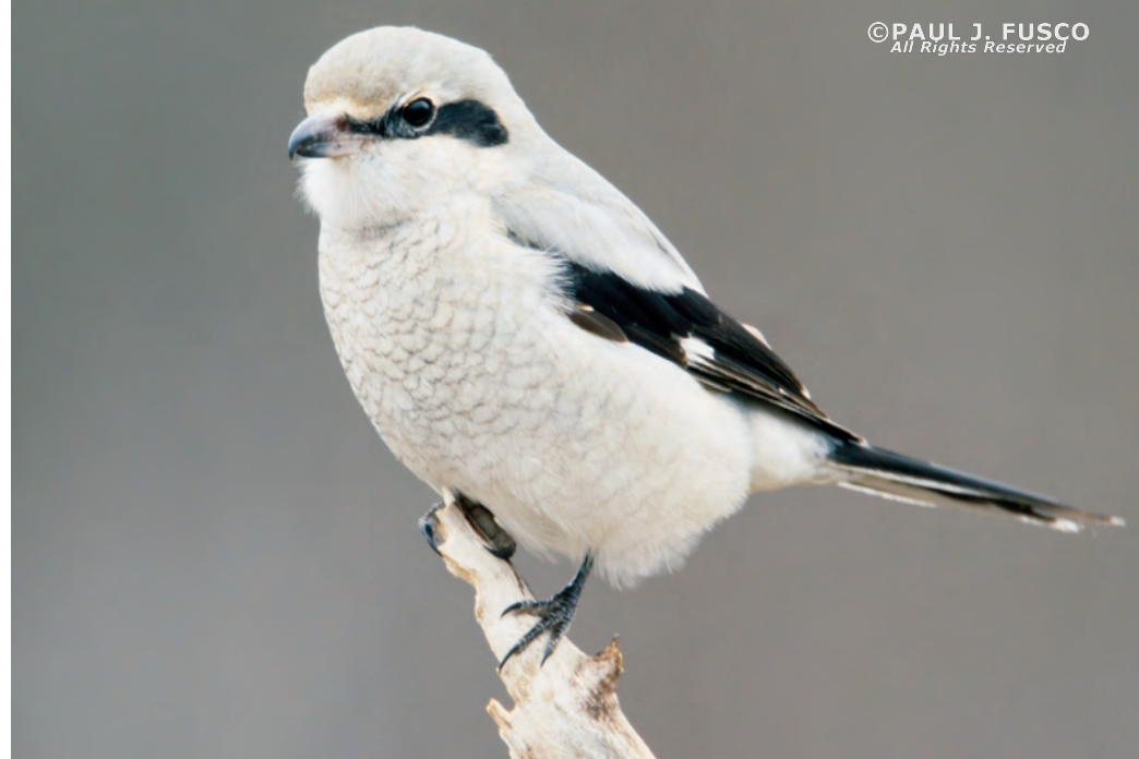
Shrikes can be easy to spot when perched in the open, but they may stay hidden in thick cover for long periods of time, making them difficult to find.

Adult northern shrikes have faint barring on the breast and belly, while immature birds are brownish overall, and have