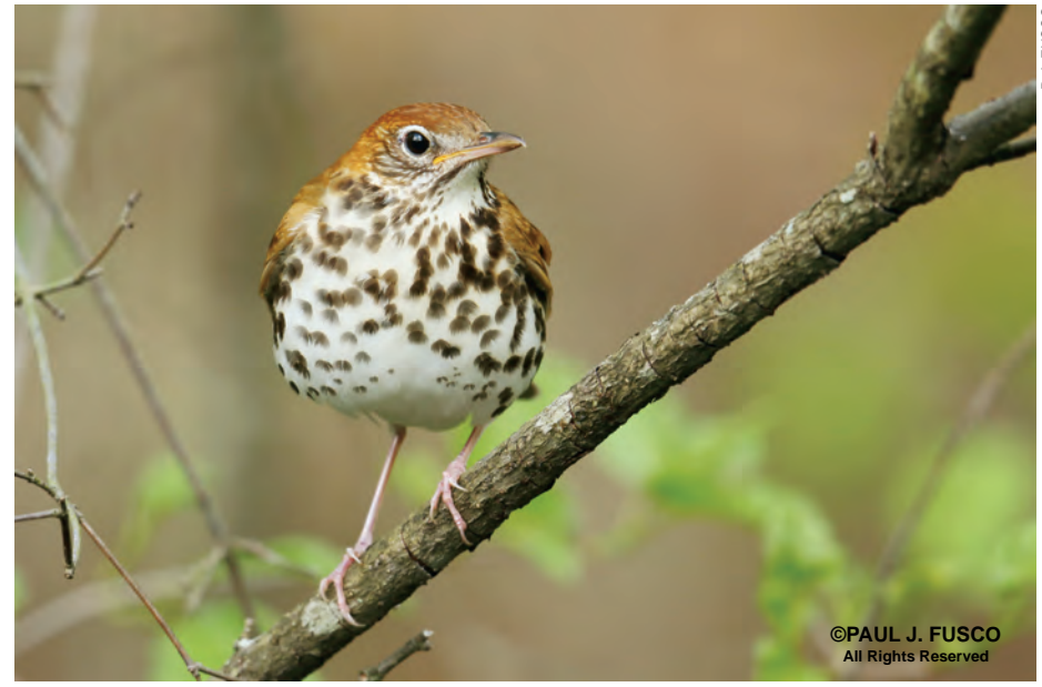
The wood thrush, a forest interior bird, is declining throughout most of its breeding range.

Science has been used to better guide forest management practices for forest