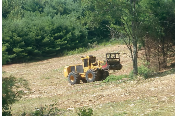
Skidder with front-mounted mower removing white pine and autumn olive.