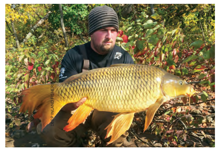
Common carp are Connecticut's largest minnow. They are also the largest freshwater fish averaging over 20 pounds. A fan-tail is a genetic mutation where the fins have a "feather-like appearance."

Broodstock Atlantic Salmon: This unique fishery started in 1992 when a limited number of fish that were past reproductive prime for the restoration program were stocked into the Shetucket and Naugatuck Rivers. Beginning in 2007, broodstock have occasionally been stocked into Mount Tom Pond, Beach Pond, Crystal Lake, and Mashapaug Lake. The broodstock Atlantic salmon fishery is very popular and Fisheries Division stocking is anticipated by many anglers. In order to support this fishery, the Division is specifically producing about 1,000 to 1,200 two- to three-year-old fish and 200 to 250 four- to six-year-old fish to stock annually.