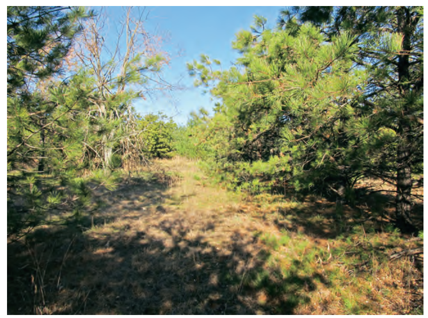
Tree canopy is closing in by 2012.

outcompeting the pitch pines, and started to form a forest. With the canopy closing in, the site was losing its value as an early successional habitat.