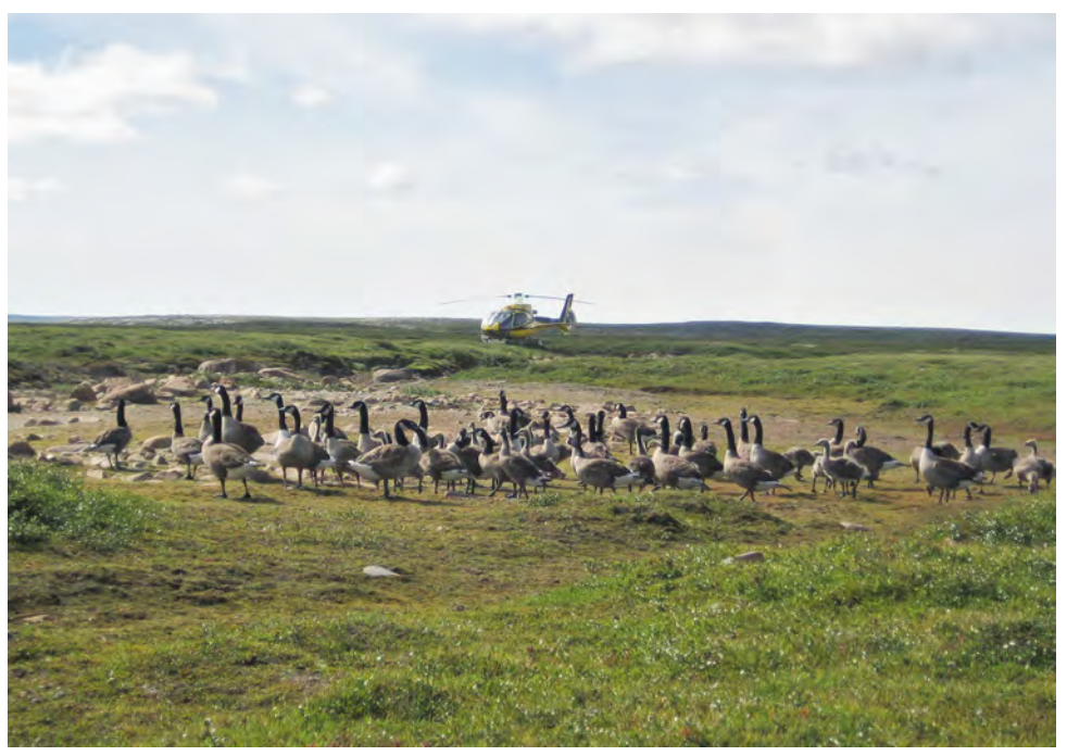
An Eurocopter EC130 B4 helicopter was used to locate, corral, and drive molting geese into a portable net. The net was carried in a container attached to a skid on the helicopter.

ously banded adults were recaptured. All of the captures were made in an area that ranged approximately 115 miles north to south along the northern Hudson Bay coast and extended 25 miles inland. Collectively, the operations along Hudson Bay and Ungava Bay banded a total of 3,996 AP geese this year.