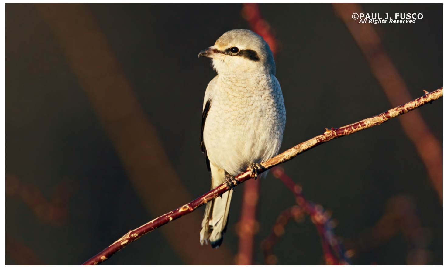
In Connecticut, northern shrikes are found in early successional habitats, such as fields, shrublands, wetlands, and forest edges. The habitat typically has a component of thorns or barbed wire fences which the birds use to impale and hang their prey.

they will eat, bringing the excess to a "pantry," which can be a barbed wire fence or thorns, where the prey is impaled. Prey may also be hung in the fork of small branches. A shrike may have multiple victims hanging in its larder, returning to feed on them when food becomes scarce. Because of its aggressive nature and the habit of maintaining a grisly food cache, the northern shrike is also known as the "butcher bird."