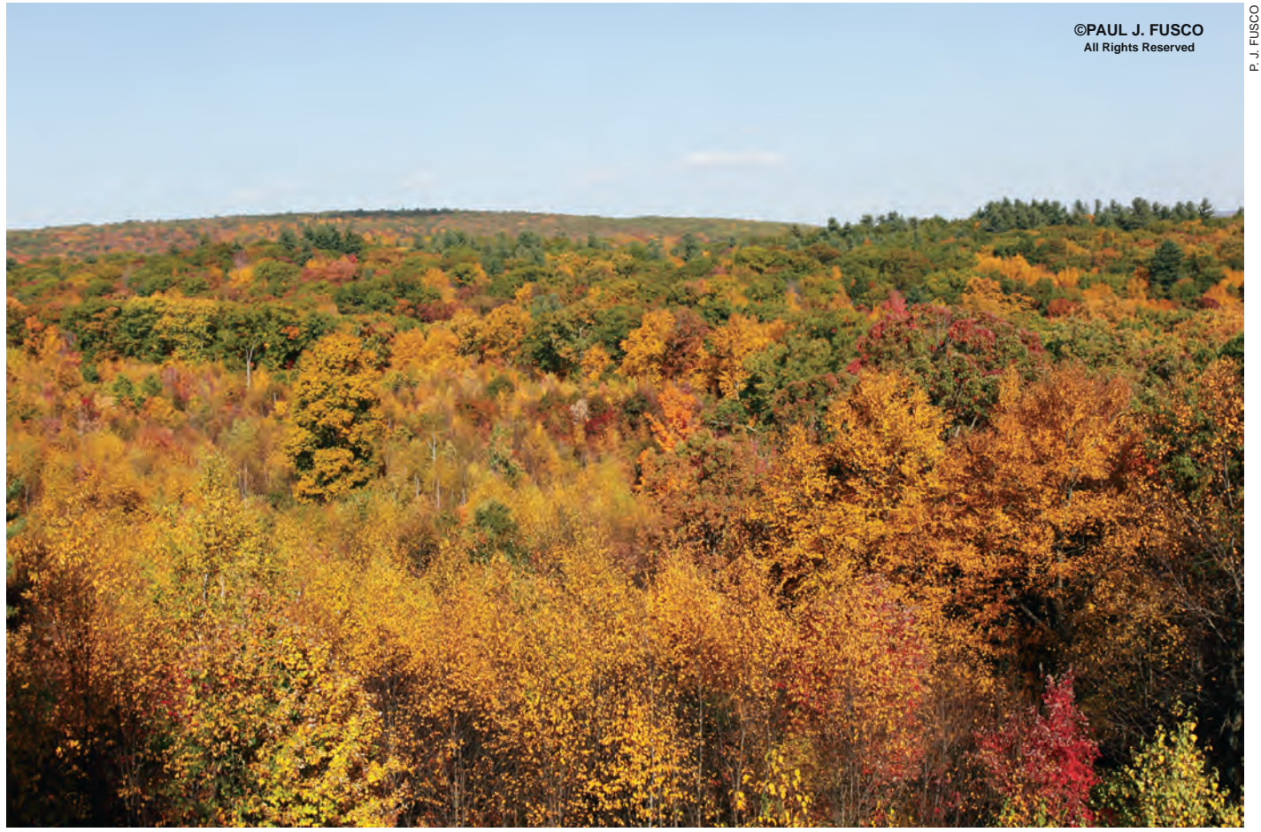
Today, about 59% percent of Connecticut is covered with forest. This can largely be attributed to State Foresters who instructed landowners on how to sustainably manage their woodlands.

this tradition by going out at landowners' request to walk through their property and offer advice on how to manage woodlands.