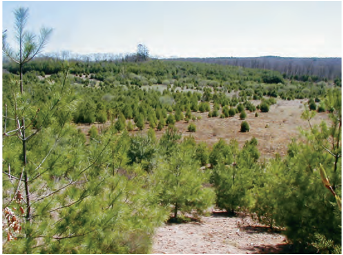
Tankerhoosen WMA in 2004, prior to State acquisition.

After the mining operation was completed on the Tankerhoosen WMA site in the 1980s, the vegetation grew back. Where sandy patches remained, tiger beetles, burrowing bees, and cicada killers made their burrows in the loose soil. Native pitch pines and white pines became established, providing food and cover for wildlife. At first, the white pines were short and thick, some growing in large patches that provided excellent cover for shrubland-dependent brown thrashers and willow flycatchers. However, the white pines spread rapidly,