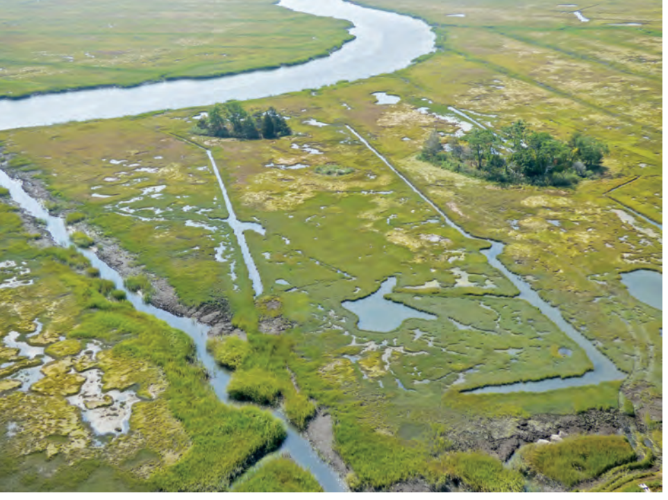
Restoration at East River Wildlife Management Area consisted of plugging ditches, creating new creeks, and creating small, shallow ponds.

either excellent quality (large, contiguous blocks of habitat specifically managed for early successional species) or lower quality (disjunct and patchy habitat, mostly in suburban areas) It was hypothesized that survival rates and, potentially, habitat use would differ between woodcock inhabiting large, high quality blocks of habitat and those found in more patchy, fragmented, lower quality habitats. Researchers discovered that survival differed between high and low quality areas in two of three years. Survival rates in high quality sites averaged about 58% and close to 34% in low quality areas. This study informed future land management for woodcock.