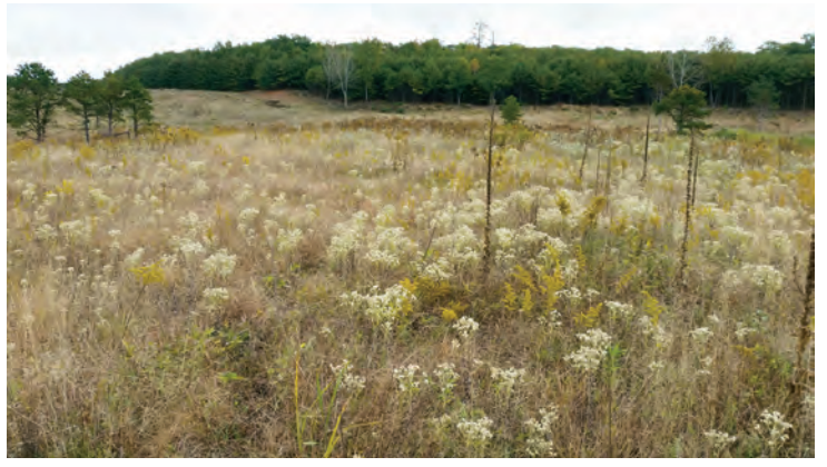
Native plants, such as pearly everlasting, showy goldenrod, and purple lovegrass, now thrive at Tankerhoosen WMA.