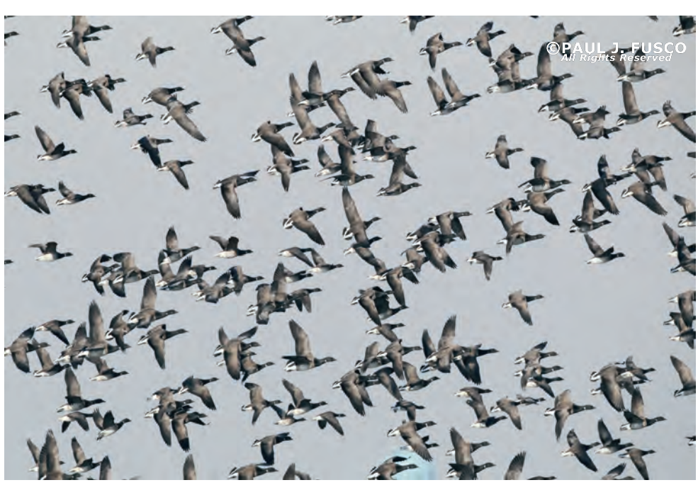
Brant are distributed throughout coastal Connecticut during winter and early spring, particularly around New Haven Harbor and New London.

In 2015, the USFWS, due to budget cuts, suspended their participation in this survey. The survey has traditionally been used for setting hunting regulations for only two species, Atlantic brant and eastern tundra swan. To address that need, the Atlantic Flyway states continue to fly the survey, but only concentrate on those two species. In Connecticut, the Wildlife Division has not