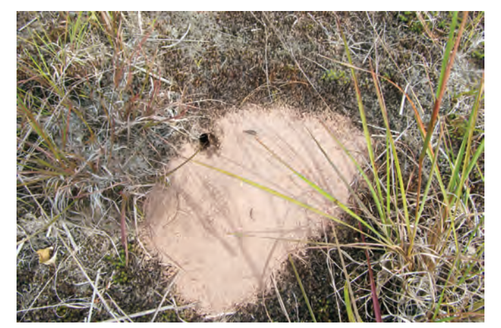
Punctured tiger beetles (so named because of the markings that look like little puncture marks) and cicada killers burrow in a sandy patch at Tankerhoosen WMA.

Even though Tankerhoosen WMA has a unique early successional habitat with dry sandy soil, early successional habitat can also occur on moist sites. To learn more about early successional habitats and the species that depend on them, view the Habitat History slide show at www.ct.gov/ deep/belding.