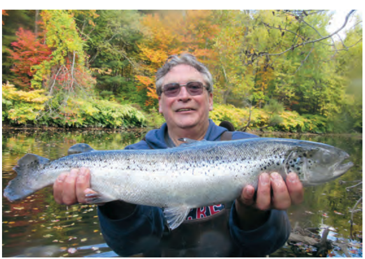
The Broodstock Atlantic Salmon Program offers a unique opportunity to catch a fish that has not been commonly caught in Connecticut since the early 1800s.

Broodstock Atlantic Salmon: This unique fishery started in 1992 when a limited number of fish that were past reproductive prime for the restoration program were stocked into the Shetucket and Naugatuck Rivers. Beginning in 2007, broodstock have occasionally been stocked into Mount Tom Pond, Beach Pond, Crystal Lake, and Mashapaug Lake. The broodstock Atlantic salmon fishery is very popular and Fisheries Division stocking is anticipated by many anglers. In order to support this fishery, the Division is specifically producing about 1,000 to 1,200 two- to three-year-old fish and 200 to 250 four- to six-year-old fish to stock annually.