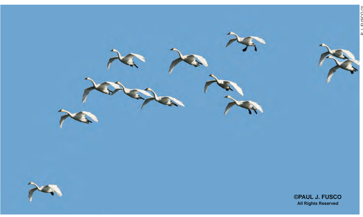
Tundra swans are rare winter residents in Connecticut. More frequently, they stop over in spring on their way north and west to their breeding grounds.

he Midwinter ▲ Waterfowl Survey was one of the longest continuous surveys conducted in North America. All states in the Atlantic Flyway annually participated in this cooperative effort in conjunction with the Atlantic Flyway Council and the U.S. Fish and Wildlife Service (USFWS). The results of this survey were used as an index to wintering populations and provided relative information on waterfowl distribution and habitat use. These data were used by the habitat Joint Ventures as measures of habitat condition and the relative success of habitat delivery programs.