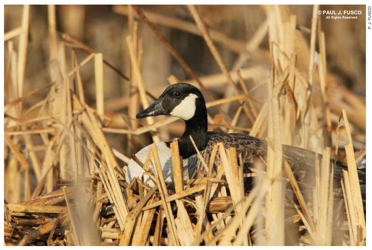
Survey indices for Canada geese show a significant population decrease from last year's survey and the fiveyear average.

A drake index (drakes/pairs+drakes) is calculated annually for each species to determine if survey timing was appropriate. A high drake index indicates good survey timing. It shows that the nesting of local ducks has begun and most migrants have moved north to their breeding grounds. Conversely, a low index shows the survey was conducted too early and paired migrants may still be present. An index between 0.50 and 0.75 is indicative of a well-timed survey. This year, the