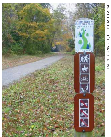
A post along the Hop River State Park Trail displays the appropriate uses of the area.