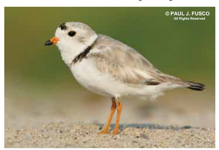
The state and federally threatened piping plover is protected by laws to prevent the population from becoming extirpated. Piping plovers are continually threatened by human-related activities and over-development of coastal habitat.

The eggs of the earliest nests hatch in mid-May, and the chicks are running around the beach within hours of hatching. Plover parents do not feed their chicks. Instead, the newly-hatched fuzzballs can be seen running down to the waterline on their stilt-like legs, feeding on inverte-