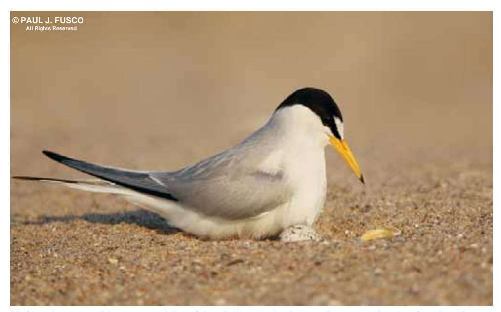
Piping plovers and least terns (above) lay their eggs in the sand at some Connecticut beaches. Nesting areas are fenced off to protect the vulnerable nests and young chicks, affording the birds a chance to raise their young successfully.

brates in the sand. If a spring storm surge or other event destroys their first nesting attempt, a pair may try again, as late as early July. Plovers have to contend with increasing foot-traffic and disturbance as people head to the beach during the summer months.