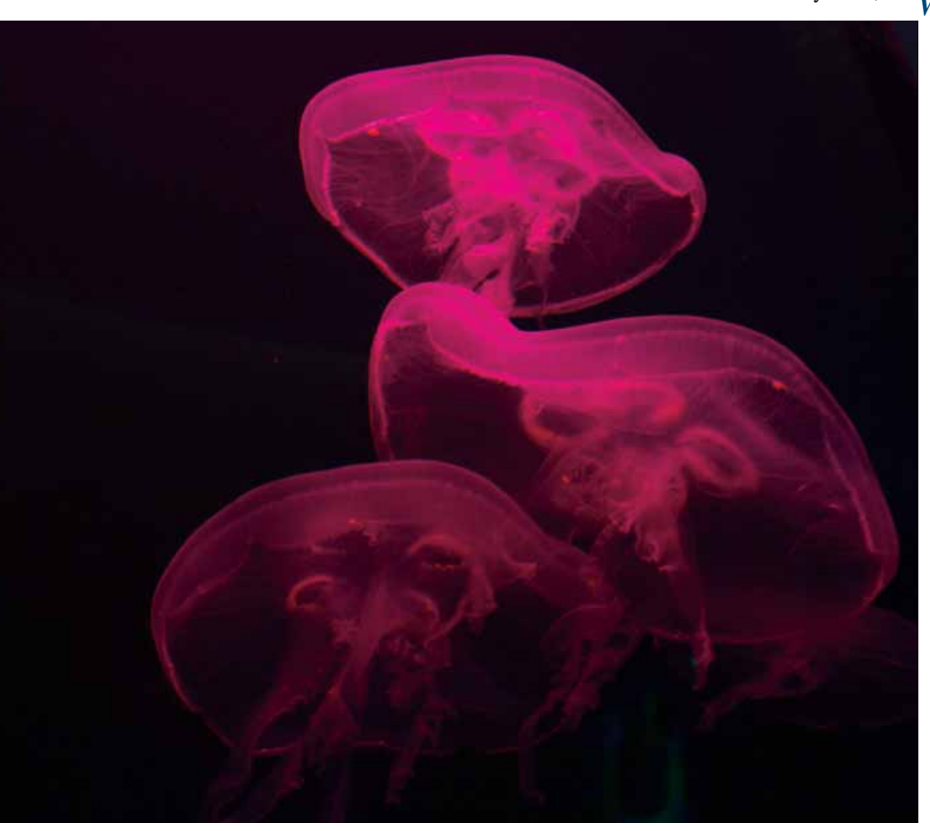
Moon jellies as viewed through a live exhibit at the Mystic Aquarium in Mystic. Moon jellies are actually translucent and white.

A sting from a Portuguese man-of-war ( Physalia physalis ) – a southern species very rare in Long Island Sound – can be much more serious than that of the jellies typically found in our waters. Its translucent blue body floats visibly on the surface, but extremely long and numerous tentacles hide beneath the waves. Best beware of this southern menace in hopes that our sea turtles and sunfish will enjoy a good meal.