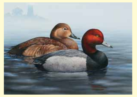
Redheads painted by Wes Dewey.