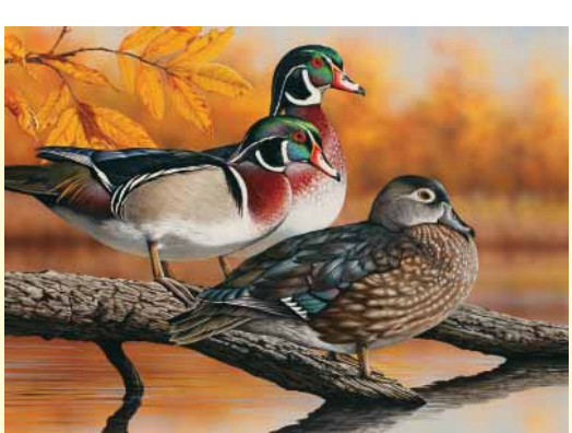
Wood ducks painted by Richard Clifton.

Hunters are not the only ones who purchase Connecticut Duck Stamps. Anyone who wishes to support wetland conservation and restoration in our state is encouraged to do so. 2012 stamps can be purchased for $13 each wherever hunting and fishing licenses are sold: participating town clerks, participating retail agents, DEEP License and Revenue (79 Elm Street in Hartford), and through the online Sportsmen's Licensing System (<a href="www.ct.gov/deep/sportsmenlicensing">www.ct.gov/deep/sportsmenlicensing</a>). Upon request, stamps can be sent through the mail. The 2013 Duck Stamp will go on sale in the fall of 2012. To learn more about the Connecticut Duck Stamp and the inaugural Art Contest, go to <a href="www.ct.gov/deep/ctduckstamp">www.ct.gov/deep/ctduckstamp</a>.