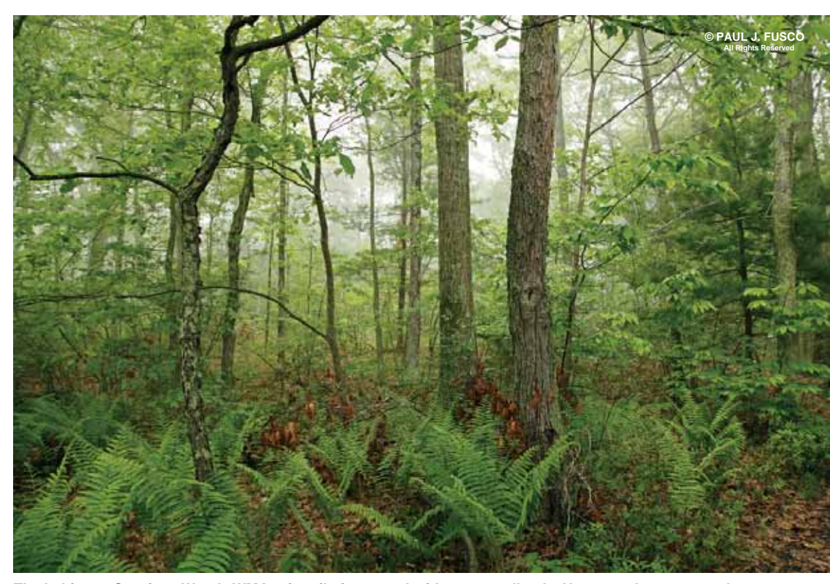
The habitat at Sessions Woods WMA primarily features deciduous woodlands. However, there are patches of coniferous trees, including white pine, hemlock, and scattered pitch pine. The property also contains wetlands, riparian areas, and some early successional stage habitat.

The future of Connecticut's wildlife depends not only on the management efforts of the Wildlife Division, but also on the support, involvement, and knowledge of all Connecticut citizens.