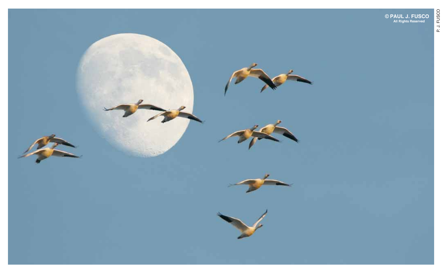
The DEEP Wildlife Division has been involved with several projects within the Arctic Goose Joint Venture, most recently a four-year satellite telemetry project on greater snow geese (pictured).

Over the course of their history, Joint Venture partnerships have leveraged every dollar of Congressional appropriations 35:1, helping to conserve 18.5 million acres of critical habitat.