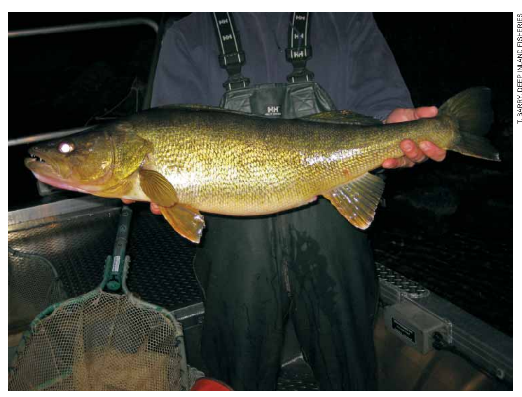
Walleye can grow to lengths of 30 inches and weigh as much as 15 pounds in Connecticut waters. This specimen was sampled by the Inland Fisheries Division in Saugatuck Reservoir earlier this spring.

Some of the better walleye fishing spots can be found in lakes that have small herring known as landlocked alewives. These fish are abundant in Squantz Pond, Beach Pond (Voluntown and Exeter, Rhode Island), Saugatuck Reservoir (Easton, Redding, and Weston) and Lake Saltonstall (Branford and East Haven). The latter two reservoirs are owned by water compa-