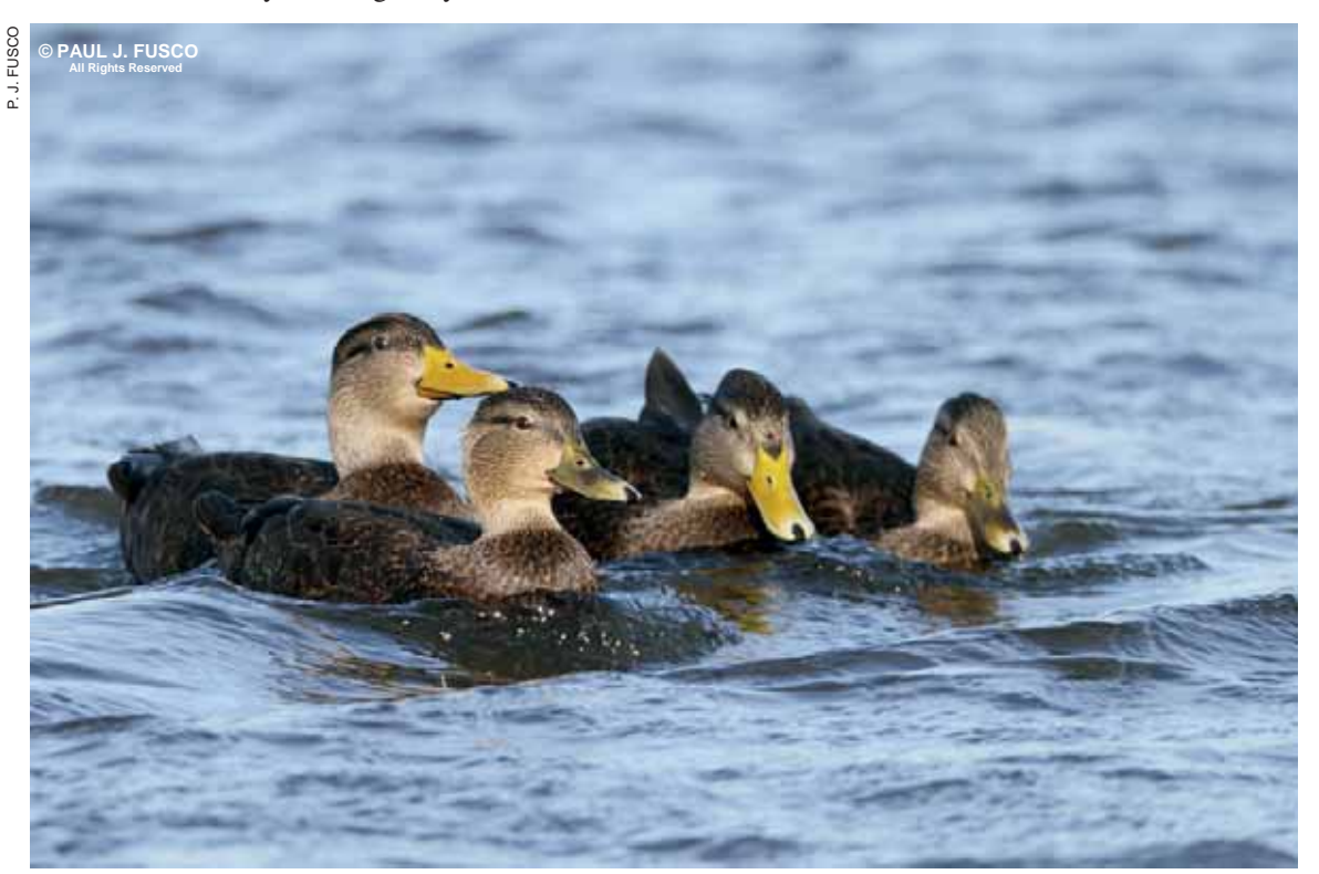
The DEEP Wildlife Division is a partner in the Black Duck Joint Venture, which aims to restore black duck populations and habitats to their North American Waterfowl Management Plan goal.

Atlantic Coast Joint Venture partners recognize the benefits of working together to achieve common goals for bird conservation in the Atlantic Coast region. The ACJV jointly develops sound science to assess the status and needs of bird species; identifies priority geographic areas and habitat conservation actions: and evaluates the impact of conserva-