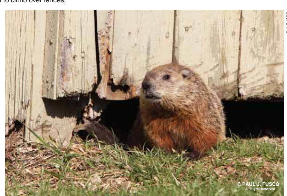
Woodchucks can be excluded from burrowing under sheds and porches by placing galvanized wire mesh along the openings and burying it at least 1.5 to 2 feet underground.

Woodchucks may be controlled in agricultural settings through hunting. All hunting of woodchucks must be done in accordance with state hunting laws and by knowledgeable persons following all state firearms discharge laws. Woodchucks can be hunted most of the year with no daily or seasonal limits. Check the current Connecticut Hunting and Trapping Guide for season dates and requirements at <a href="https://www.ct.gov/deep/hunting">www.ct.gov/deep/hunting</a>.