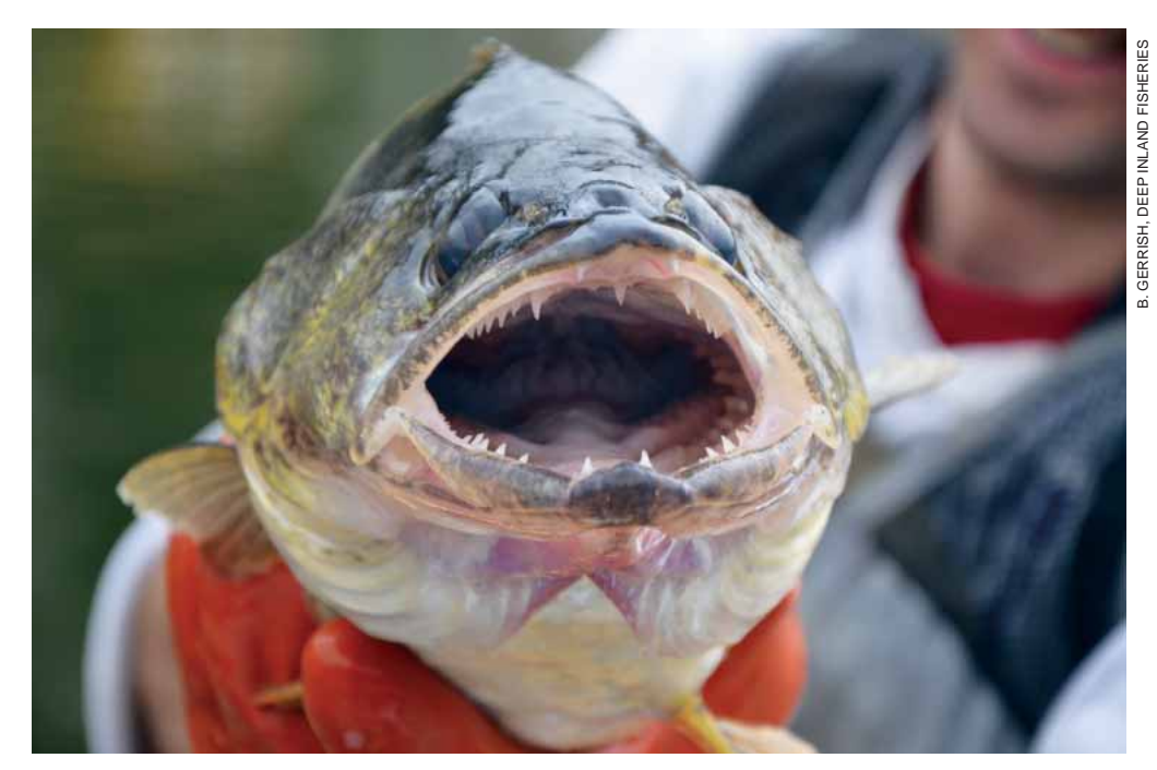
One look into the mouth of a walleye and you can clearly see that they are well adapted as efficient predators.

If you are up for learning some new fishing techniques, other than those used for trout or bass, then give walleye fishing a try. The satisfaction of catching something different and the additional reward of a potentially great "fish fry" should provide plenty of incentive to try something new!