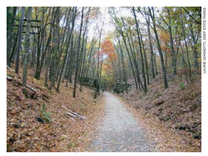
A scenic stretch through a rock cut along the Hop River State Park Trail.

The 20-plus miles of the Hop River Trail, like many trails of this length, pass through or abut many preserved open areas, providing a relatively easy way to view wildlife. This is especially true for the western sections of the trail where development has put more pressure on the land and preservation efforts have maintained precious open space. Thus, in Vernon, the trail abuts the Belding Wildlife Management Area for 1.5 miles, and then passes through Valley Falls Park and