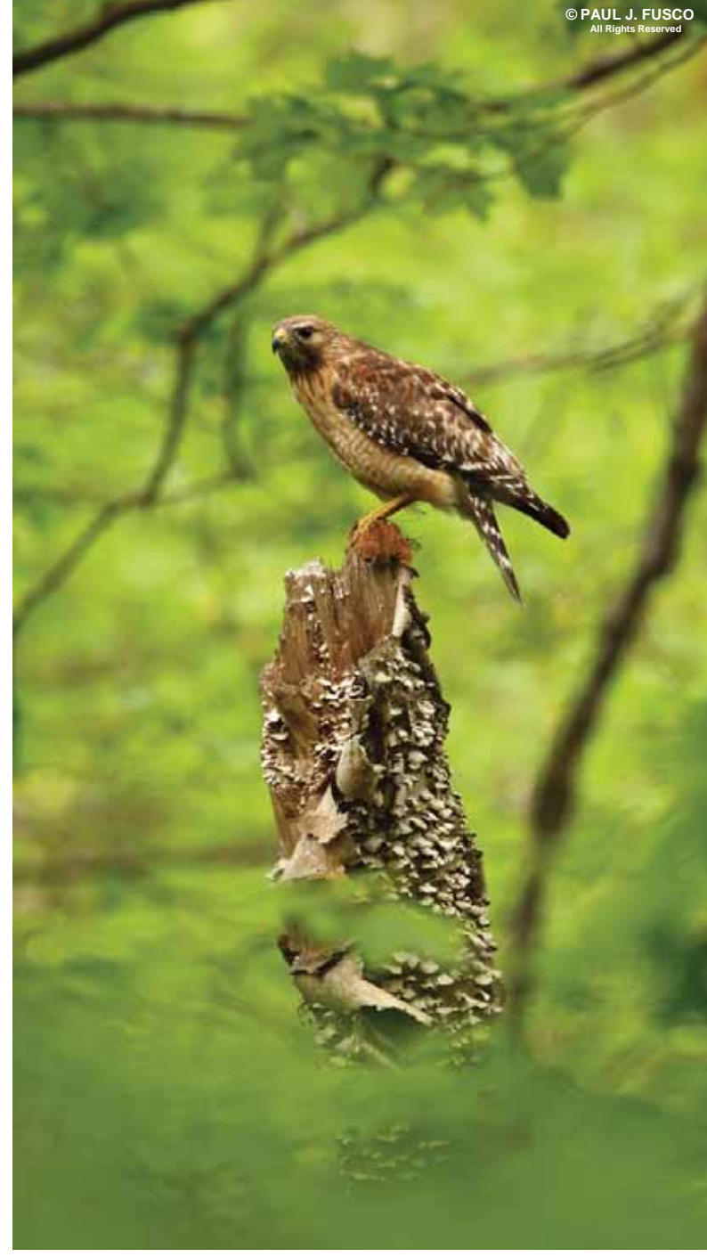
Red-shouldered hawks primarily prey on frogs, snakes, and small mammals. This one has a young woodchuck.

The red-shouldered hawk is widespread in Connecticut, but its distribution is patchy. It was formerly listed as a state species of special concern, but was removed from Connecticut's Threatened and Endangered Species List with the 2004 revision because the population is stable or increasing.