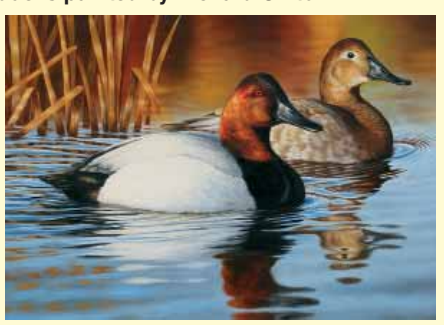
Canvasbacks painted by Guy Cittenden.