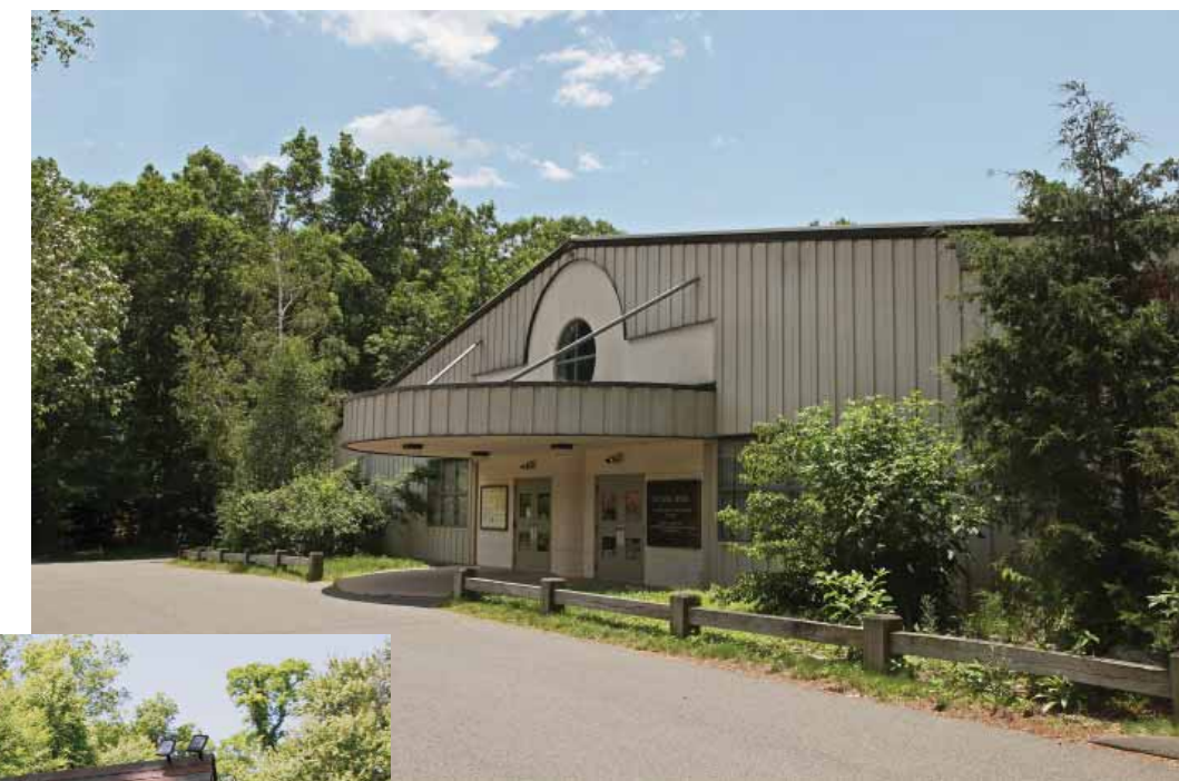
The Sessions Woods Conservation Education Center (above) is located on Route 69 (341 Milford Street) in Burlington. Look for the sign at the driveway entrance.

Sessions Woods is a unique WMA because of the emphasis on education. Its Conservation Education Center and extensive outdoor demonstrations of wildlife and habitat management aim to provide the public