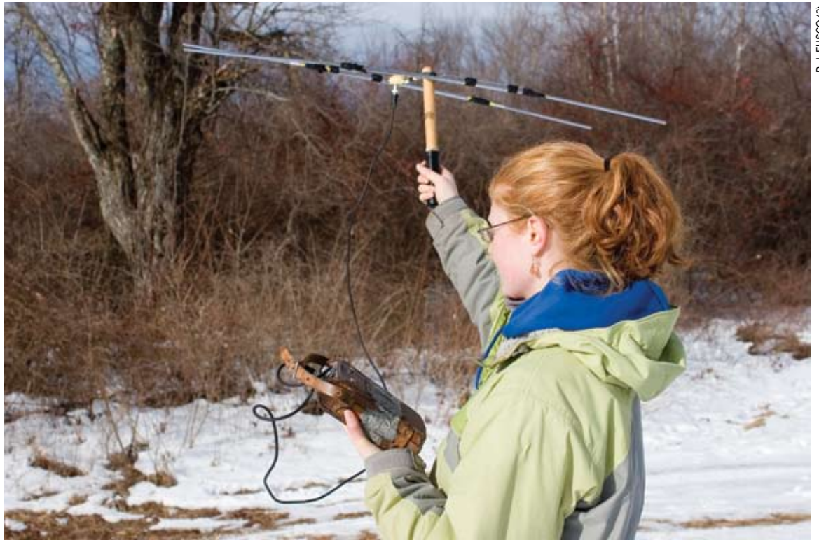
New England and eastern cottontails were equipped with radio collars and followed with the use of radio telemetry antennas. This State Wildlife Grant funded study provided data on movements, survival, and habitat use of the two rabbit species.

In 2001, the U.S. Congress, acting in response to the states' need for comprehensive conservation for all of America's wildlife, approved the Wildlife Conservation and Restoration Act Program that subsequently led to the establishment of the State Wildlife Grants (SWG) Program. The SWG Program provides federal grants to all states to benefit wildlife and their habitats, with the goal of preventing species from becoming endangered. Funds are appropriated annually and must be used for projects that improve the conservation of species identified as those of Greatest Conservation Need (GCN) within