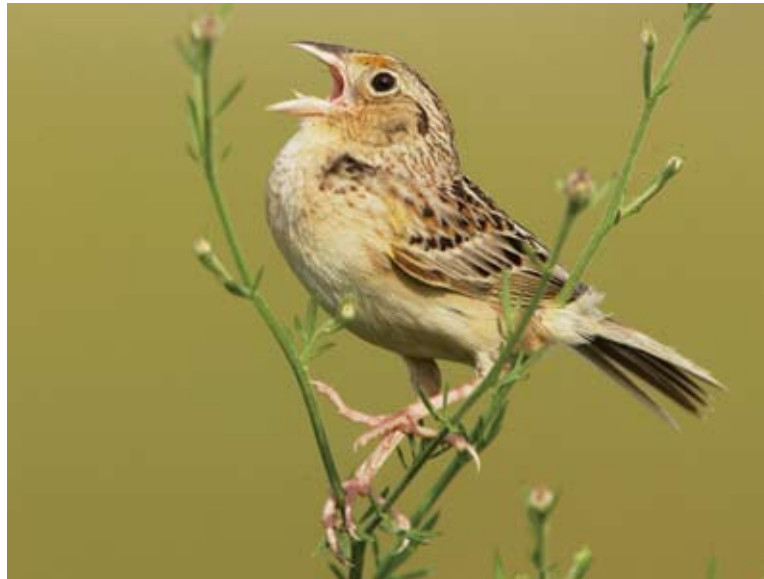
Connecticut's Grassland Habitat Initiative has led to the identification of several new breeding and nesting locations for some of Connecticut's most threatened and endangered bird species, including the grasshopper sparrow.

Grasslands are one of the top priority habitats recognized by Connecticut's CWCS. They provide habitat for approximately 80 bird species in the state (13 of which are on Connecticut's Threatened and Endan-