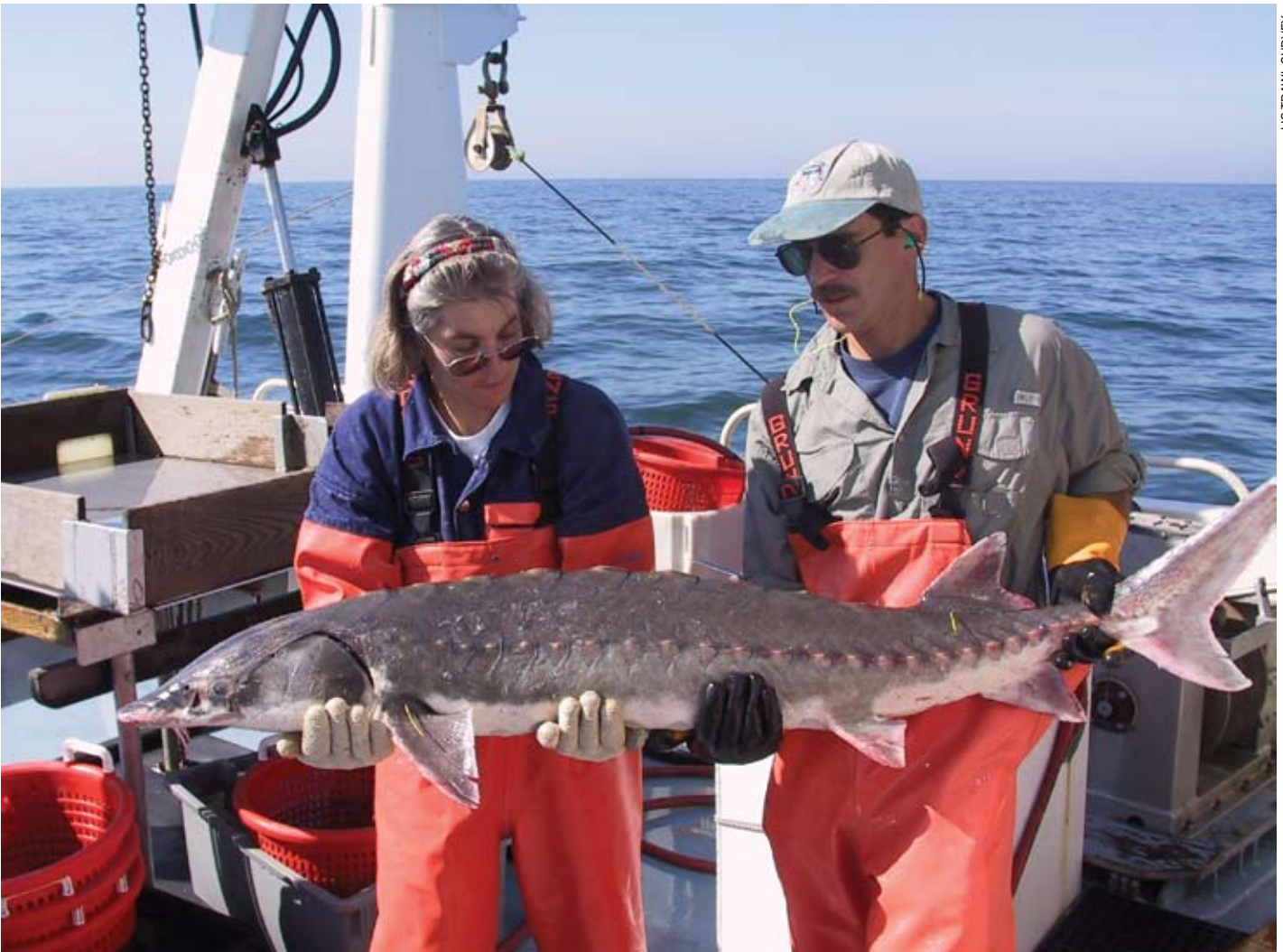
Atlantic sturgeon are seasonally present in Long Island Sound and the lower sections of Connecticut rivers. In this photo, two externally applied t-bar tags can be seen on this sturgeon (small, yellow “threads”); one is above the left pectoral fin and one is below the dorsal fin. DEP staff examined, measured, weighed, and tagged this sturgeon before releasing it.