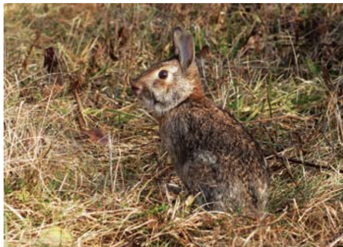
The New England cottontail is the only native rabbit species found in Connecticut. The distribution and abundance of this rabbit have declined in Connecticut and elsewhere.

Starting in 2002, State Wildlife Grant funds have been used to help determine the status of NECs in Connecticut. NEC distribution was assessed by collecting rabbit specimens from live-trapping efforts, hunter harvest, and roadkills. Data on movements, survival, and habitat use of NECs and eastern cottontails (a similar