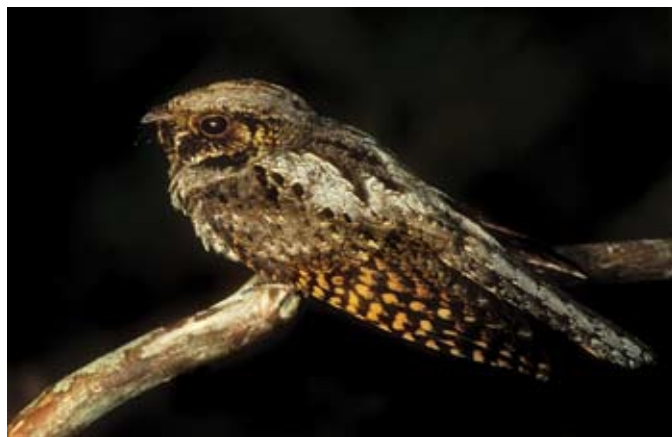
The whip-poor-will is experiencing a long-term population decline. The SWG Program helped the DEP Wildlife Division work with other Northeastern states to develop better survey protocols for this unique bird. Survey data should provide information on preferred habitats, as well as enhance understanding and conservation of whip-poor-wills.

used by these populations will be mapped and incorporated into existing watershed management plans for consideration in future land use planning decisions.