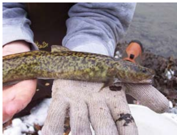
A cooperative project was initiated in 2005 by the DEP and the University of Connecticut to collect information necessary for the conservation and restoration of the state endangered burbot.

the autumn spawning season. This research has documented the importance of diverse habitats and the need for connectivity within a watershed. This study will provide critical information for the conservation of brook trout, not only in study areas but also in other areas where climate change is predicted to reduce the extent of coldwater within watersheds.