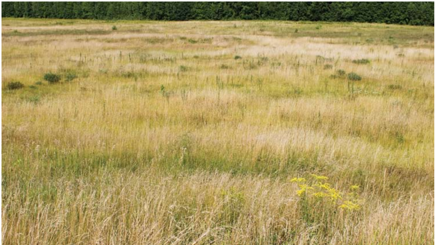
Grasslands are one of the top priority habitats recognized by Connecticut's Comprehensive Wildlife Conservation Strategy. They provide habitat for approximately 80 bird species in the state (13 of which are on Connecticut's Threatened and Endangered Species List), as well as for several mammals, reptiles, amphibians, and rare invertebrate species.