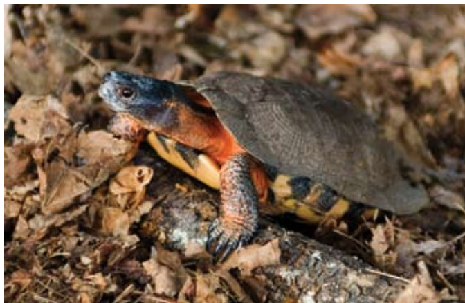
Habitat loss and fragmentation of suitable habitat due to development, coupled with the degradation of remaining habitats, are considered the main reasons for the decline of wood turtles. SWG funds have allowed the DEP Wildlife Division to conduct a two-year study on wood turtle populations in Fairfield County to collect baseline data in highly impacted areas.