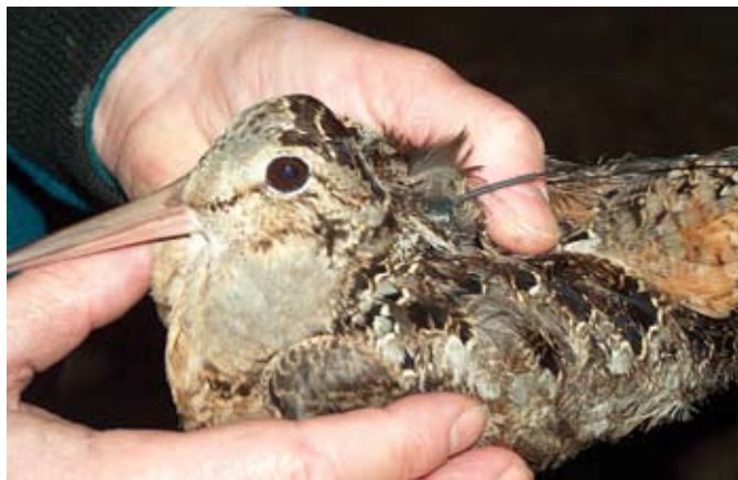
In the springs of 2005-2007, 98 breeding male woodcock were captured at five study areas and equipped with radio transmitters. Data were collected on the movements and survival of the birds.

As a result of the inventory and assessment project, four bees have been proposed for state listing (1 endangered and 3 special concern species). Unfortunately, the three special concern species are thought to be extirpated from the state, and it may be too late to take action on their behalf. When the listing update is finalized in 2009, Connecticut will become the first eastern state in North America to provide legal protection for its bee pollinators through the state's Endangered and Threatened Species Act. Conserving native pollinators that are experiencing seri-