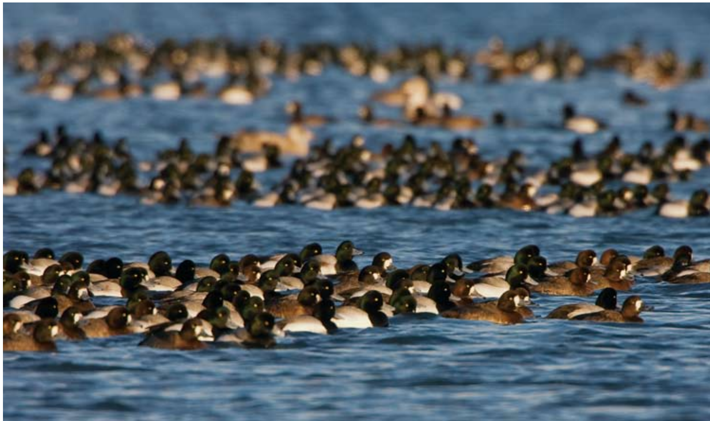
A combination of ground, aerial, and boat surveys was used to document the distribution and abundance of waterbirds in Long Island Sound during the winters of 2004-2006. Sixty-eight species were observed, including the greater scaup (pictured above), and even rarities like the Eurasian wigeon, king eider, red-necked grebe, northern gannet, and razorbill.

waterbirds. This information will help the DEP make wise conservation management decisions regarding any potential environmental impacts to Long Island Sound.