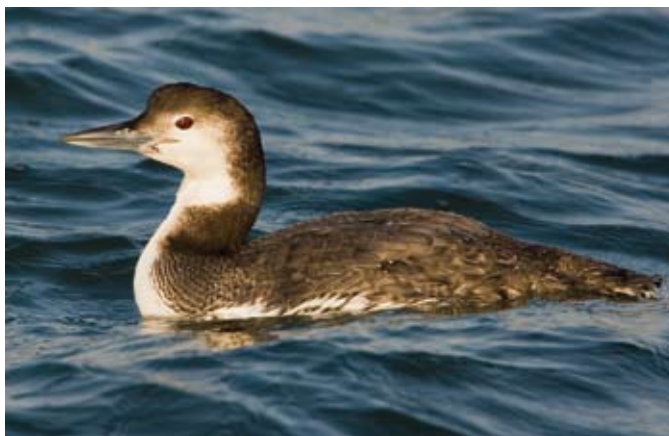
The Wintering Waterbird Surveys demonstrated that Long Island Sound is a very important wintering and staging area for migratory waterbirds, like this common loon.

The whip-poor-will, named for its call, is a unique insect-eating bird that feeds in open areas at night. Data are lacking on whip-poor-wills; however, all indications suggest they are experiencing a long-term decline. Because of the bird's nocturnal habits and cryptic nature, standard survey and monitoring techniques do not work well. As a result, long-term data that could be used to quantify whip-poor-will population status or to understand population declines have been sparse. Obtaining this much needed information on whip-poor-wills in the Northeast has been a long-term goal of state biologists and