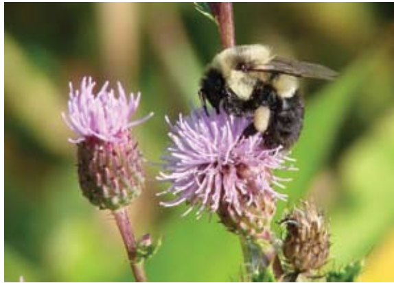
Many eastern bee species are declining rapidly. The large, familiar bumblebee, which was common less than a decade ago, is now rare.

Many eastern bee species are declining rapidly. The large, familiar bumblebee, which was common less than a decade ago, is now rare. There is growing concern that a number of North American bumblebee species are sliding toward global extinction. In an effort to address these serious and immediate conservation challenges, a tremendous amount of data on Connecticut bees has been collected and evaluated during 2007-2009 through a SWG-funded collaborative project with