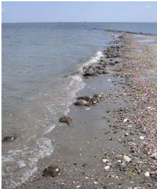
In 2008, the DEP and University of Connecticut initiated a SWG funded study to identify the habitat characteristics that determine the selection of a spawning beach by horseshoe crabs and which beaches are the most critical spawning locations.

selection of a spawning beach by horseshoe crabs and which beaches are the most critical spawning locations. Horseshoe crabs provide direct economic value by supporting a small