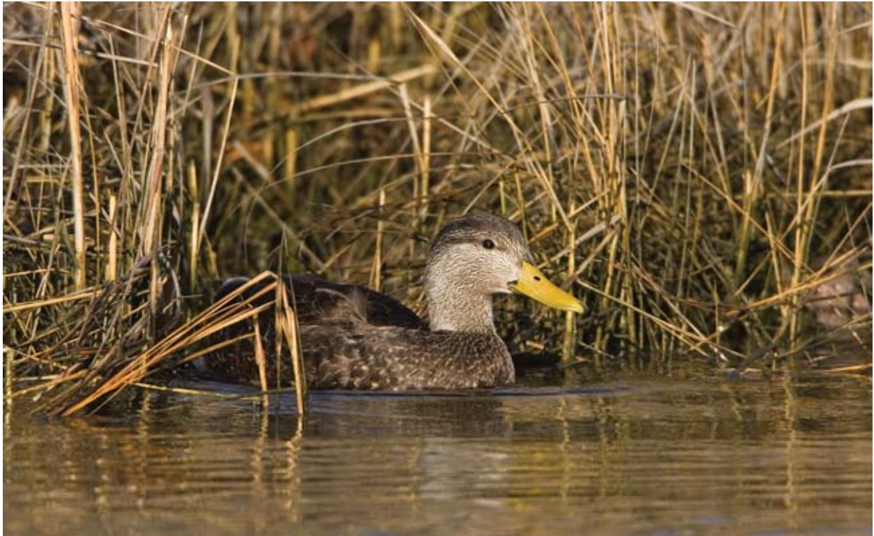
P. J. FUSCO

Since 2001, the State Wildlife Grants Program has provided funding for over 50 projects that have greatly benefitted knowledge of the distribution and abundance of wildlife species of greatest conservation need (GCN) in Connecticut and the factors limiting their populations. The American black duck, which is considered a very important GCN species, is currently the focus of a project studying habitat use, carrying capacity, and winter survival.