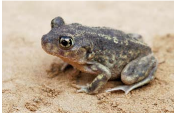
In 2008, a State Wildlife Grant project was initiated to determine movement patterns of the eastern spadefoot toad, a Connecticut endangered species. Project results will give land managers baseline information for prioritizing land protection efforts.

SWG funds have allowed the DEP Wildlife Division to conduct a two-year study on wood turtle populations in Fairfield County to collect baseline data in highly impacted areas. Visual wood turtle surveys were conducted from March 2007 through June 2008 in various rivers and streams throughout the county. Biological data (age, weight, and sex) were taken from all individual turtles found and habitat use was recorded. Each turtle was individually marked for future identification. Two previously documented populations were verified and three new populations were discovered as a result of this study. The aquatic and terrestrial habitats