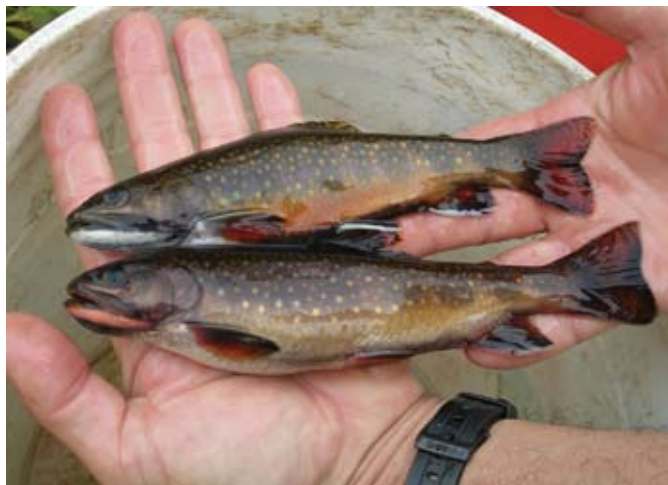
University of Connecticut and DEP Fisheries Division biologists are collaborating on an investigation of brook trout populations in two headwater stream channel networks in Connecticut.

Field work started in summer 2008. Genetic samples (fin clips), information on the movement of individual fish, and data on population abundance were collected. Stream water temperature data are being collected using temperature loggers. In general, brook trout distributions were not uniform along the stream networks, and many adult fishes moved upstream, sometimes into tributaries and up to 1.2 miles during