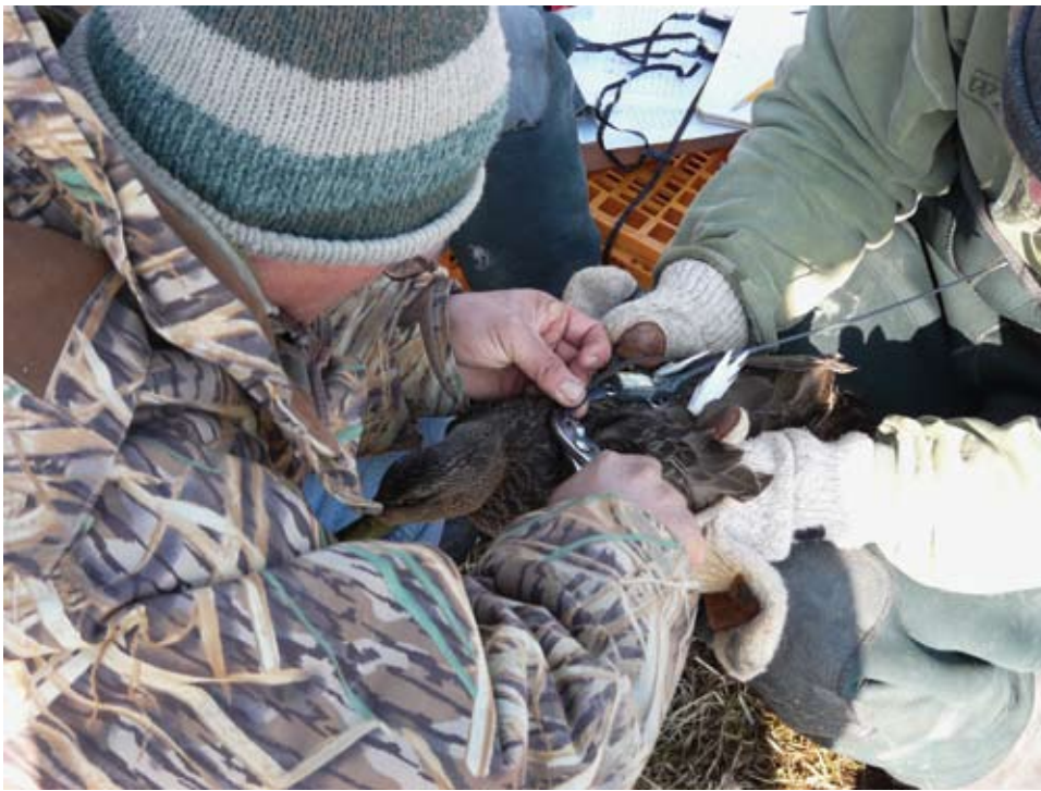
The SWG Program has provided funding for a project to determine habitat use, carrying capacity, and winter survival of black ducks in Connecticut. The project involved the use of radio transmitters to track movements and survival of the ducks.

food resources were also collected. When this study is completed, wildlife biologists will be able to determine whether wintering black ducks use all available habitat or whether human disturbance, development, or amount of open water on the marshes affect black duck use.