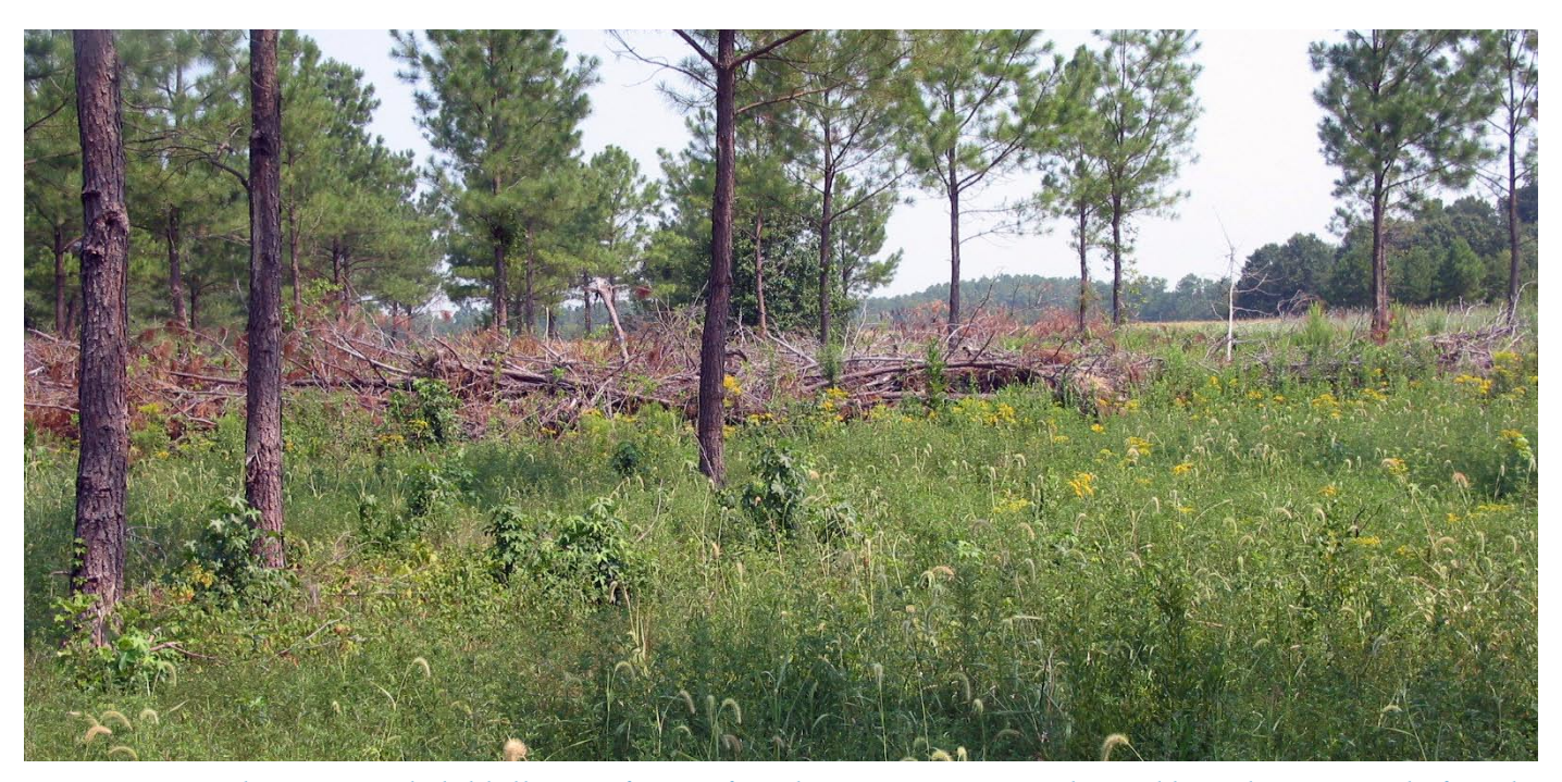
Figure 4. This previously loblolly pine forest of Buck Range Farm was thinned heavily one year before the photo was taken. A lush understory of native plants has been established, providing ideal habitat for a variety of early-successional species.

A large portion of the pine forests on Buck Range Farm have been either commercially harvested using clearcuts or non-commercially thinned. Both practices have been successful in increasing habitat quality for early-successional species. Two recent clearcuts totaling about 40 acres produced high-quality habitat for quail for five to eight years while providing additional income from timber sales (see cover type map). Perhaps more beneficial and visually attractive was the thinning of about ten acres of loblolly pines. Approximately 70% of the pines were cut and piled in windrows. The additional sunlight encouraged an understory of native grasses and forbs to revegetate, creating ideal food and cover for bobwhites while the windrows provided the benefit of additional escape cover for quail and cottontails. Korean lespedeza is often sown where tree thinnings have occurred to offer winter food and spring nesting areas for quail. Prescribed fires are used every three to five years in February or March to control common volunteer species such as sweetgum and oak, while the overstory pines are left alive. The burning rejuvenates the site, producing lush herbaceous growth at ground level. Refer to the prescribed burning section of chapter 10 for more details on the use of fire to enhance habitat.