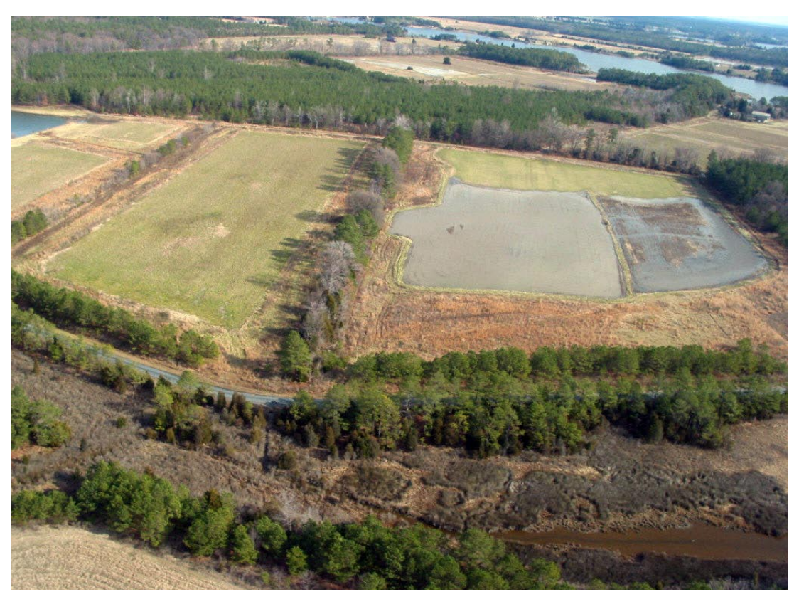
Figure 5. The proximity and arrangement of crop fields to other habitat types, such as field borders and hedgerows, creates favorable conditions for bobwhite quail.

Cropping is an important component of the Buck Range Farm management regime, both to provide food and cover for wildlife as well as farm income. Corn, soybeans, or sorghum is planted annually on the 85 acres of existing cropland, with minimal use of pesticides and herbicides. Cropland is only tilled one out of four years, with no-till planting methods used the remainder of the time. Although cropland is primarily managed as a wintering waterfowl food source, the proximity and arrangement of crop fields to other habitat types, such as field borders and hedgerows, create favorable conditions for bobwhite quail.