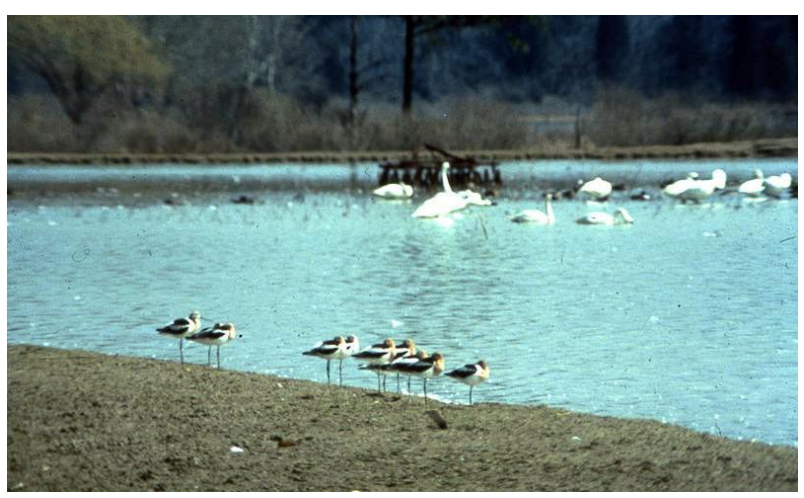
Figure 6. Waterfowl and upland habitat management can work together. Disking is used to improve habitat for thousands of ducks, geese, and wading birds, but the disk is an equally important tool for maintaining bobwhite quail habitat on Buck Range Farm.

Two ten-acre impoundments were constructed in the 1990s to provide wintering waterfowl habitat. Interestingly, these areas have also been beneficial to bobwhite quail. The impoundments are drawn down in early spring to encourage annual seed-producing plants. Because the areas are essentially dry and fallow in the summer months, first year vegetation and bare ground are abundant, creating preferred bugging areas for bobwhite broods. In autumn, the impoundments are filled by natural rainfall during autumn, producing high-quality waterfowl and wading-bird habitat.