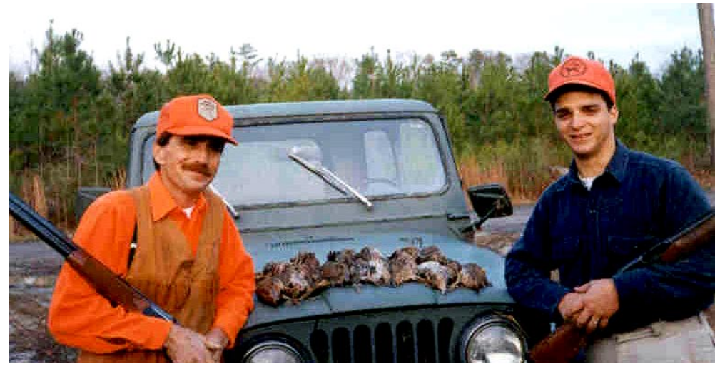
Figure 1. A hunt at Buck Range Farm is like going back in time to the "good-old-days."

Most young hunters would love to see what it was like in the "good-old-days", to experience the days afield that they hear their fathers and grandfathers telling stories about. Likewise, the older generations, the ones that tell the stories, would love to re-live the experiences that live vividly in their memories. On the Eastern Shore of Maryland, most story-telling sessions turn to the 1950s and 60s, when wildlife was plentiful. It was a time when waterfowl hunting on the Chesapeake Bay was a way of life and every respectable hunter had a good bird-dog. Unfortunately, the good-old-days are just a memory for most. Waterfowl populations have suffered with increased pollution of the bay, and bobwhite quail have declined over 90% since the 1960s due to changing land uses.