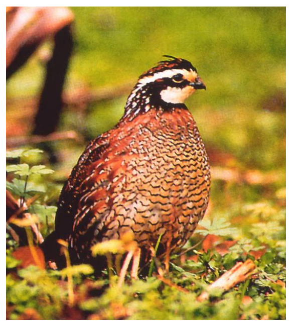
Figure 7. Bobwhite quail have disappeared from most farmed landscapes, but Buck Range Farm still harbors 15 to 20 coveys of wild quail each year.

The benefits of the intensive habitat work on Buck Range Farm are evident simply by walking around the property. In the spring, whistling bobwhites, gobbling turkeys, and an array of songbirds such as eastern meadowlarks and field sparrows can be heard everywhere. Autumn and winter are the times when the landowner's attention turns to hunting, a favorite pastime. Prior to the intensive upland habitat management, there were fewer than five bobwhite coveys on the entire farm. Covey numbers have increased over 300%; the farm now holds 15 to 20 coveys of wild bobwhites. Prolonged snow cover in the winter of 1996 temporarily reduced the number of breeding pairs, but with suitable habitat the population quickly rebounded within two years. Since that time, a typical afternoon hunt results in five to ten covey flushes. Habitat management of the wetlands also has produced desired results; harboring 500 to 1,000 puddle ducks annually, including mallards, widgeons, and pintails.