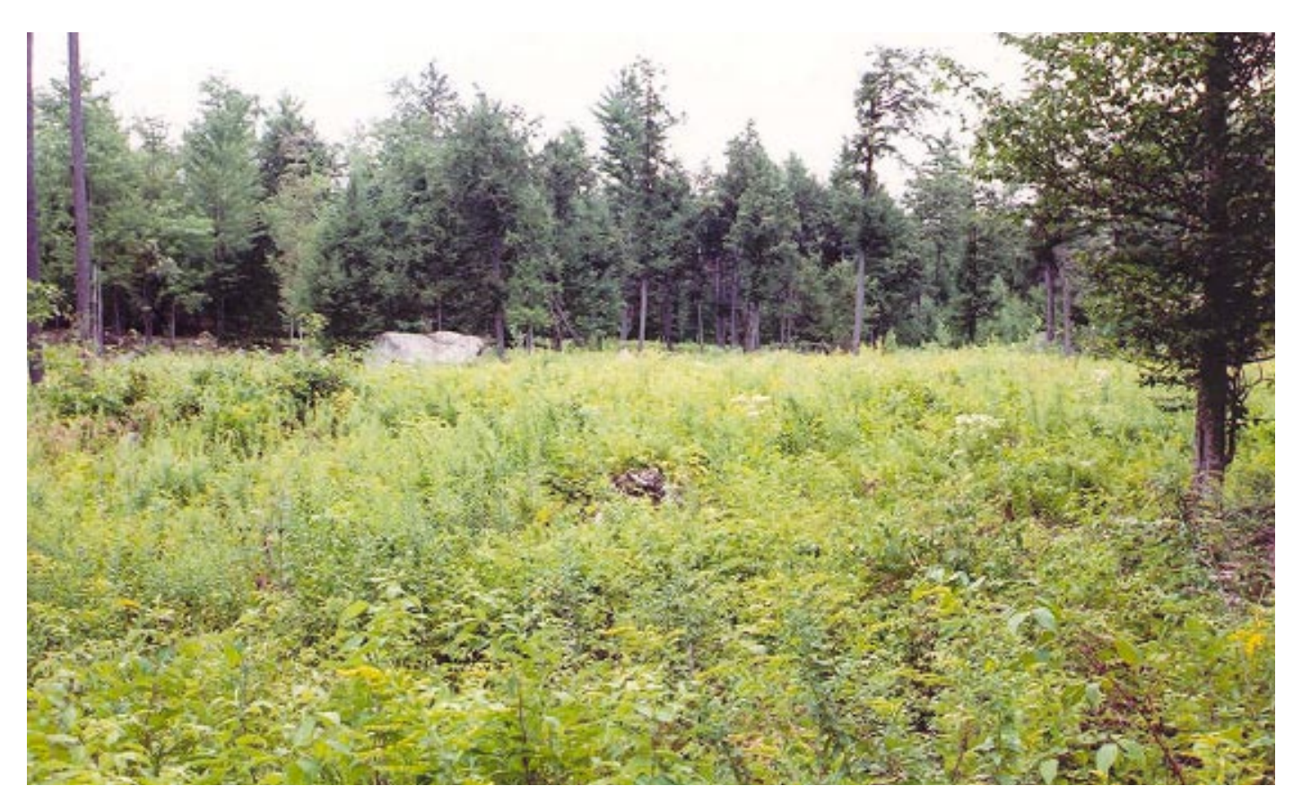
Figure 4. A portion of the five-acre opening four months after being mowed by a Brontosaurus. A diversity of grasses, ferns, berry-producing shrubs and young trees are already establishing within the opening. The landowner did not seed or plant this area, but rather, allowed plants to regenerate naturally.