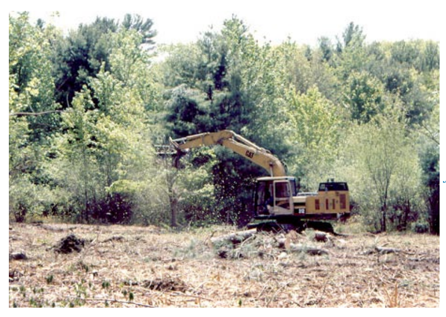
Figure 2. A Brontosaurus grinding or "mowing" a tree. All that remains of mowed trees are small strips of wood fiber on the ground.

Brontosaurus operator was instructed to leave a wider 100-foot buffer of dense hemlocks along the edge of the Lamprey River as an undisturbed riparian corridor for wildlife. Additionally, all berry-producing shrubs were retained. By the end of the day, a five-acre opening, with only scattered remnant trees had been created.