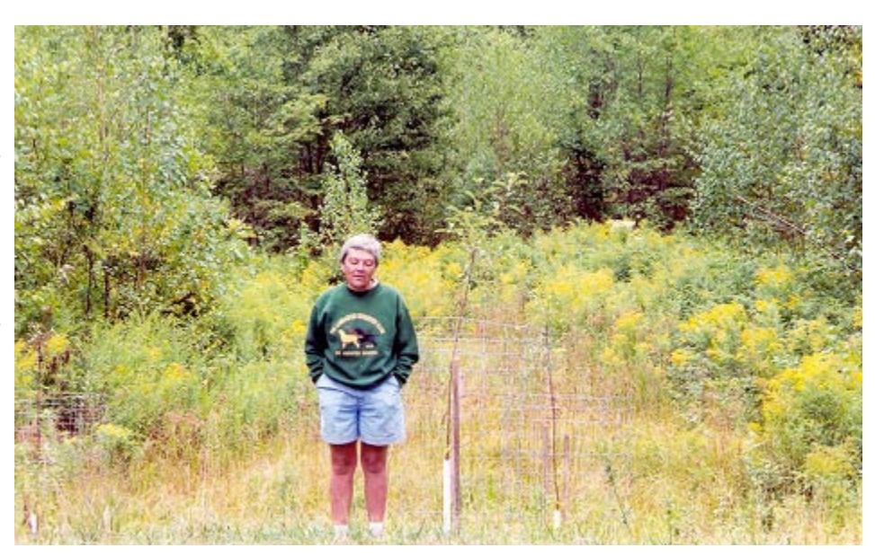
Figure 3. The landowner and two of the 20 crabapple trees she planted as part of her wildlife habitatimprovement project. Trees have been fenced to help reduce damage from antler rubbing and browsing by deer.

In May of the same year, the landowner planted 20 crabapple trees along the edge of the newly created five-acre opening. These trees were donated as part of a wildlife habitat improvement program sponsored by the New Hampshire Fish and Game Department.