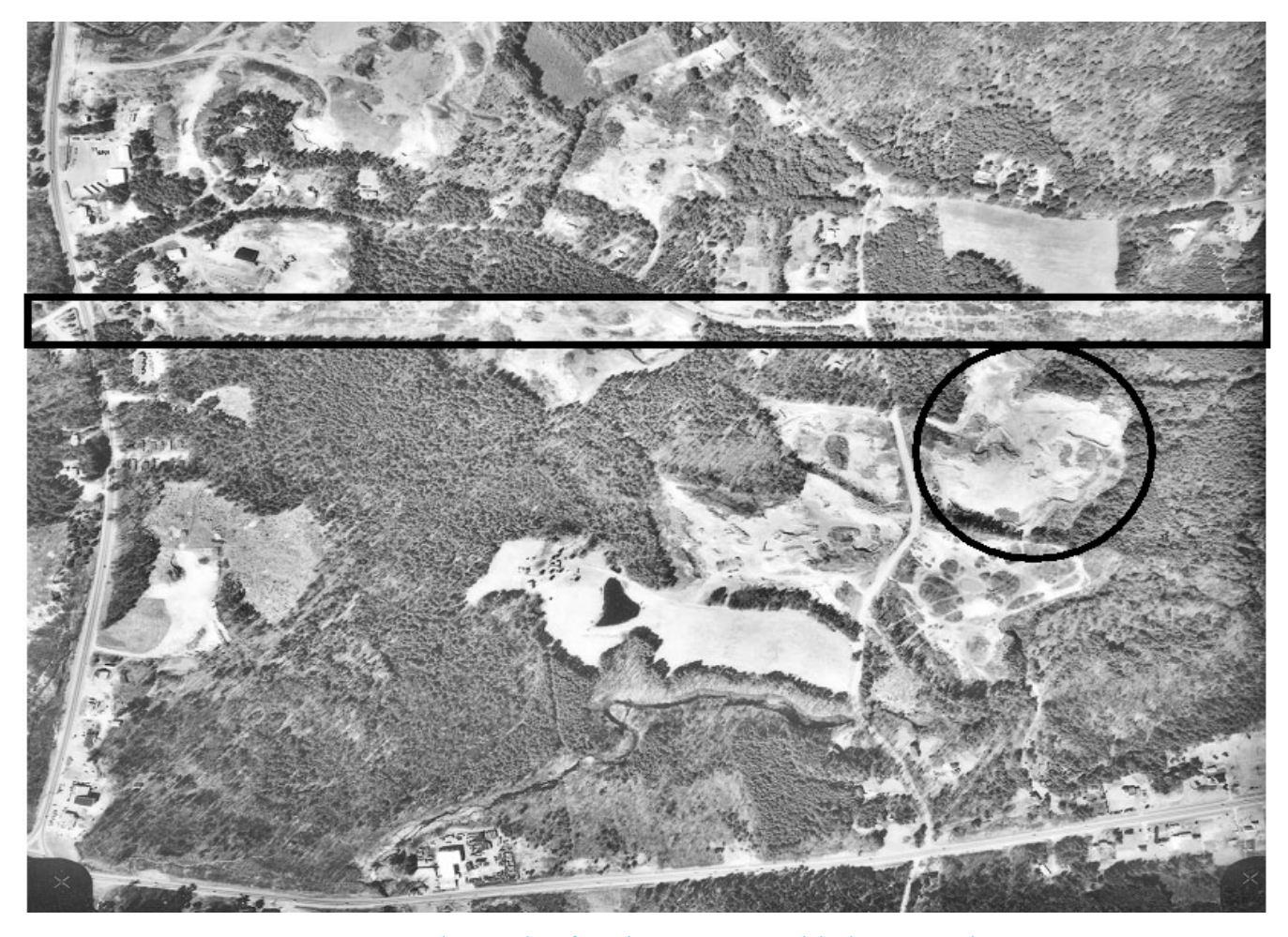
Figure 3. Positioning managed parcels of early-successional habitats in close proximity to existing land uses like powerline-rights-of-way can maximize the benefits of contemporary land uses. In this aerial photograph, an aerial successional habitat (outlined by the circle) is next to a powerline that may serve as additional habitat and a dispersal corridor.

From these examples, it should be clear that approaches to managing wildlife habitats are often dependent on the surrounding landscape. But some of the factors that influence management are best described at a spatial scale even larger than a landscape.