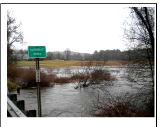
Figure 8 March 30, 2010 Flood

Mashamoquet Brook is not used as a navigation channel. The Quinebaug River once served as a navigation channel. Goods were loaded onto boats at Pomfret Landing near the convergence with