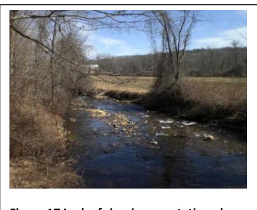
Figure 17 Lack of riparian vegetation along Mashamoquet Brook DS Wolf Den Drive.

A portion of the western bank along Wappoquia Brook between Day Road and the Day Brook convergence, also on the Bafflin Sanctuary, has collapsed. This may be related to upstream development that may be increasing water flow during storm events.