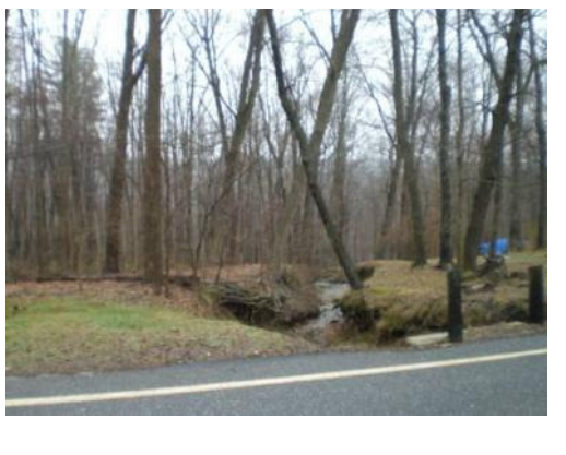
Figure 15 Murdock Road Storm Drain Outlet

development in the watershed is an important factor. As part of the CLEAR's Connecticut's Changing Landscape project, an analysis was made to determine the amount of development in riparian zones of 100 foot and 300 foot widths. The data indicated that there were 1,880 acres of developed land in town in 2006. Of these 1,880 acres, 133 of the developed acres were located within the 100 foot stream buffer and 452 acres were located within the 300 foot stream buffer. The numbers also reflect that there has been less than a 1% increase in development in the riparian areas between 1985 and 2006.