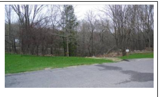
Figure 16 Pomfret Town Hall Drainage

The Pomfret Town Hall driveway to the rear parking area is designed with a stormwater leakoff at the top of slope that drains towards Abington Brook. The site lacks any stormwater retention areas. An access trail that connects with the Airline Trail State Park originates there. The area has been seeded, but minor erosion rills were evident during an April 25, 2011 site visit.