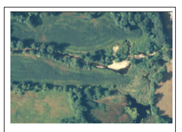
Figure 18 2010 Aerial view of Wolf Den Drive corn fields showing bank erosion.

An additional significant area lacking riparian cover and a stream bank collapse was noted adjacent to a farm fields. Mashamoquet Brook between Wolf Den Drive and property owned by Loos and Company, Inc was reported to have limited riparian cover in a 2004 Stream Walk report. A review of the 2010 aerial images on the Connecticut EcoMap website demonstrated a significant area of bank erosion adjacent to this agricultural area.