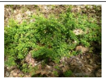
Figure 10 Japanese barberry

Japanese Barberry, Berberis thunbergii , a plant listed as invasive on the Connecticut Invasive Plant Species List, is present in the understory of the wooded slopes uphill from Mashamoquet Brook in Mashamoquet Brook State Park.