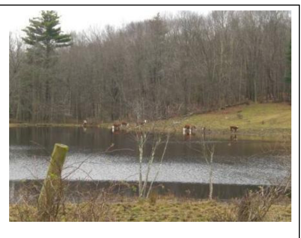
Figure 13 Cows wading in a pond in Pomfret, CT

On average, a 1,000 pound horse can generate 8-10 tons of manure a year, accumulating at the rate of approximately 0.75 cubic feet per day. This equates to roughly 12-15 cubic yards of manure annually. Daily waste production per horse may consist of 30 lbs of feces plus 20 lbs of urine. Manure contains plant nutrients, soluble and insoluble organic compounds, and bacteria. An informal survey conducted at a meeting with the Pomfret Horse and Trails Association indicated that horse owners are interested in guidance on manure management practices. None reported covering their manure pile as a standard practice.