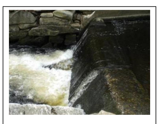
Figure 9 Water Diversion Dam at MBSP

A notched cement dam is located in Mashamoquet Brook State Park where the water is diverted to the swimming pond. This dam has two pipes through it that are open to water flow in the non-bathing season. During the summer bathing season, the pipes are blocked by boards to impound water behind the dam and allow water to flow through the piped diversion to By Pass Pond.