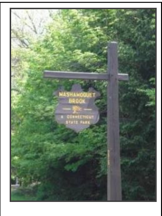
Figure 1 Park Entrance

Mashamoquet Brook (CT 3710-00) is located in the town of Pomfret, CT. Years of water quality monitoring at Mashamoquet Brook State Park indicate that the brook does not meet required standards for recreational contact due to exceedances of Escherichia coli bacteria ( E. coli ). The Mashamoquet Brook State Park swimming area, which is fed by a diversion from Mashamoquet Brook, experiences periodic closures due to water samples exceeding E. coli standards for recreational contact. Water samples from the brook upstream of the pond diversion also exceed standards for recreational contact.