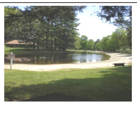
Figure 2 By Pass Pond

Mashamoquet Brook State Park is a 900 acre park located in Pomfret, Connecticut. It is managed by the Connecticut Department of Energy and Environmental Protection<sup>1</sup> (CT DEEP). The day use area of the park includes a public swimming area that is gravity fed by a diversion from Mashamoquet Brook. The pond has been referred to as By Pass Pond in Off the Beaten Path , a travel guide published by Readers Digest in 1987. It is also referred to as Braytons Pond in the Connecticut Environmental Online