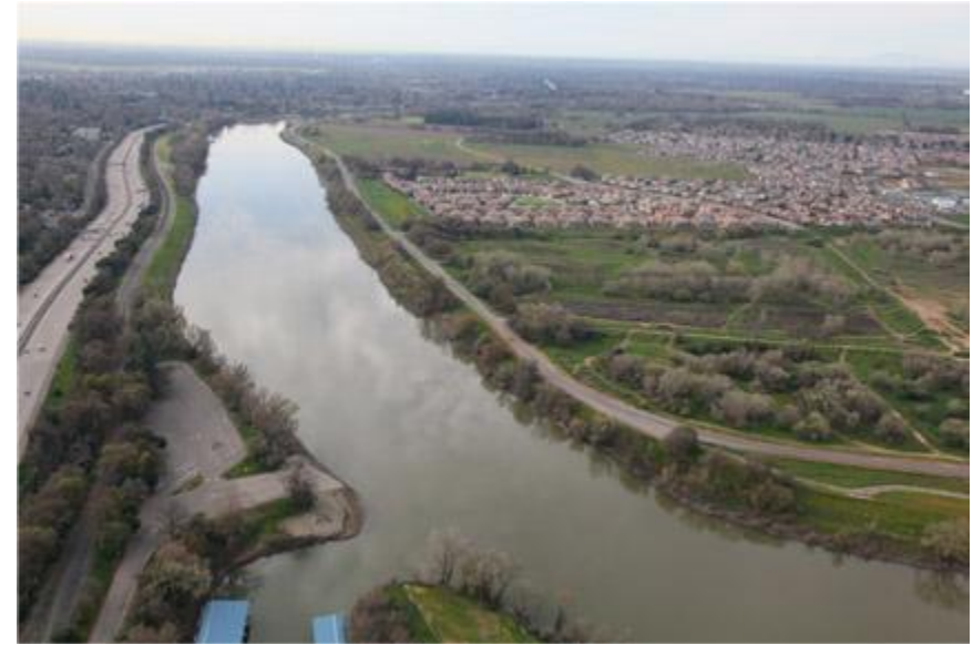
Figure 1 - Sacramento River at Miller Park, Sacramento, California

Emergency planning may cover other key aspects such as potential assembly or staging areas for flooding events, location of earth borrow sites, and procedures for maintaining records of equipment, manpower, and supplies. Understanding no plan can guarantee that a levee system will not fail under all circumstances, levee owners and operators are encouraged to work with local public safety officials to assist them in developing effective evacuation plans.