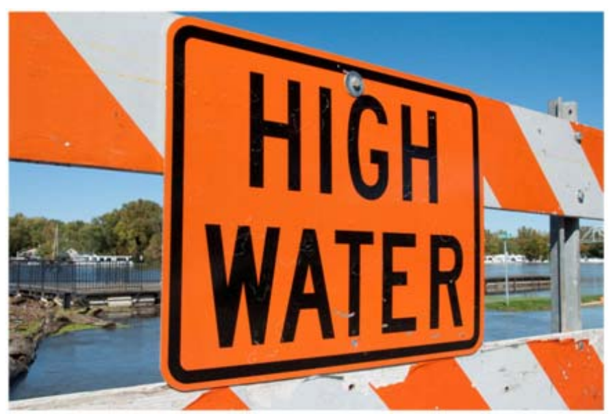
Figure 5 - Road in Red Wing, Minnesota, is closed due to flooding

While not responsible for developing an evacuation plan, levee owners and operators are encouraged to maintain close contact with appropriate government agencies during emergencies to provide timely and accurate information on levee conditions.