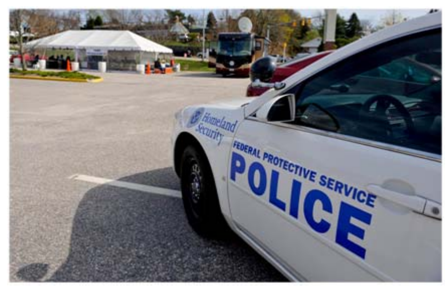
Figure 4 - Law enforcement agencies assisting with flood response in South Kingston, Rhode Island