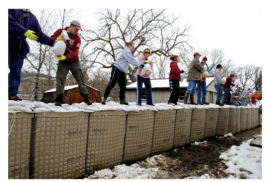
Figure 7 - Volunteers raising emergency levee in Valley City, North Dakota