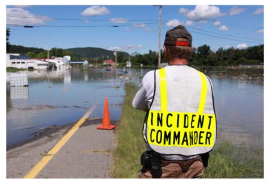
Figure 8 - Incident Commander observes damage caused by flooding in Westminster, Vermont