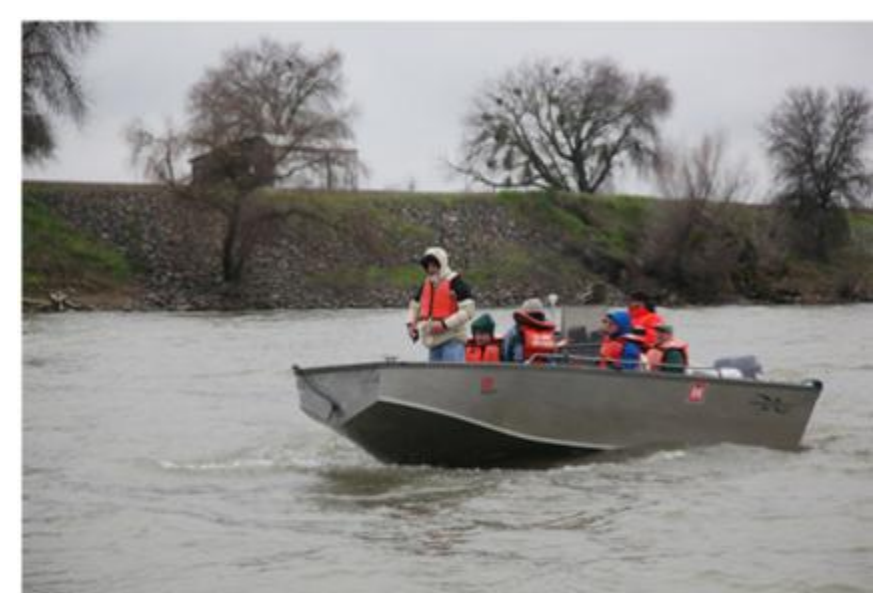
Figure 2 - Levee inspection by boat

Emergency Preparedness Guidelines for Levees