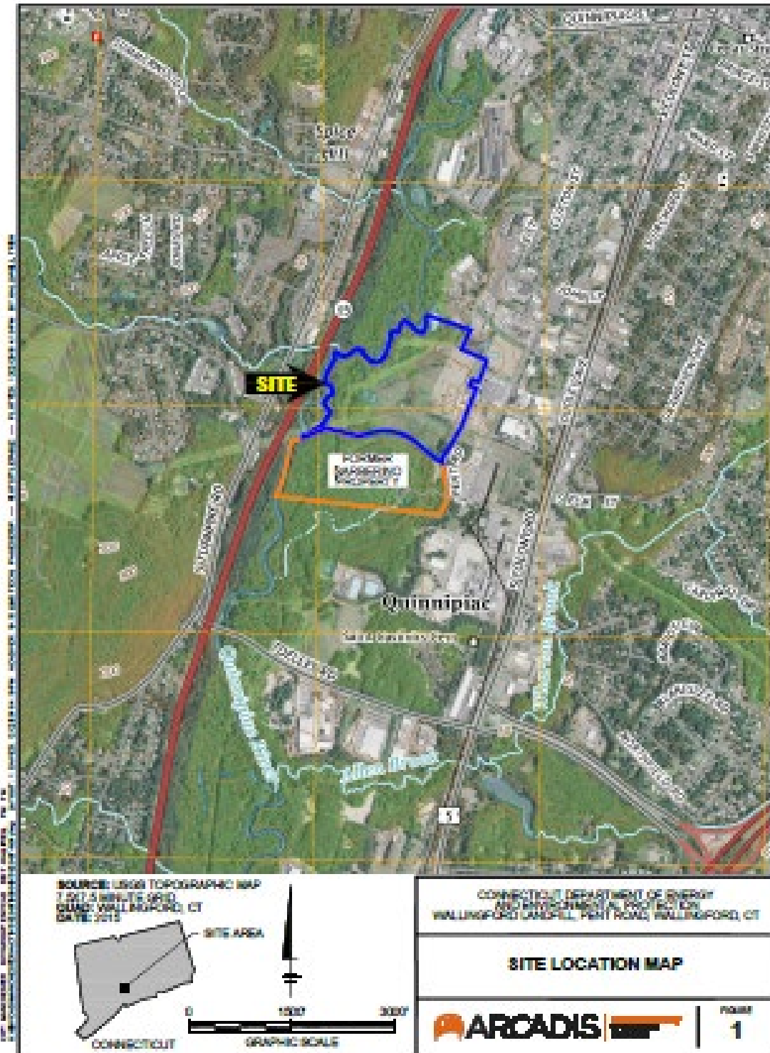
Figure 1 Site Location