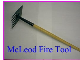
McLeod Fire Tool