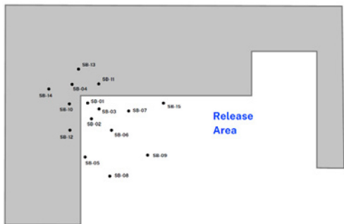
Figure 1 Example: Unclear presentation of lateral extent of pollution