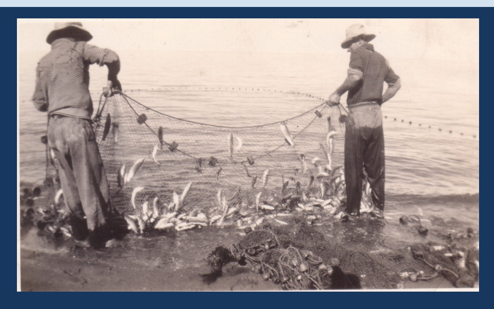
Casts a small net

Low risk sites can be ensnared in the net