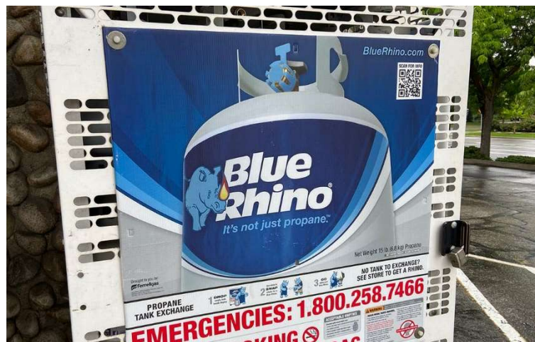
Figure 1: Blue Rhino Exchange Cage

created the robust exchange network present at most outdoor recreation retailers, hardware stores, grocery stores, and convenience stores. All cylinders that enter PGANE members' exchange programs are properly transported, evaluated, and refilled, refurbished, or recycled.