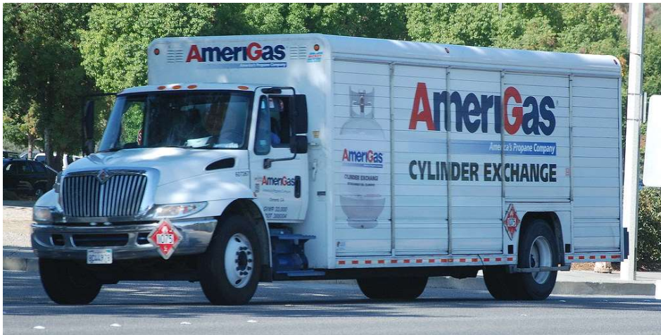
Figure 3: AmeriGas Cylinder Exchange Truck