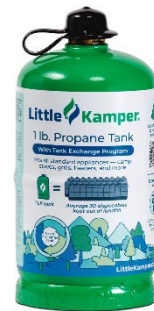
Cylinder waste from Yosemite Cylinder processing to capture unused fuel Little Kamper cylinder

Little Kamper exists to eliminate the waste created by single-use 1 lb. DOT 39 propane cylinders.