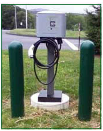
Vehicle charging station

agreement between the Governor's office and Nissan North America. Both carmakers chose the state because of its commitment to clean energy. Because EVs offer environmental, economic and energy benefits, the goal is to have 25,000