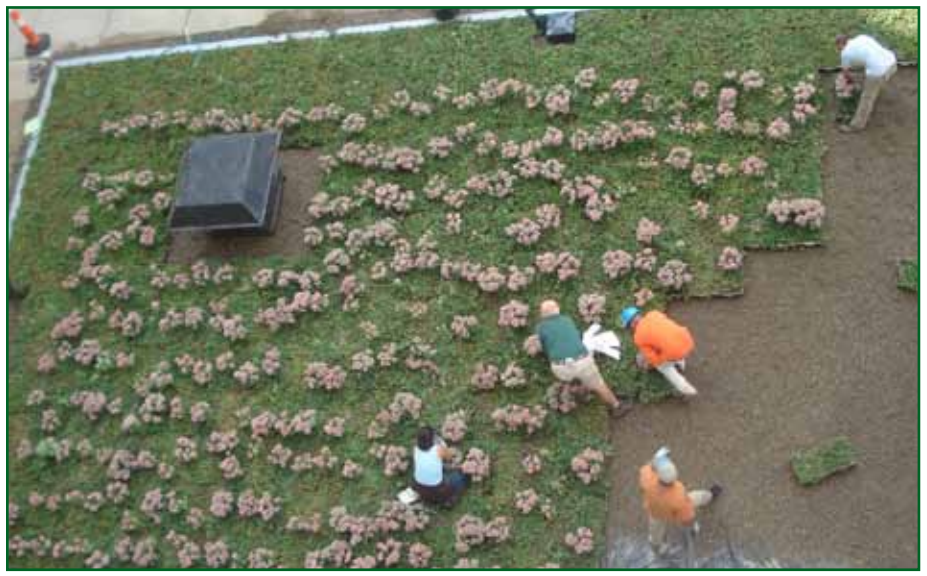
Installation of a green roof at the State Capitol.

Our urban areas have a considerable amount of concrete and blacktop. Just think of all the roads, sidewalks and parking lots that surround the State Capitol building in Hartford. As rain runs off and over these "impervious surfaces," it picks up pollutants like oil, dirt, pet waste, pesticides and fertilizers that can end up in nearby streams and rivers. If it's a really big storm, the storm drains (also known as catch basins) can become overwhelmed and stormwater may back up into streets and basements.