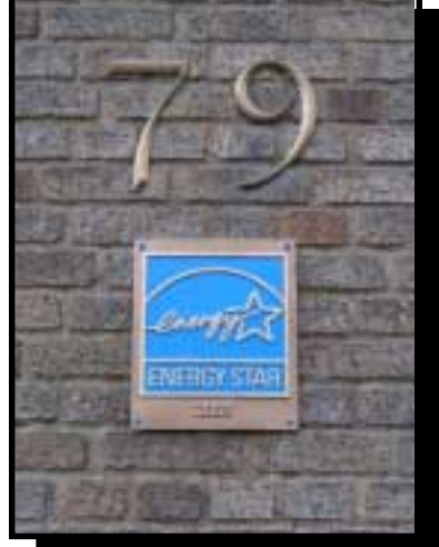
79 Elm Street is an Energy Star!

Clean energy is not something we just talk about at the Connecticut Department of Environmental Protection (DEP). On November 2, DEP took action to become the first and only state agency to take advantage of the clean energy option now available and is powering the agency with 100% renewable energy. The energy will come from wind, landfill gases and small hydro-electric plants.