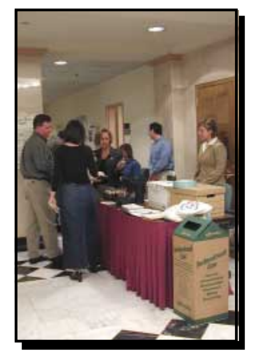
DEP employees hold Techno Trash event

For example, the U.S. Environmental Protection Agency (EPA) states that every month approximately 100,000 pounds of CDs become outdated, useless or unwanted and more than 5.5 million boxes of software go to landfills or incinerators. CDs and DVDs are made from mainly plastics and metals, such as aluminum, polycarbonate (a type of plastic made from crude oil and natural gas), lacquer made from acrylic, gold, chemical dyes partially made from petroleum products, and numerous other materials such as water, glass, silver and nickel. When they are manufactured and eventually disposed, they can release chemicals that contribute to global warming and create environmental and health problems. When we "reduce" - like borrowing a DVD from the library instead of buying it, reuse or recycle them, we conserve natural resources and decrease the quantity and toxicity of our trash.