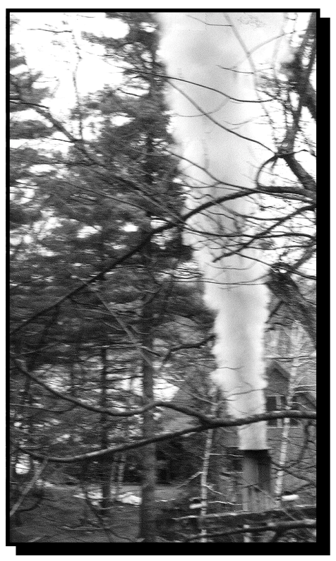
Smoke from outdoor wood-burning furnace

In Connecticut, DEP requires the smoke from combustion sources including OWBFs and woodstoves to meet strict opacity (smoke) limits. OWBFs, as well as older indoor woodstoves manufactured prior to the 1988 EPA regulations, are very likely to violate DEP regulations and