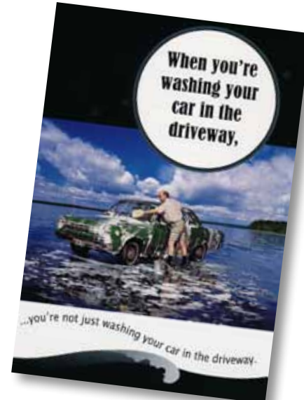
A Citizen's Guide to Curbing Stormwater Pollution: Long Island Sound Study

When you wash your car on a nonporous surface (like asphalt), the dirt, grease, grime and suds wash off your car, flow down the driveway, then along the street and eventually find their way into the nearest storm drain. From there, the dirty water and cleaning chemicals can empty directly into our lakes, streams, rivers, and eventually Long Island Sound. This polluted water has an environmental impact not only on water bodies, but can also affect plant and aquatic life. And it's not too good for those of us who like to swim or fish in these waters! Continued on page 3