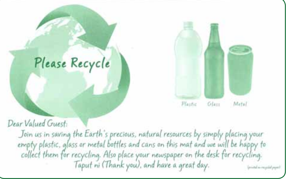
Recycling is made easy for guests at Mohegan Sun with a place mat on the desk for collecting recyclables.

As you step into Mohegan Sun, you are greeted with its excitement and grandness. But underneath all that, its day-to-day operations are quietly guided by an environmental mission that includes "protection of the Tribe's land, air, and water and preventing the deterioration of natural resources" while "ensuring the safety and health of all tribal members,