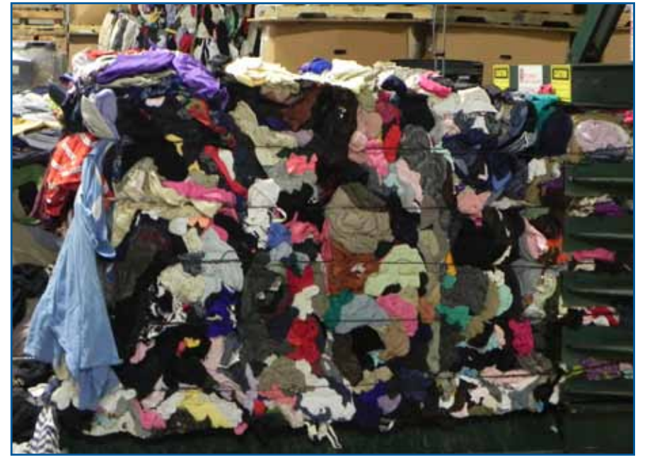
Baled textiles headed for reuse.

So please remember to donate EVERYTHING! Most of the major charities, such as Goodwill Industries and Salvation Army participate in SMART. Some smaller, local organizations and churches may not, so check with them first.