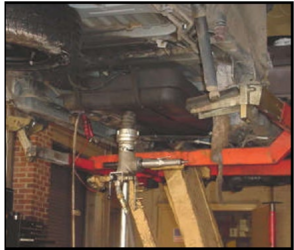
Removing gasoline with a tank drilling machine