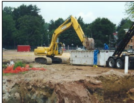
Removal of soil contaminated by a leaking underground storage tank

Petroleum storage tanks have the potential to leak into the environment. Just one gallon of gasoline can contaminate the water supply for 50,000 people and is toxic to fish and other aquatic life. Ignitable vapors from leaking tanks can collect in places such as basements or sewers, potentially causing fires or explosions. Gasoline vapors also contain significant amounts of air toxics, including VOCs (volatile organic compounds) which negatively affect our air quality.