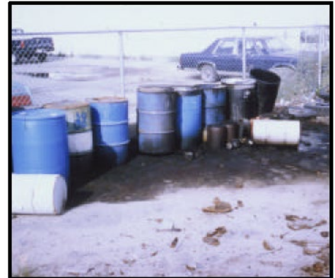
Improper used oil storage: leaking unlabeled drums on the ground.