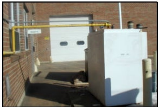
Double-walled above ground storage tank