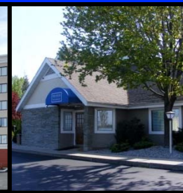
PREMIERE HOTEL HAWTHORN SUITES & SUITES