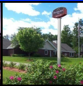
MERRIMACK RESIDENCE INN