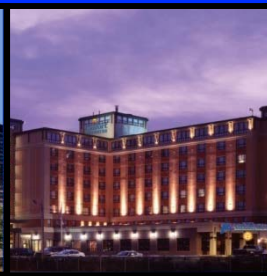
COMFORT INN & SUITES