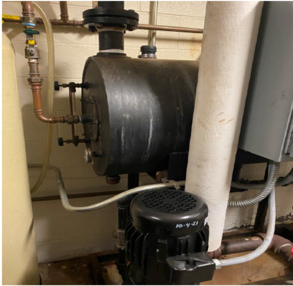
Un-insulated Boiler Condensate Tank and Piping