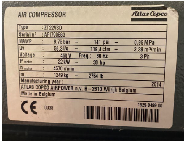
Existing Standby Compressor