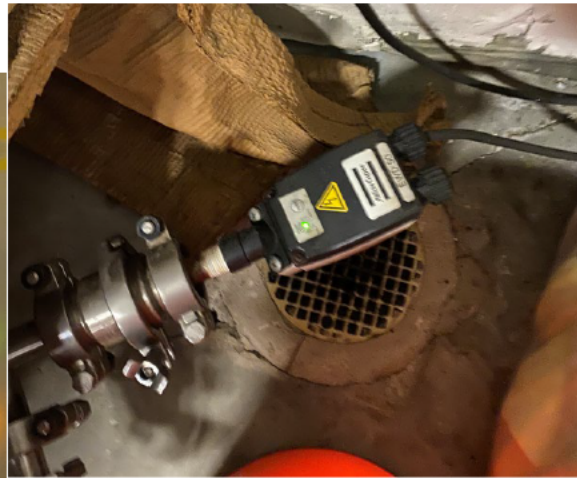
Zero Loss Condensate Drain