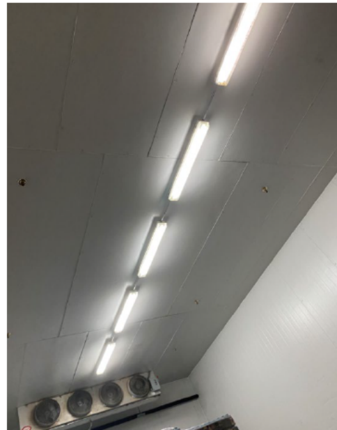
Cooler Fluorescent lighting