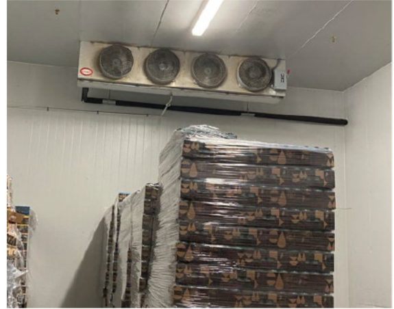
Cooler Evaporator (typical)