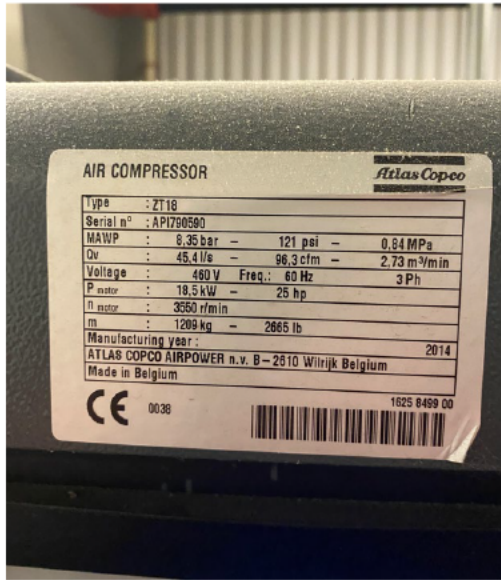
Existing Lead Compressor