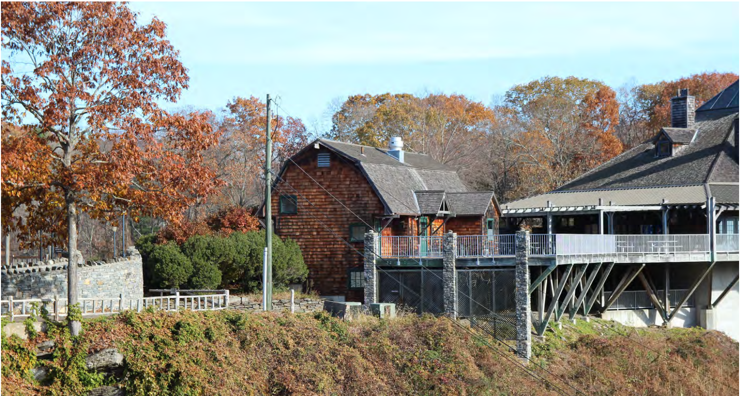
Rear exterior adjacent to Visitors Center