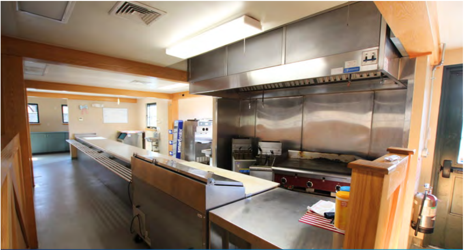
Grill and service line