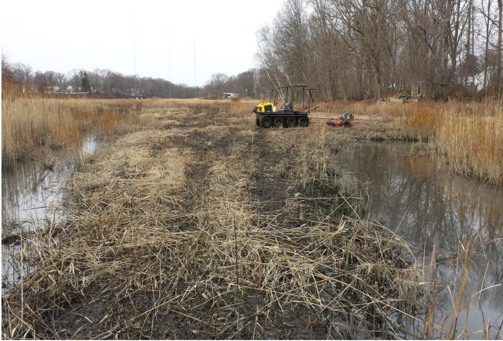
Snowy Egret Wetlands Service mowing in Milford in the fall of 2014