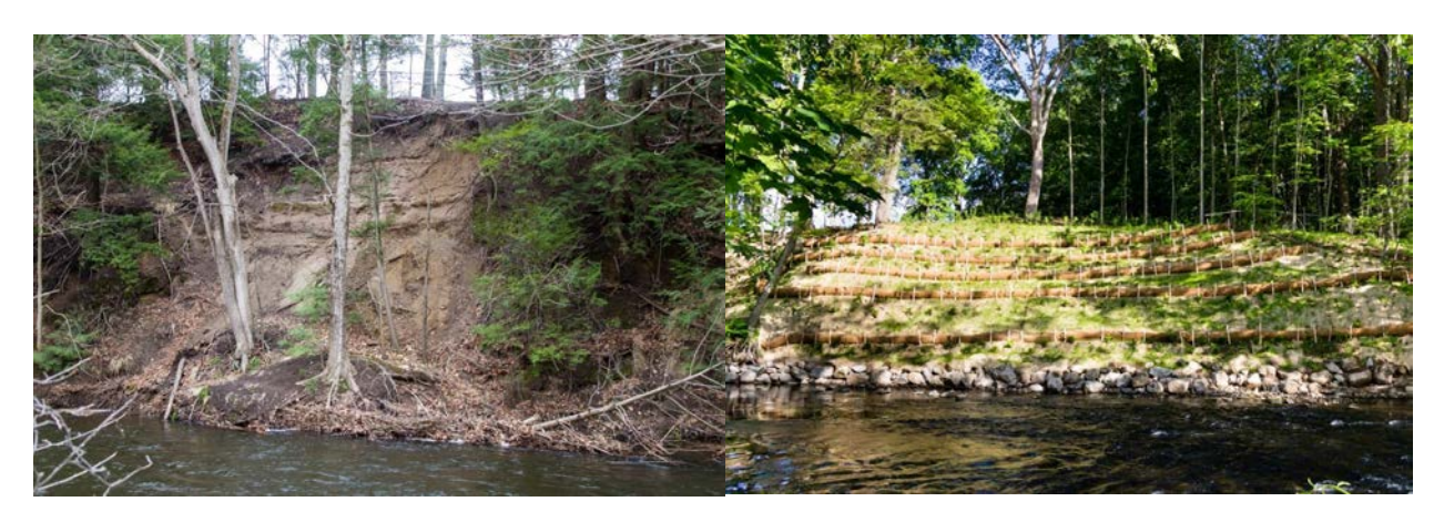
Before and after pictures of the east bank of the Pomperaug River in Southbury, CT

The Pomperaug River is an important recreational fishery in Connecticut. It also forms the western boundary of the town of Southbury's Ballantine Park. The riverbank is steeply sloped and portions of the streambank within the park had become unstable; with severe erosion occurring as a result. As part of the Housatonic River NRDAR settlement, the Service and the town entered into a Cooperative Agreement to stabilize the streambank utilizing bioengineering restoration techniques and native vegetation to improve riparian habitat. An unexpected benefit of the project was that a previously unknown archeological site dating from the Archaic Period (6,000 to 2,700 BP) was found. This Native American site was discovered during survey work done in accordance with Section 106 of the National Historic Preservation Act (NHPA) through an MOA with the Mohegan Tribe and the State Historic Preservation Office. Stabilizing the riverbank has halted the degradation of this site and artifacts found during the survey were archived for use in the future. For more information, contact Drew Major at <a href="mailto:andrew_major@fws.gov">andrew_major@fws.gov</a> or (603) 227-6413.