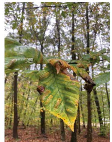
Figure 3.—Advanced symptoms of BLD with chlorotic striping.