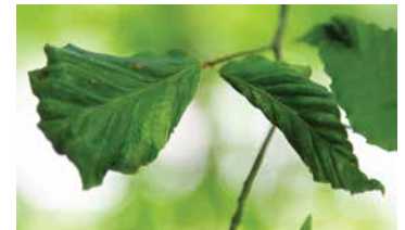
Figure 2.—Banding appearance and shrunken leaves associated with BLD.