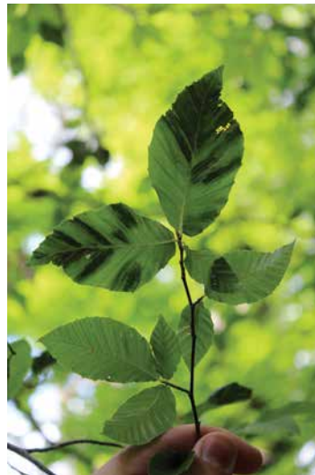
Figure 1.—Banding appearance associated with BLD.

BLD appears to be spreading, particularly from west to east based on the number of new county detections in 2019 and 2020. Insect or avian vectors as well as human-mediated movement of the nematode are possible modes of its dispersal that are currently being studied. There is likely a delay between initial nematode infestation and BLD detection as L. crenatae has occasionally been confirmed in asymptomatic tissue at the molecular level.